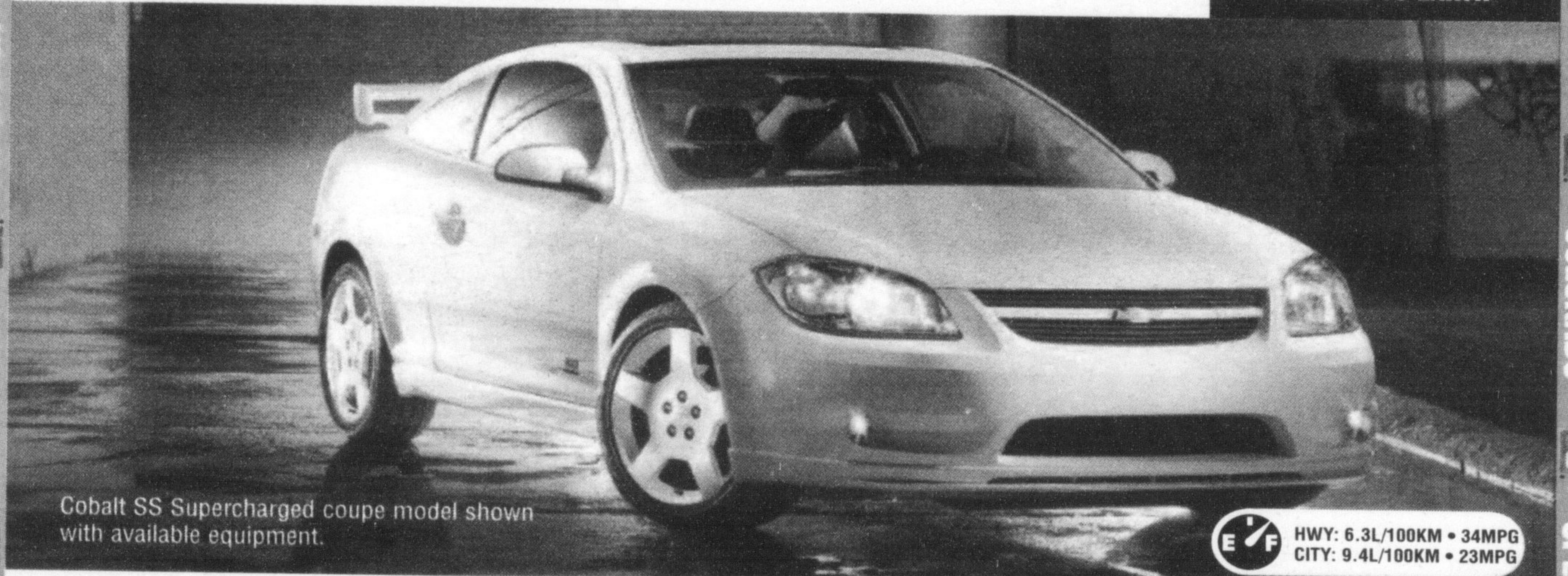
Cobalt SS Supercharged coupe model shown with available equipment.

CIVIC CAN'T KEEP UP ON PAPER. OR ON THE ROAD.