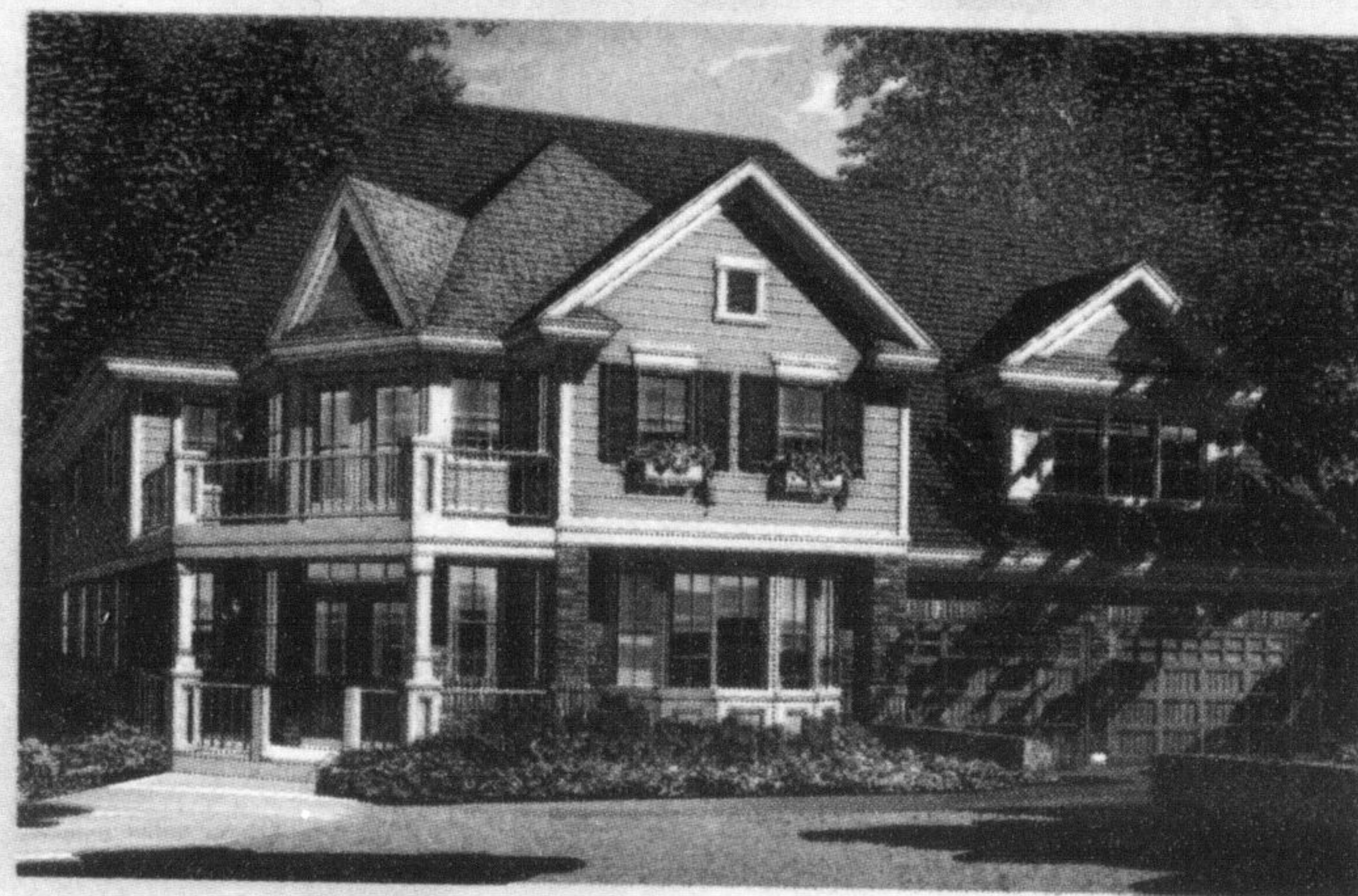
56' WideLot™, The Wadsworth II 'A', 3,598 Sq.Ft., $493,990

The ENERGY STAR mark is administered and promoted in Canada by Natural Resources Canada.