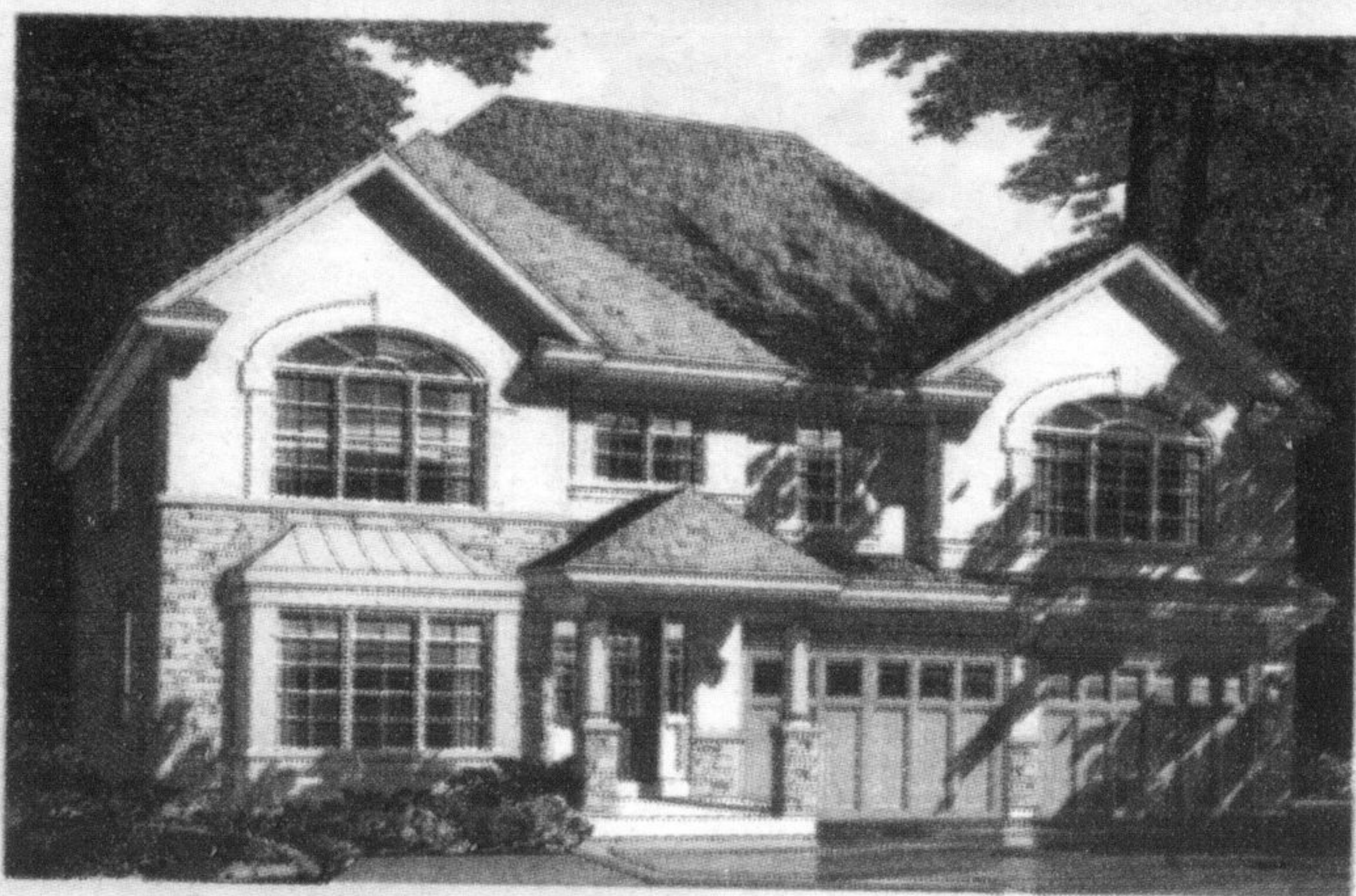
46' WideLot™, The Glenwood 'D', 2,504 Sq.Ft., $391,990