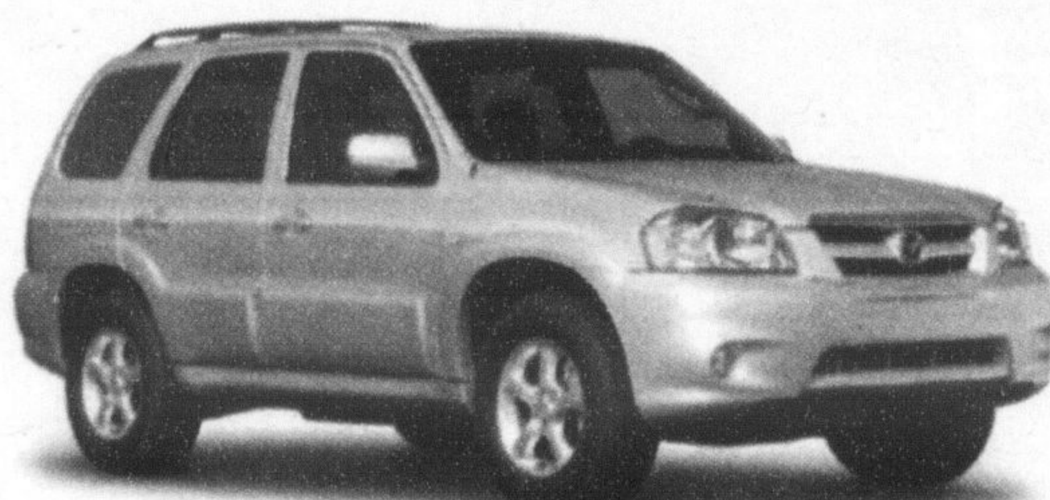
GS-V6 model shown

NO SECURITY DEPOSIT LEASE PAYMENT INCLUDES FREIGHT AND P.D.E.