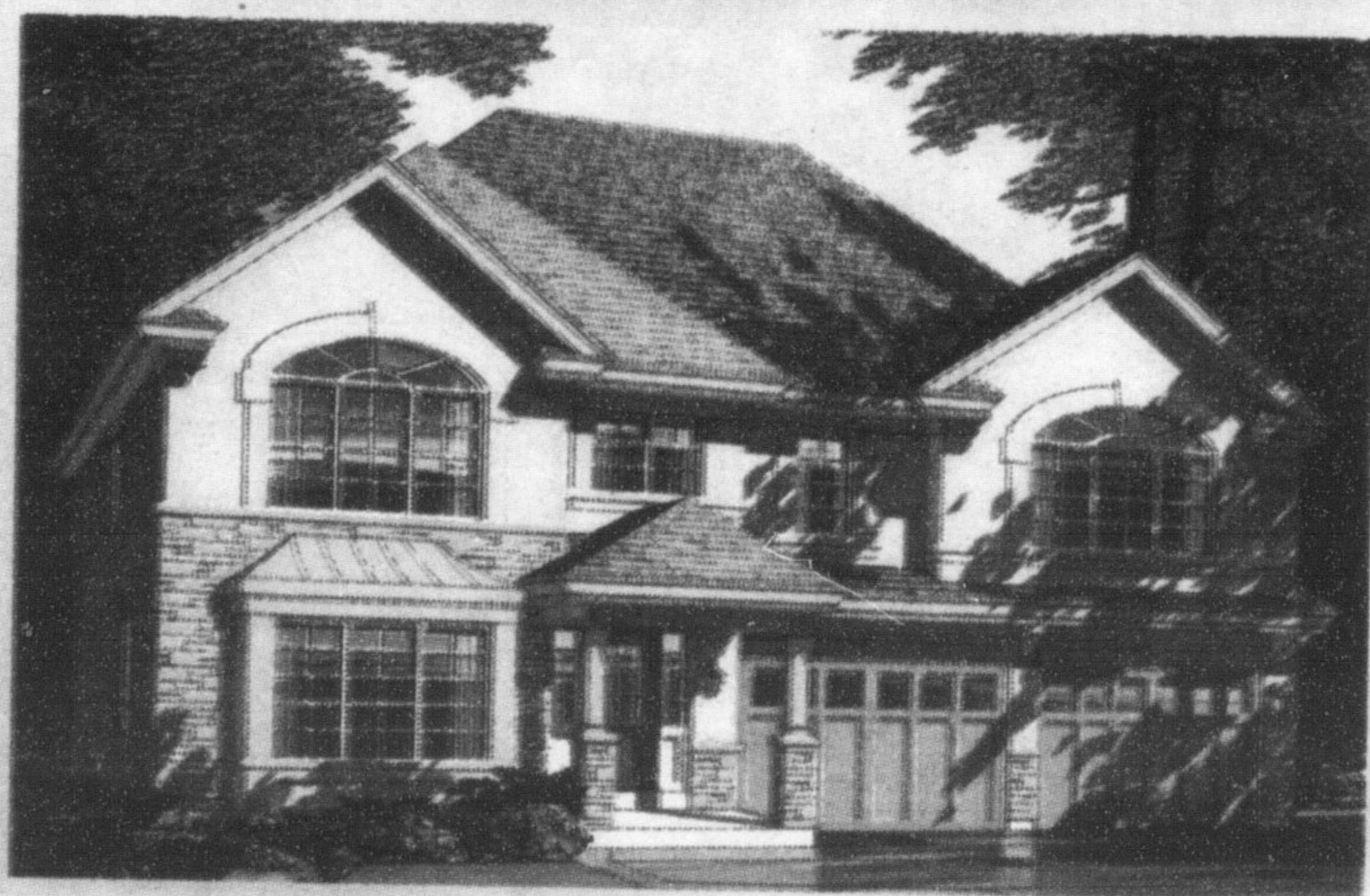
46' WideLot™, The Glenwood 'D', 2,504 Sq.Ft., $391,990