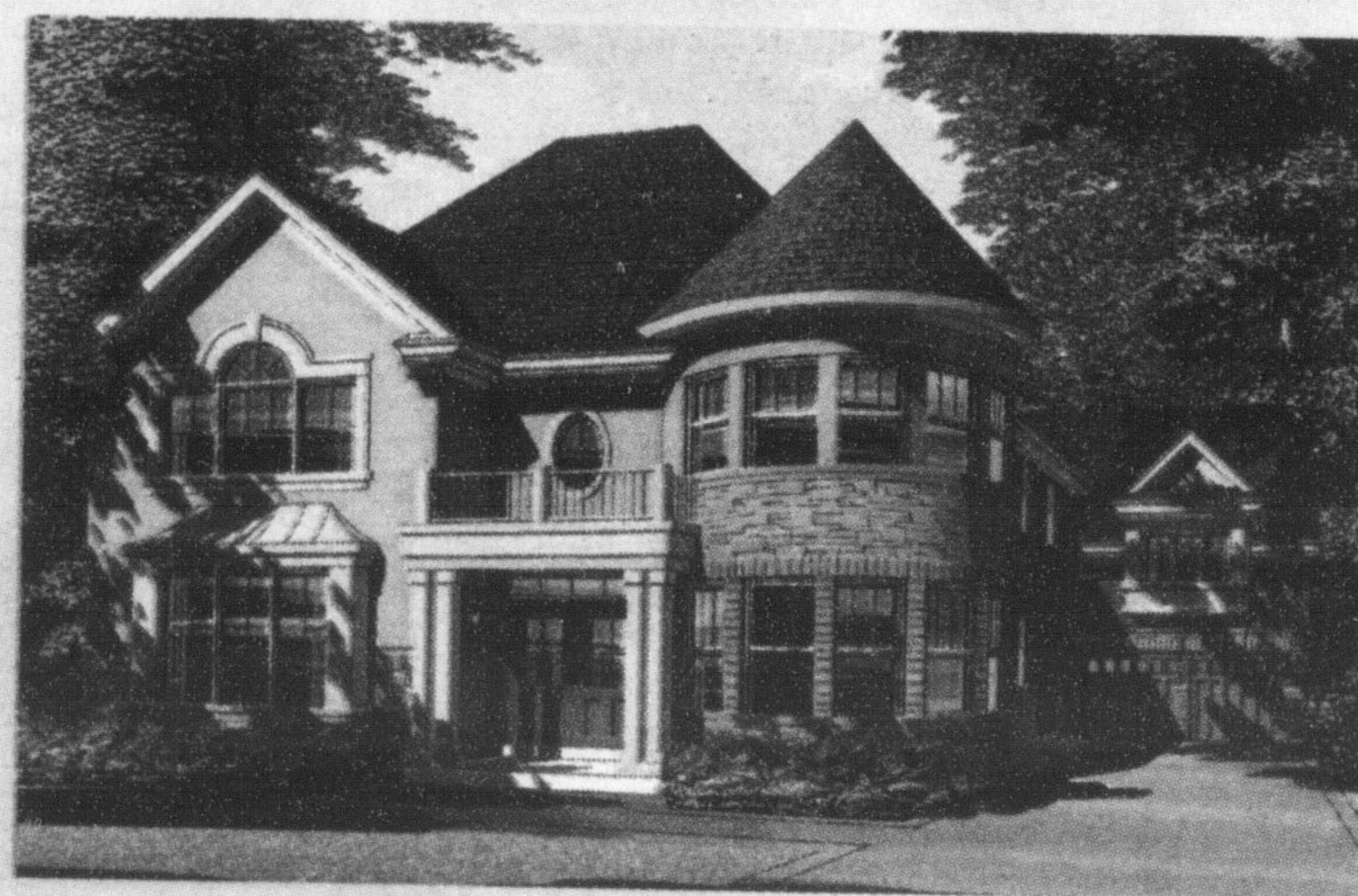
56' WideLot™, The Hazelwood 'C', 3,296 Sq.Ft., $493,990

The ENERGY STAR mark is administered and promoted in Canada by Natural Resources Canada.