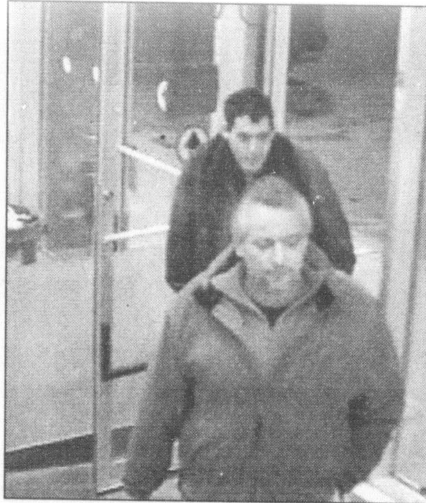
Police have released this image of suspects wanted in connection with a series of quick-change incidents.

If you have any information that leads to an arrest in this or any other matter, you may be eligible for a cash reward. You will never have to give your name or testify in court. Crime Stoppers of Halton does not subscribe to call display. Please call 1-800-222-TIPS (1-800-222-8477) or check out Crime Stoppers' Web site at www.haltoncrimestoppers.com .