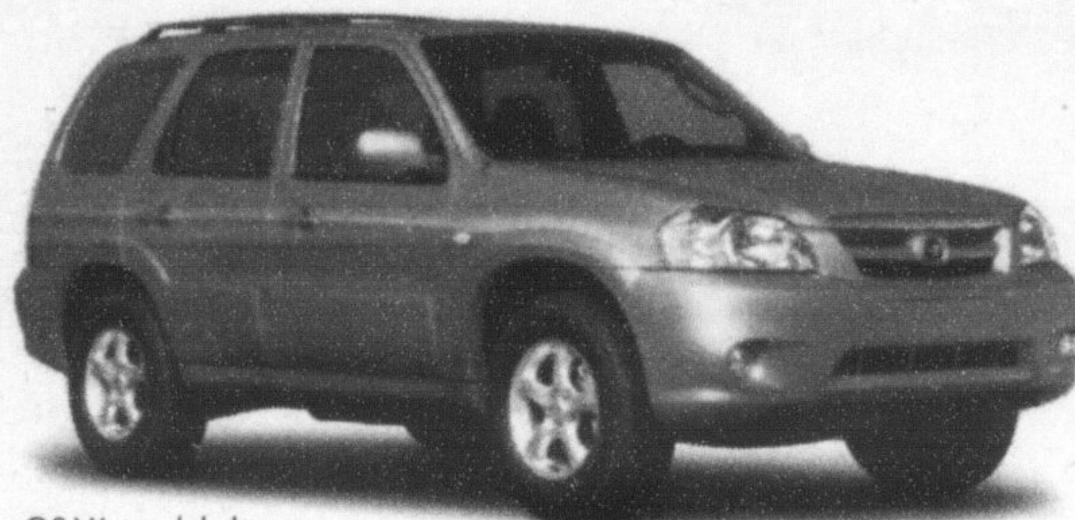
GS-V6 model shown