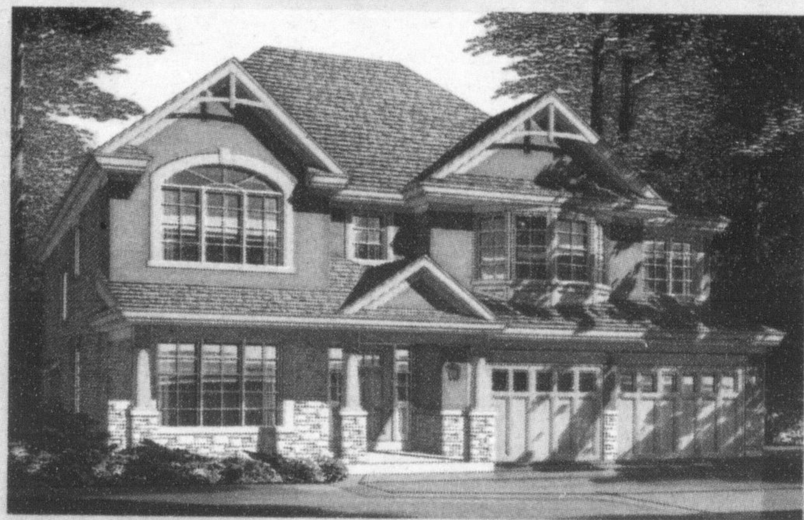
46' WideLot™, The Huxley 'C', 2,437 Sq.Ft., $398,990