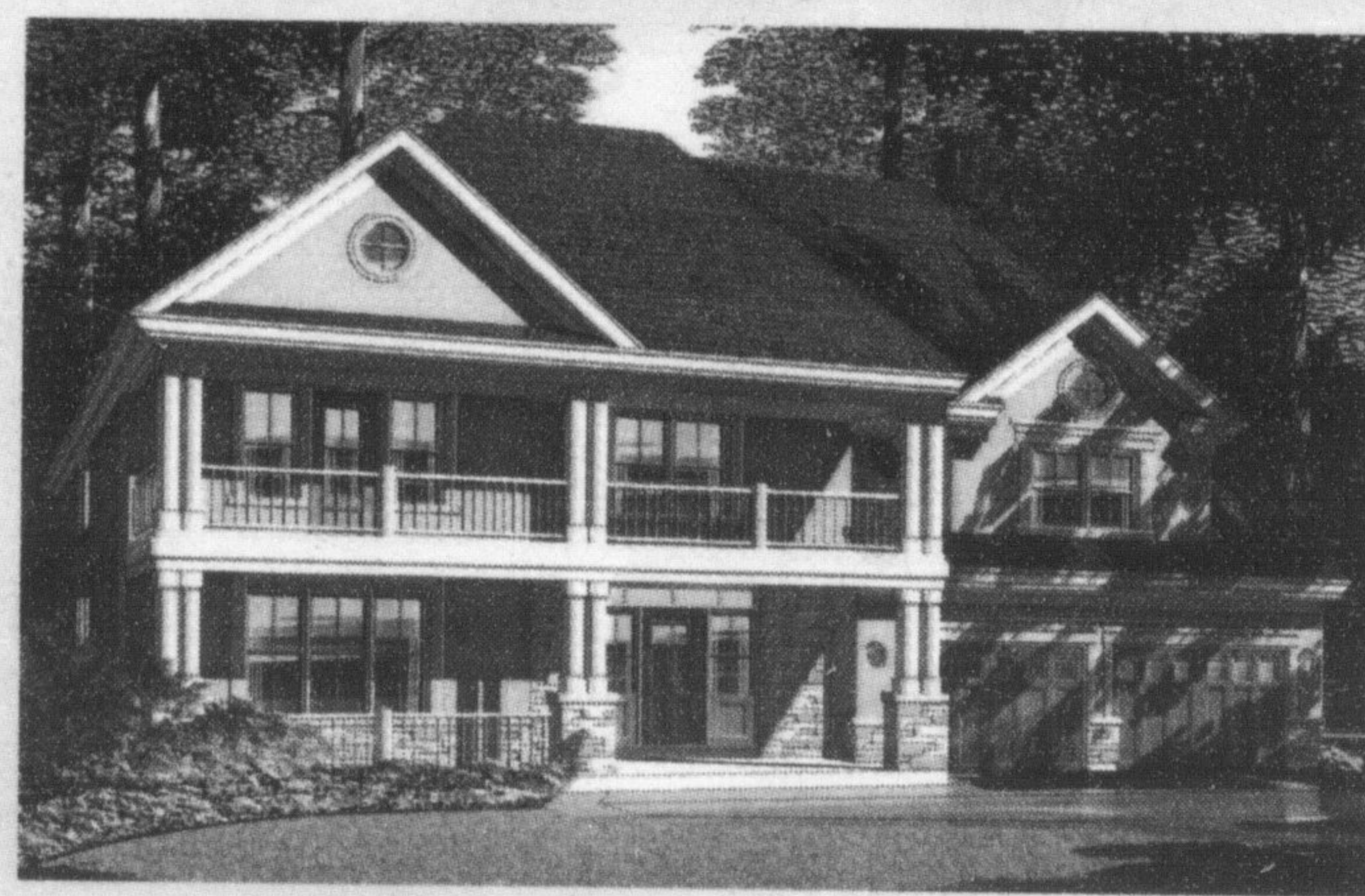
56' WideLot™, The Tothburg III 'C', 3,300 Sq.Ft., $495,990

The ENERGY STAR mark is administered and promoted in Canada by Natural Resources Canada.