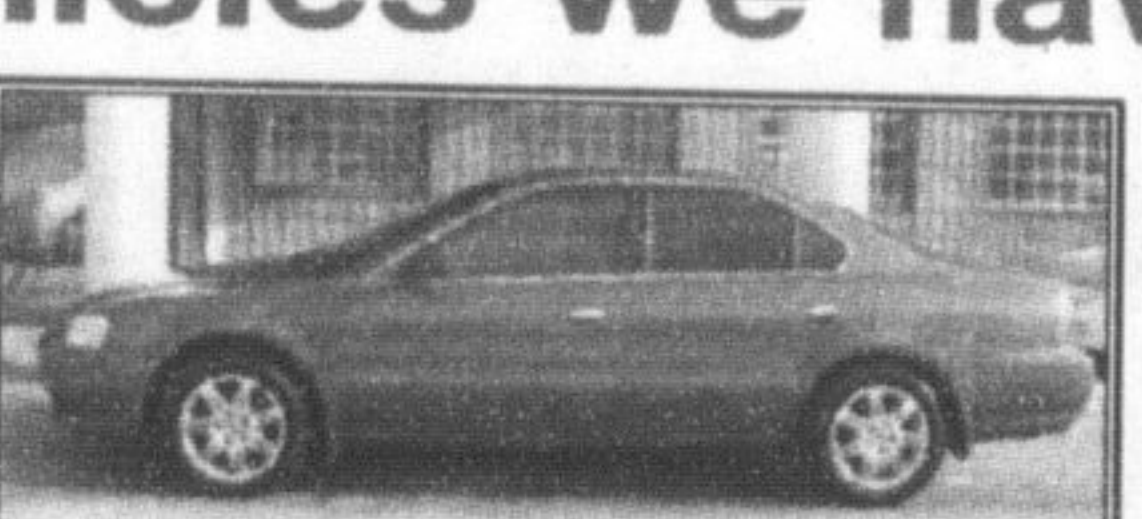
2000 ACURA TL 3.2 Exec. driven, fully loaded, heated leather, power seats, p/sunroof, heated mirrors, CD player, alloy wheels, 4WD. SUPERB CONDITION $10,995