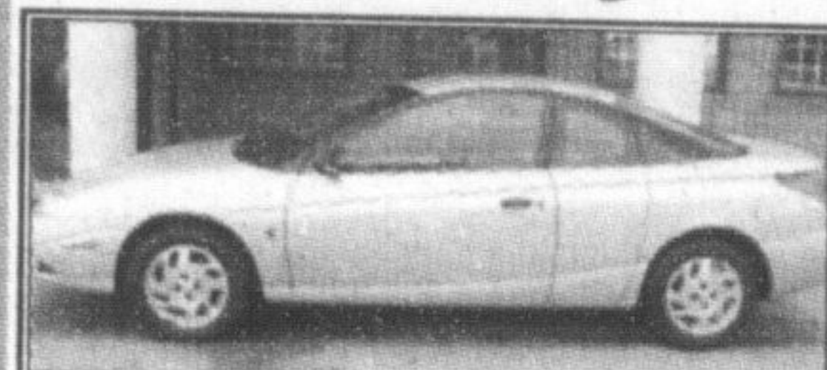
2002 HYUNDAI ELANTRA VE Air cond., CD, P/L, P/W, heated power mirrors, cruise, tilt steering, bucket seats. WHERE ELSE BUT AT GORRUDS FOR $7,995

Here's just a sample of over 250 vehicles we have in stock.