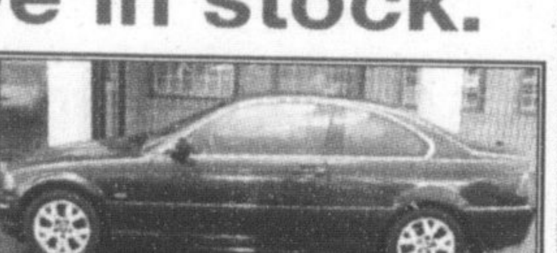
2000 BMW 323 CI Very well equipped incl. heated leather interior, heated mirrors, alloy wheels & much more. WHERE ELSE BUT AT GORRUDS FOR $19,995