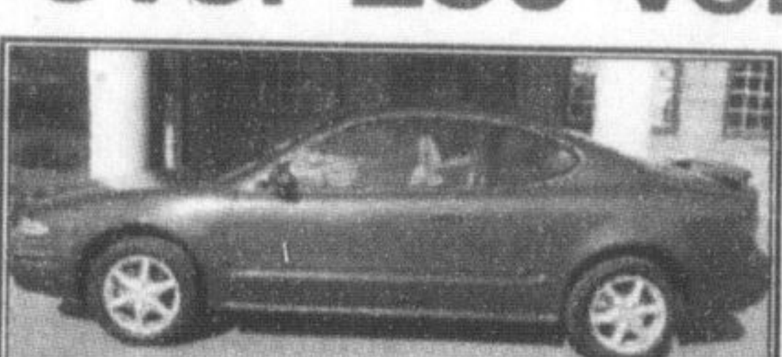
2002 OLDSMOBILE ALERO GL Super low mi., incl. power moonroof & rear spoiler, V6 engine, p/seat, alum. rims, balance of factory warranty. A GREAT DEAL AT $9,995