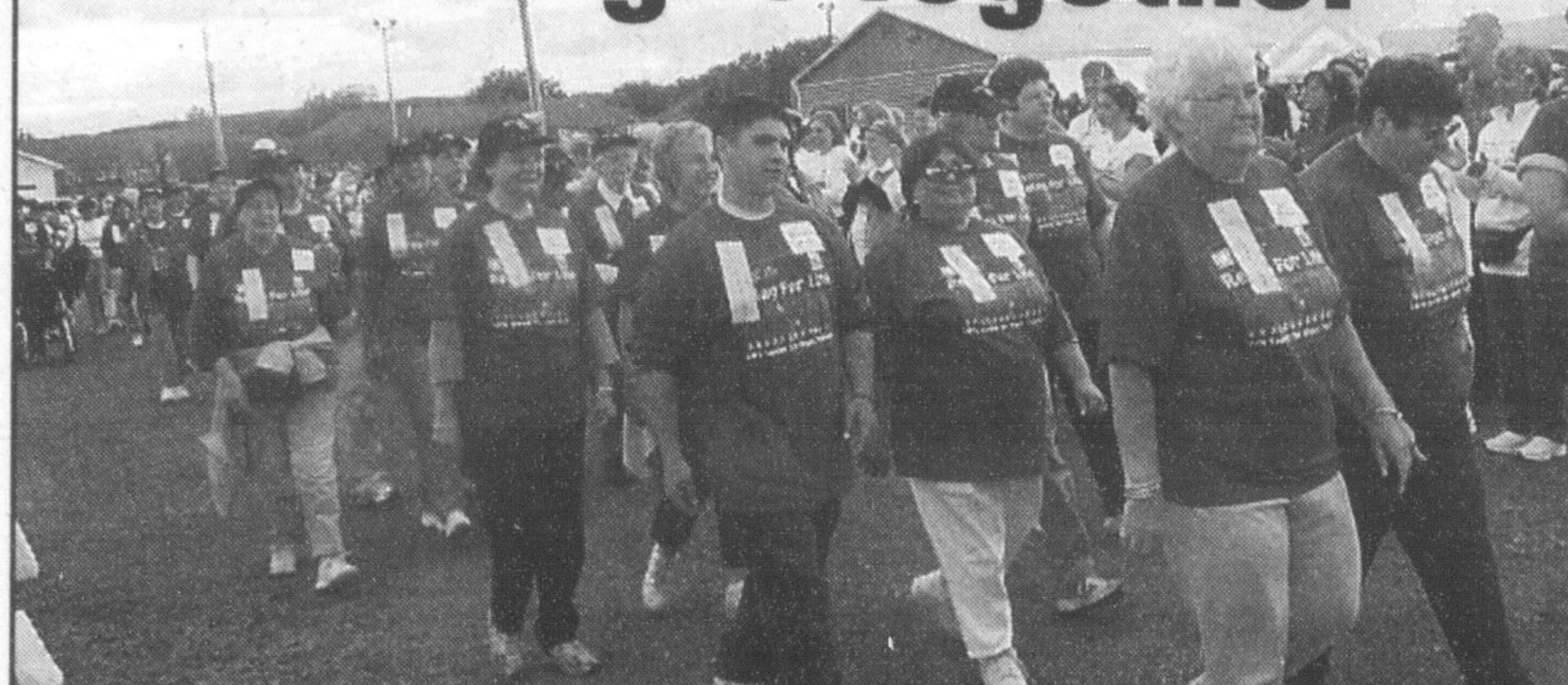
"SURVIVOR'S LAP" at Milton's Relay for Life 2005.