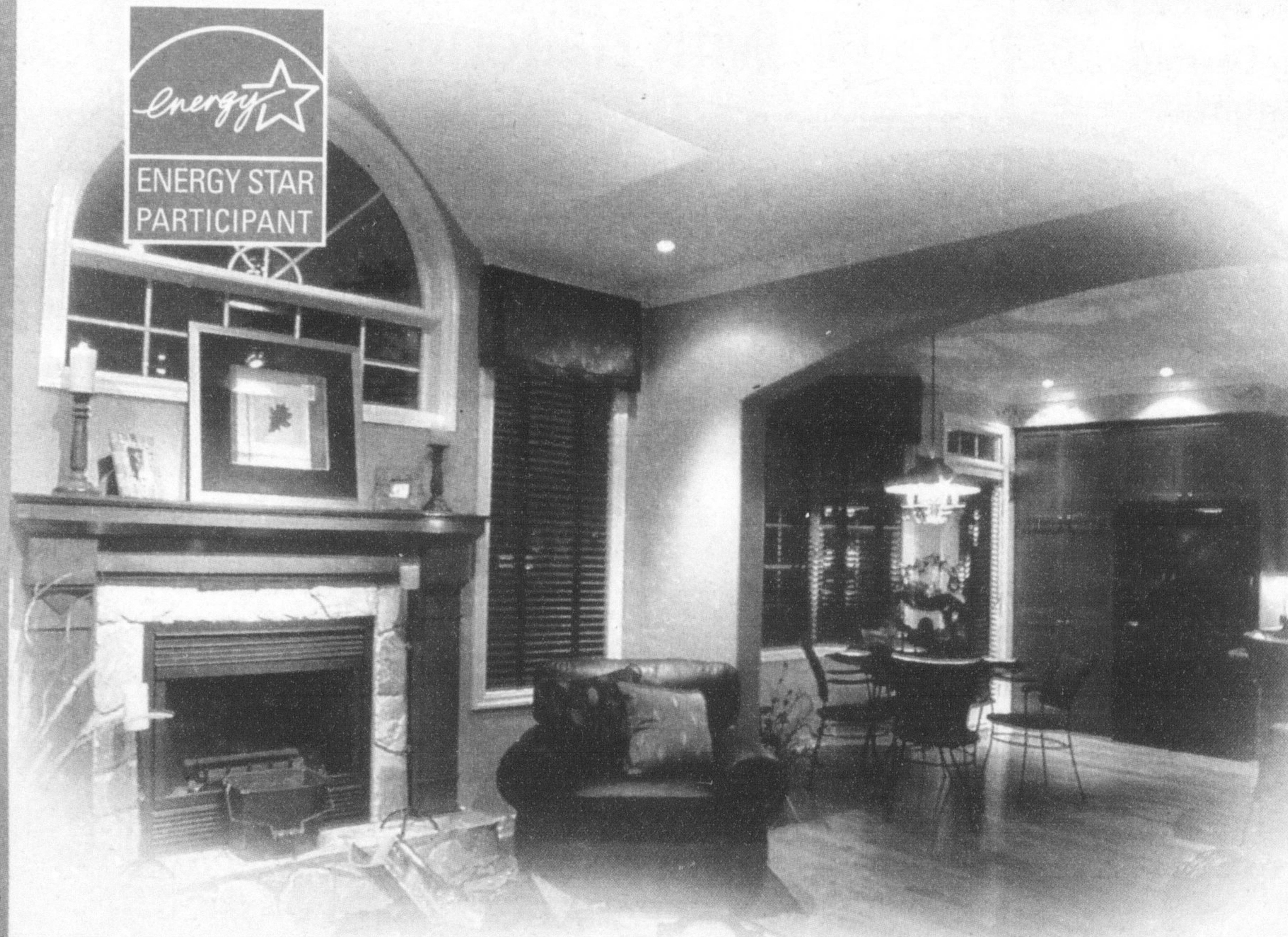
The Pottington, 36' WideLot™ Model Home in Hawthorne Village

ENERGY STAR is a bright new idea and another innovation in our largest WideLot™ community.