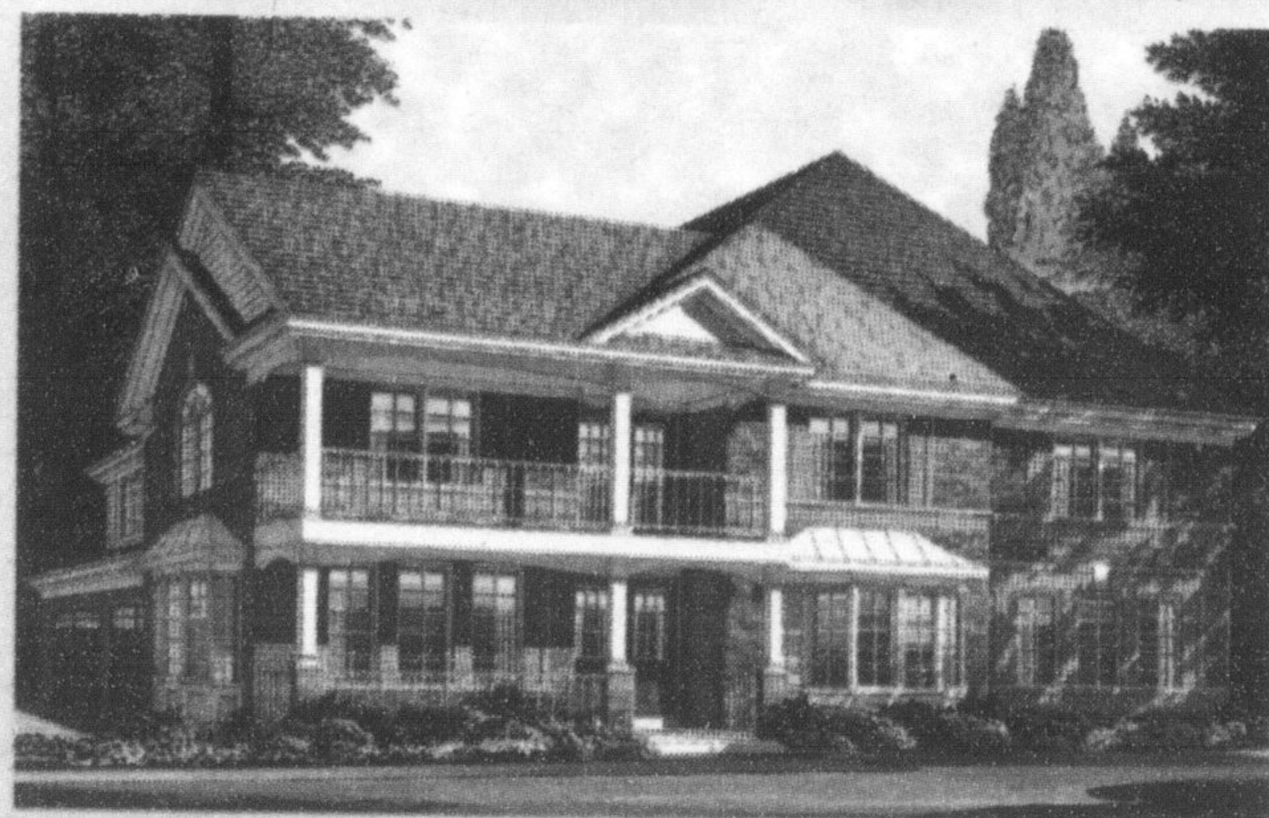
46' WideLot™, The Mannington Corner 'A', 2,690 Sq.Ft., $399,990