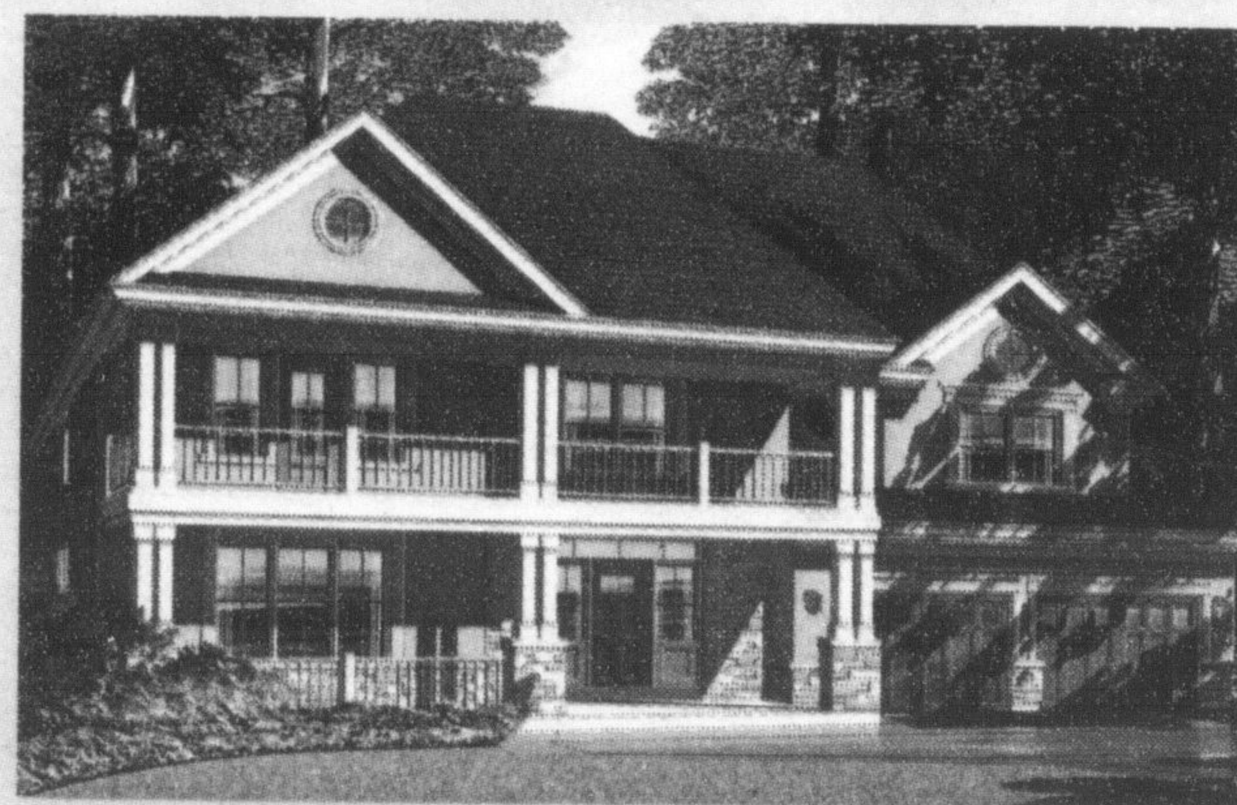
56' WideLot™, The Tothburg III 'C', 3,300 Sq.Ft., $495,990