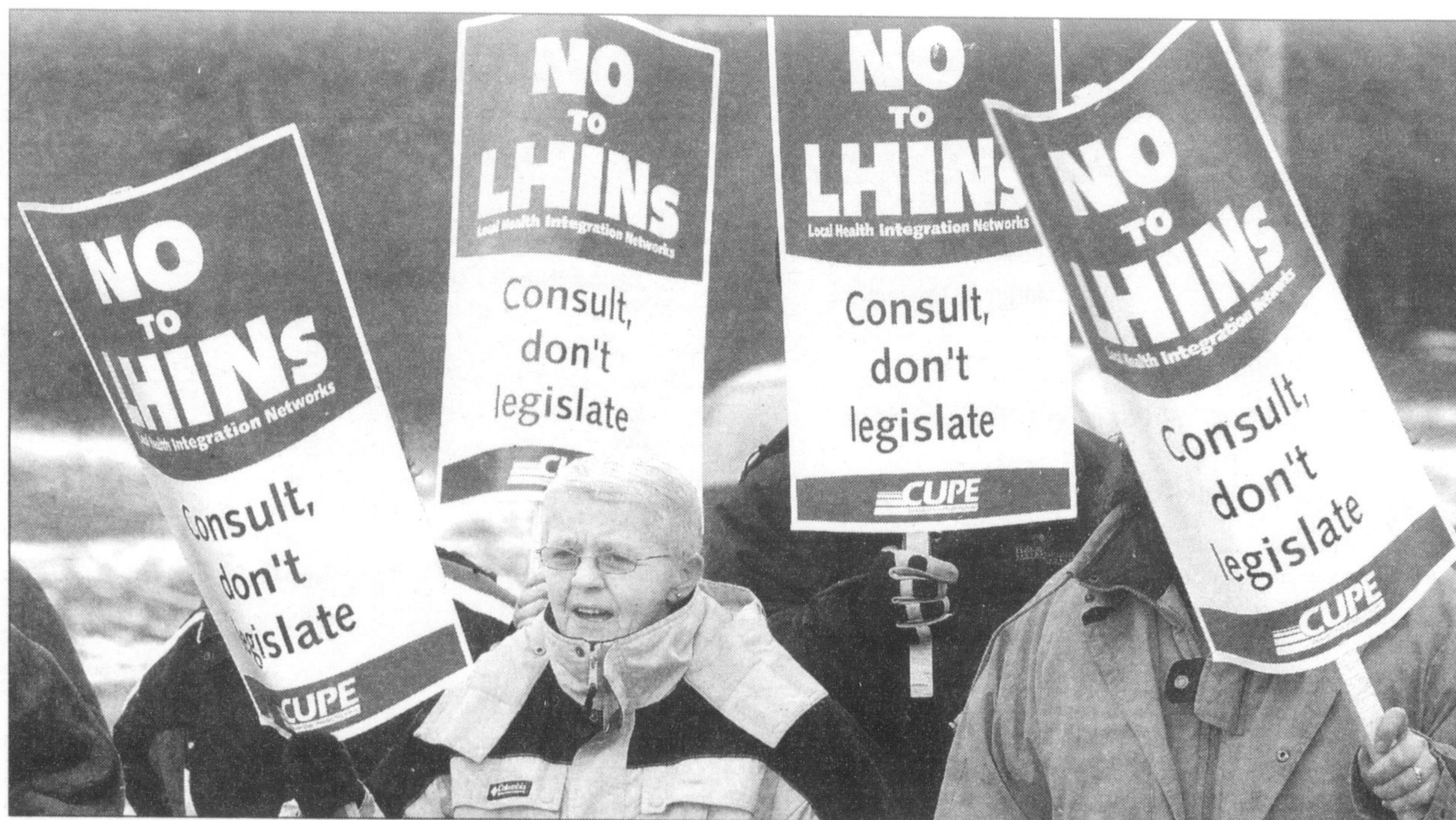
STRONG OPPOSITION: CUPE Local 815 members stage a noon-hour information picket line Tuesday out front of the hospital in opposition to the proposed LHINS.