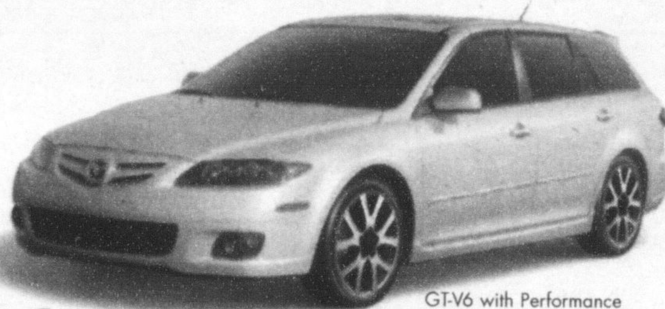
GT-V6 with Performance package model shown

NO SECURITY DEPOSIT LEASE PAYMENT INCLUDES FREIGHT AND P.D.E.