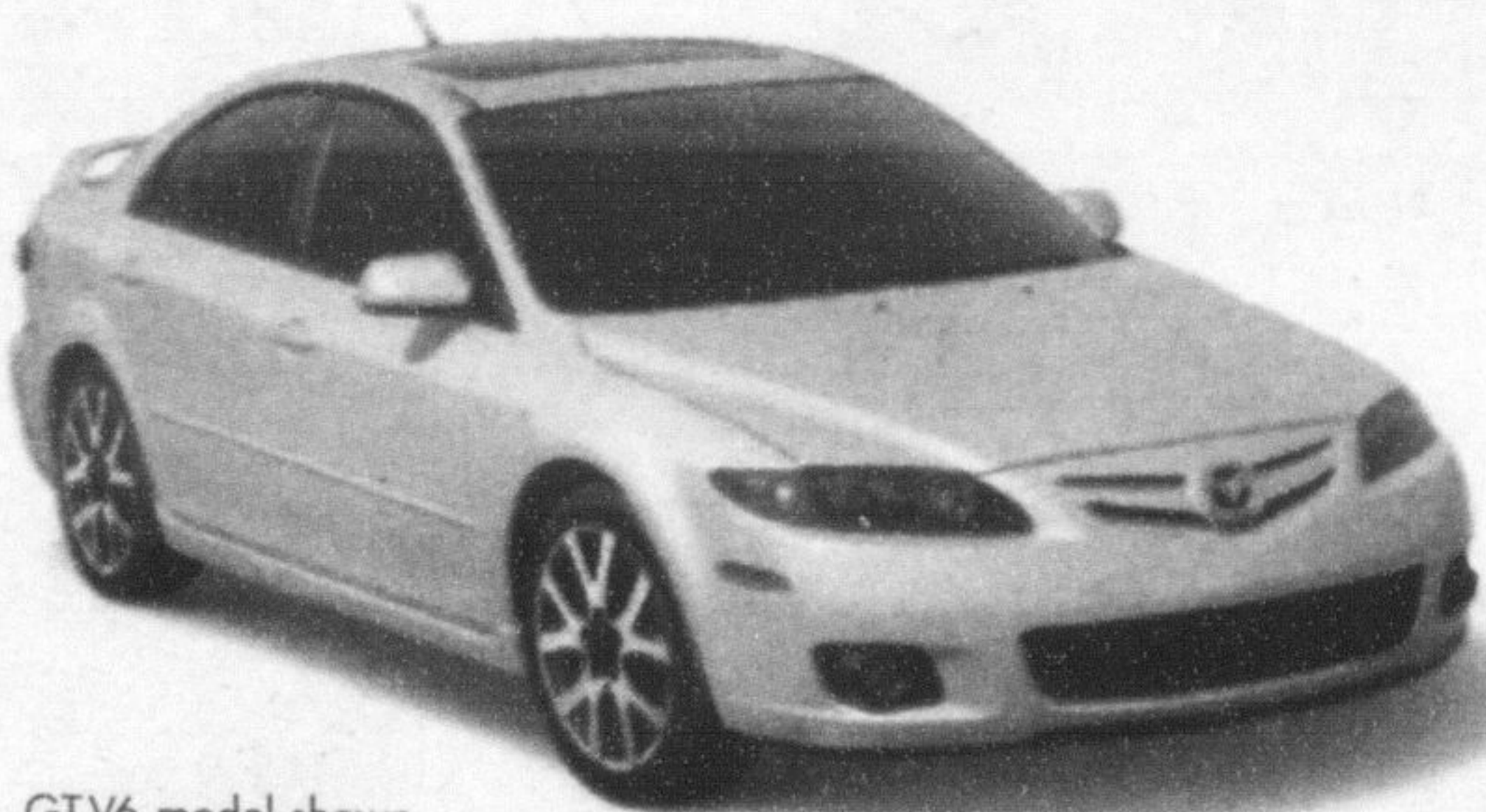
GT-V6 model shown

Test-drive any new Mazda6 now through February 28. You'll then get a free $200 Gas Card when you buy...even if you buy a Camry, Accord, or Altima. See your dealer for details.