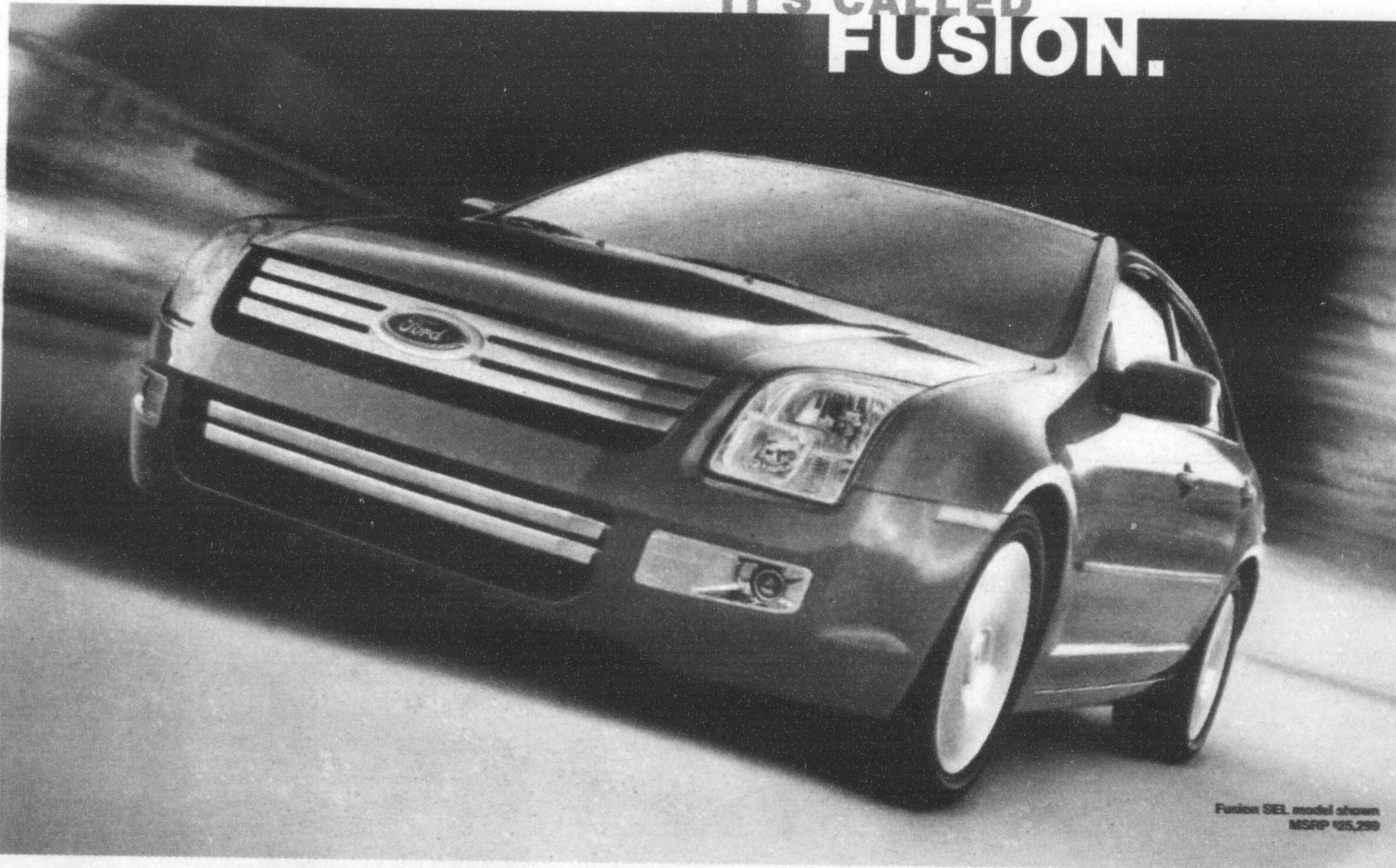
Fusion SEL model shown MSRP $25,299

WE HAVE AN UNFAIR ADVANTAGE OVER CAMRY AND ACCORD. IT'S CALLED FUSION.