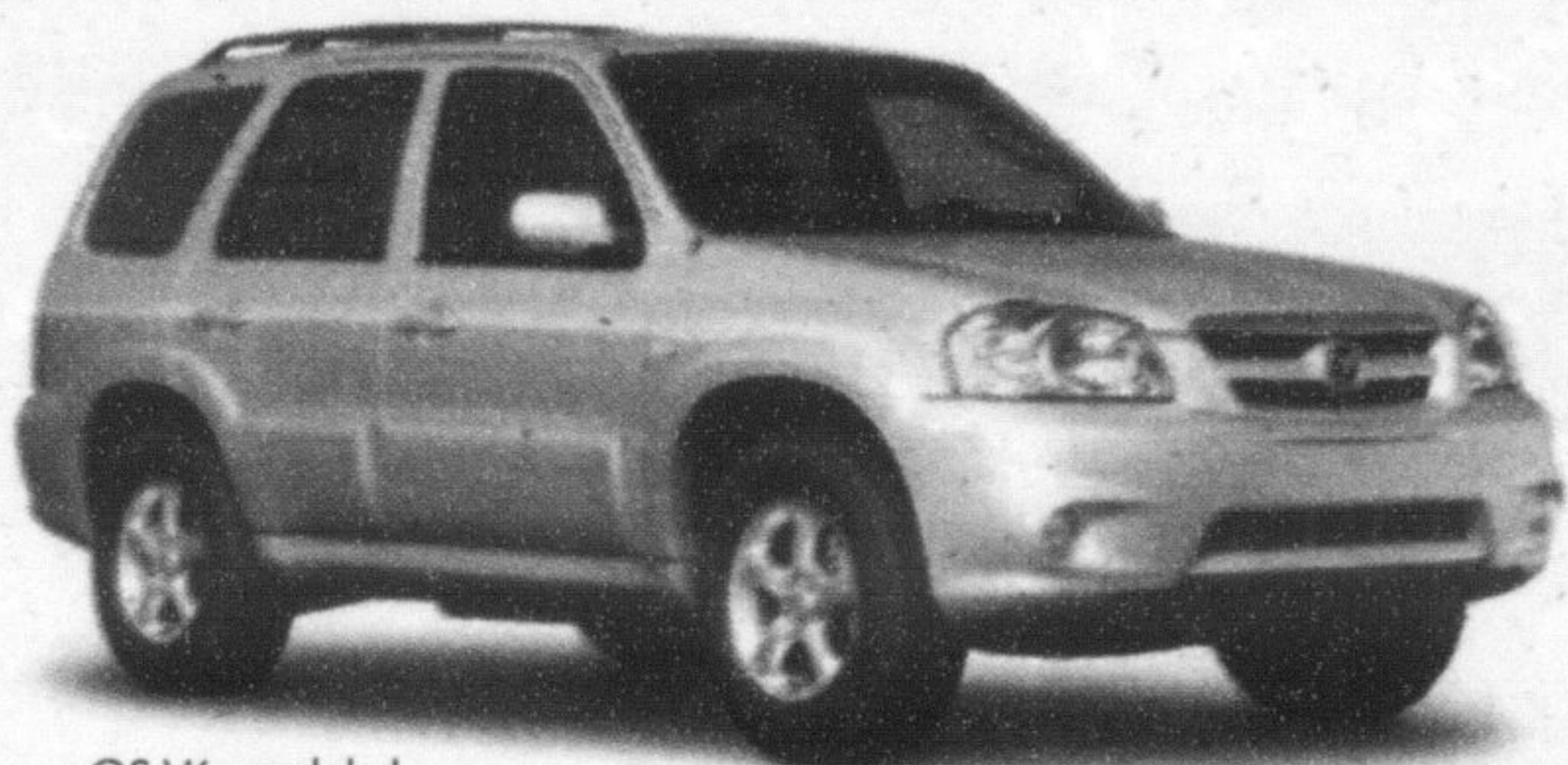
GS-V6 model shown