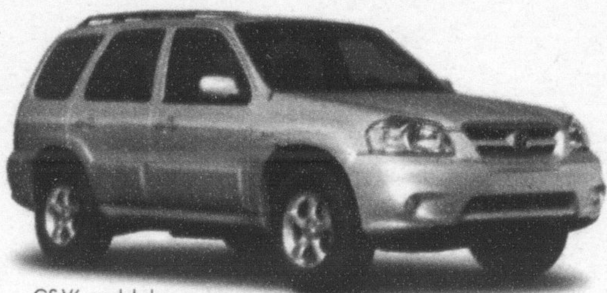
GS-V6 model shown