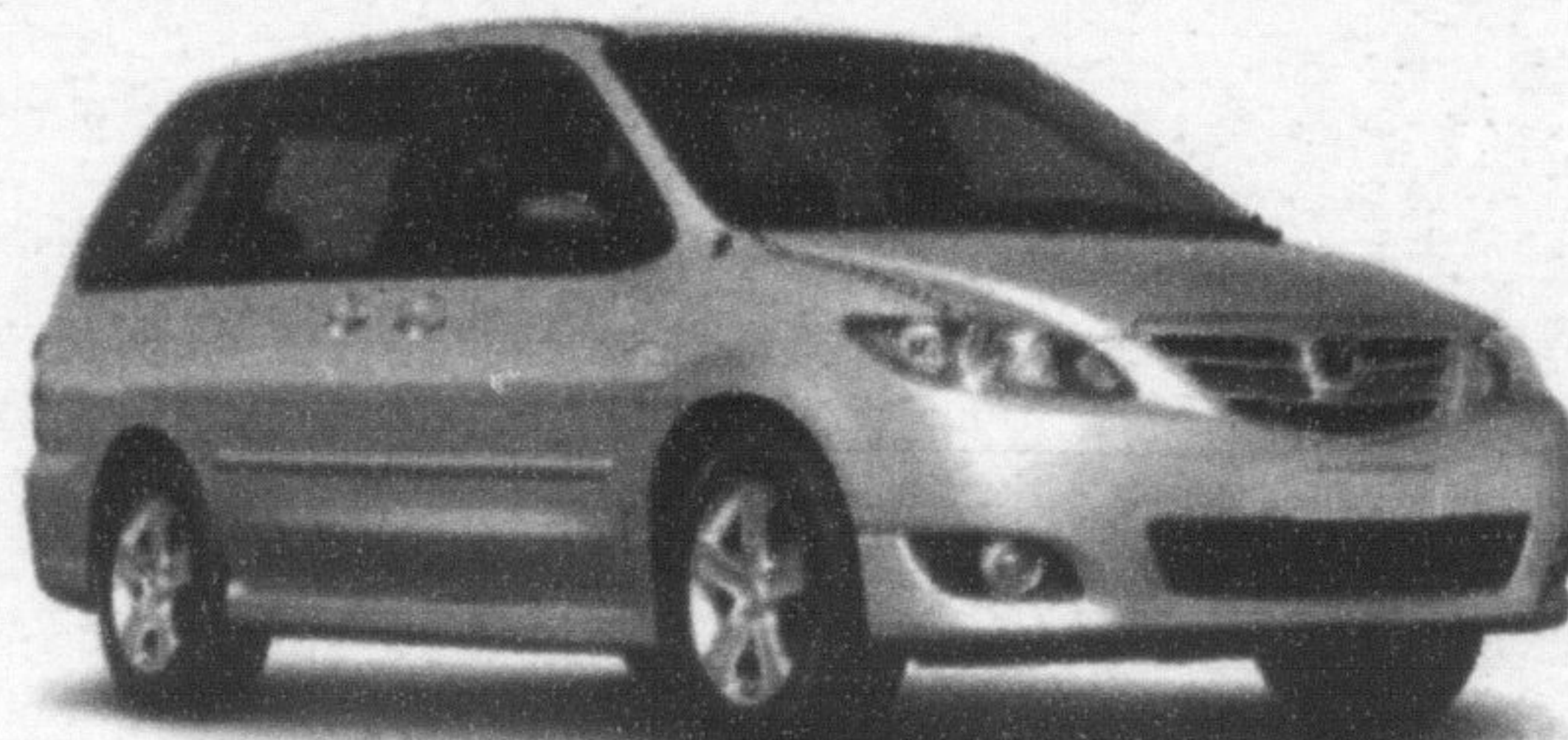
GT model shown

LEASE FROM $198* -AT- 0.9% APR -OR- 0% PER MONTH/24 MONTHS WITH $5,495 DOWN PAYMENT PURCHASE FINANCING FOR 60 MONTHS† NO SECURITY DEPOSIT LEASE PAYMENT INCLUDES FREIGHT AND P.D.E.