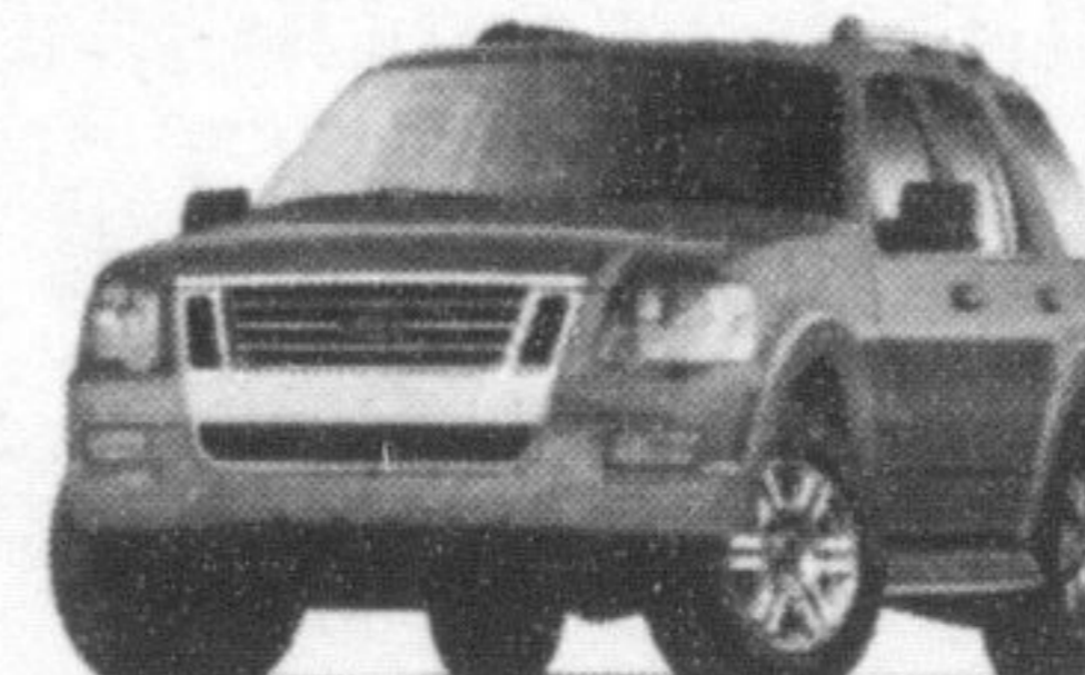
2006 EXPLORER 4X4 - EDDIE BAUER