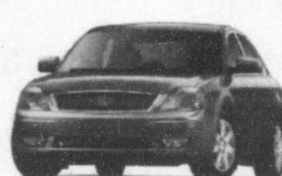
2006 FIVE HUNDRED SEL AWD