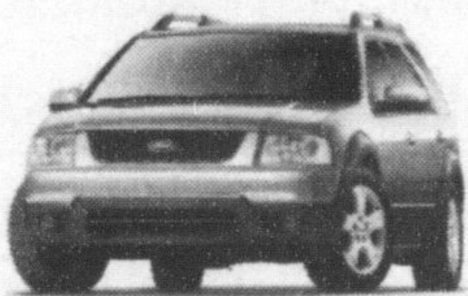
2006 FREESTYLE SEL AWD

ADD ALL-WHEEL DRIVE TO EXTREME-COLD TESTING, AND YOU'VE GOT THE ULTIMATE WINTER VEHICLES.