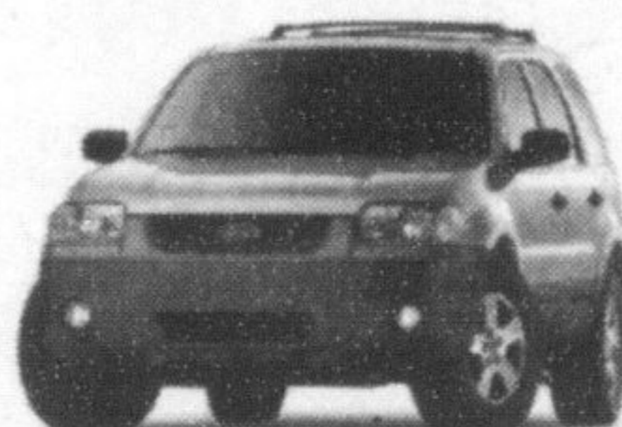
2006 ESCAPE XLT 4X4