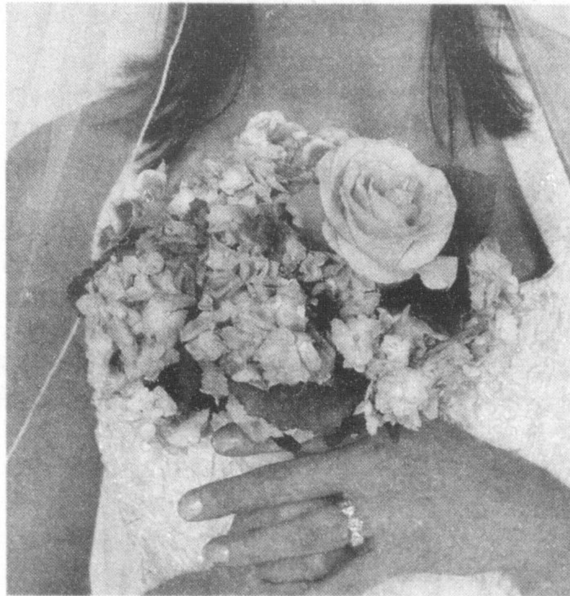
Just as you preserve a wedding gown, preserve a bridal bouquet.

The fresher and healthier the flowers, the prettier they will look preserved. Consider leaving your actual bouquet in a safe place during the reception. Have the caterer store it in the refrigerator or stick the stems of a hand-tied bouquet in water. Then, at the ceremony, toss another bouquet instead. These steps will ensure that the flowers will be in