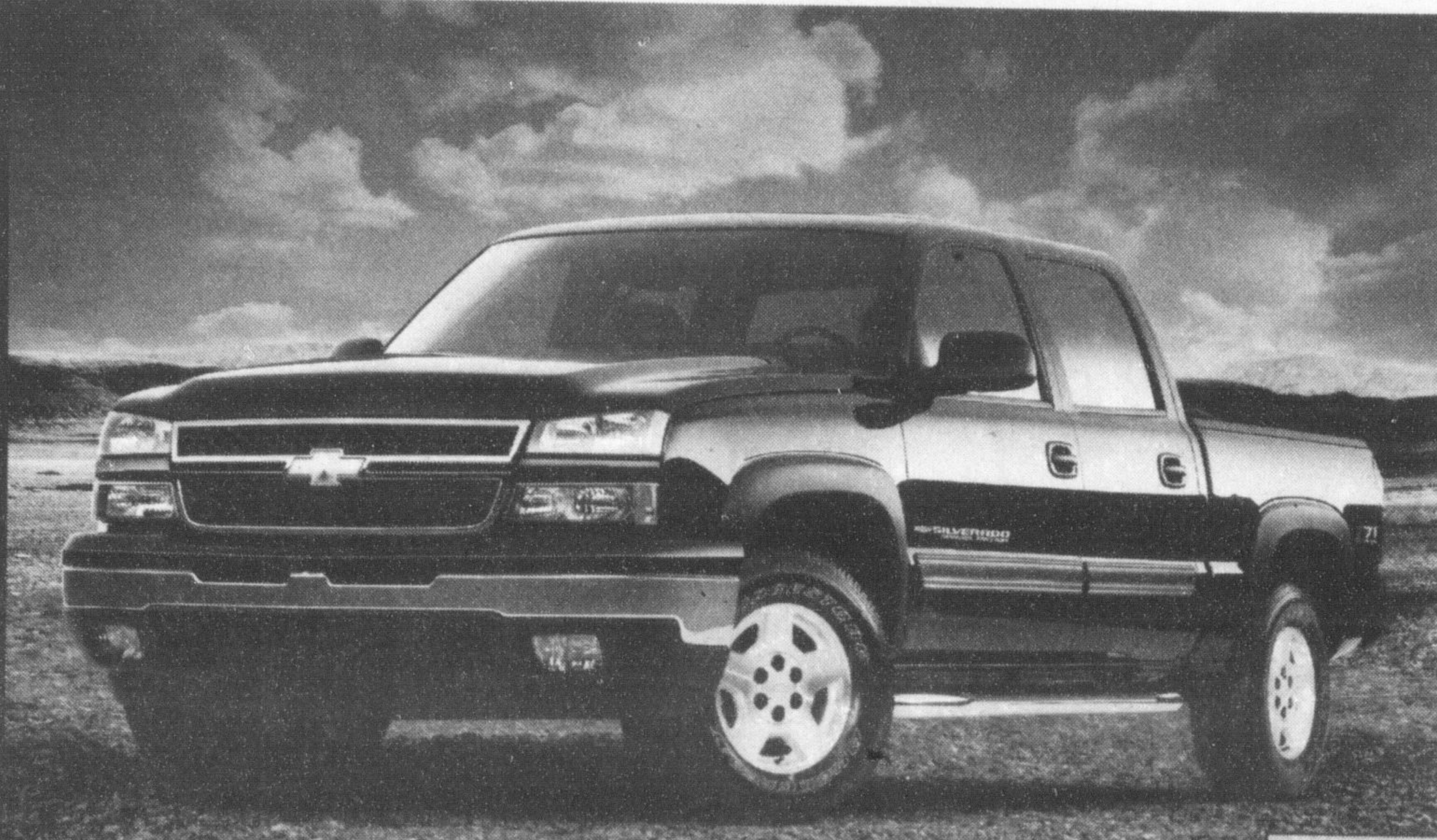
2006 SILVERADO CREW CAB 4x4 SPECIAL EDITION

SILVERADO — MOST DEPENDABLE, LONGEST LASTING FULL-SIZED PICKUPS ON THE ROAD†.