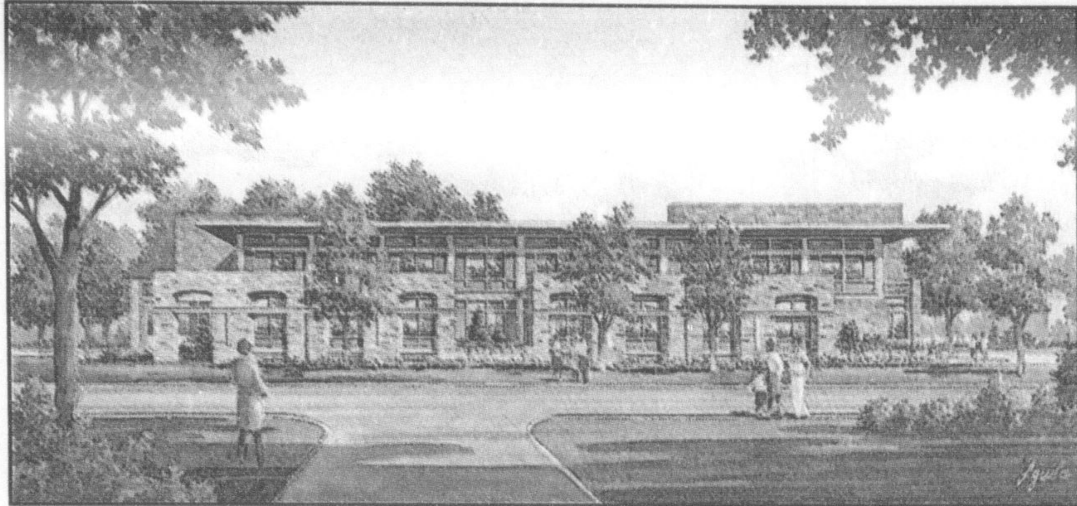
The view of the proposed new Town Hall expansion from Hugh Street.