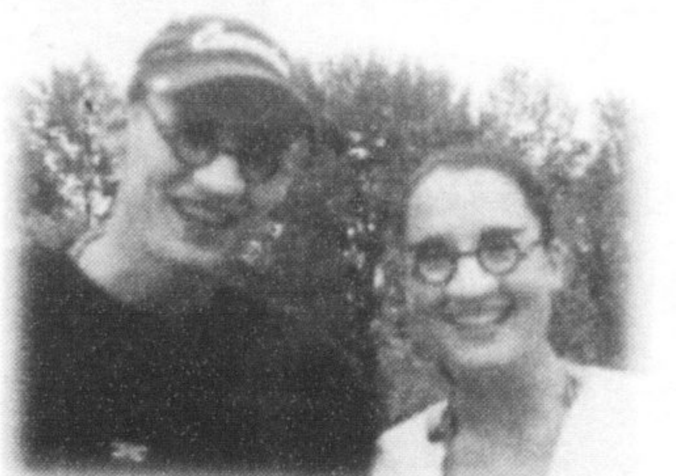
Much love, from your family