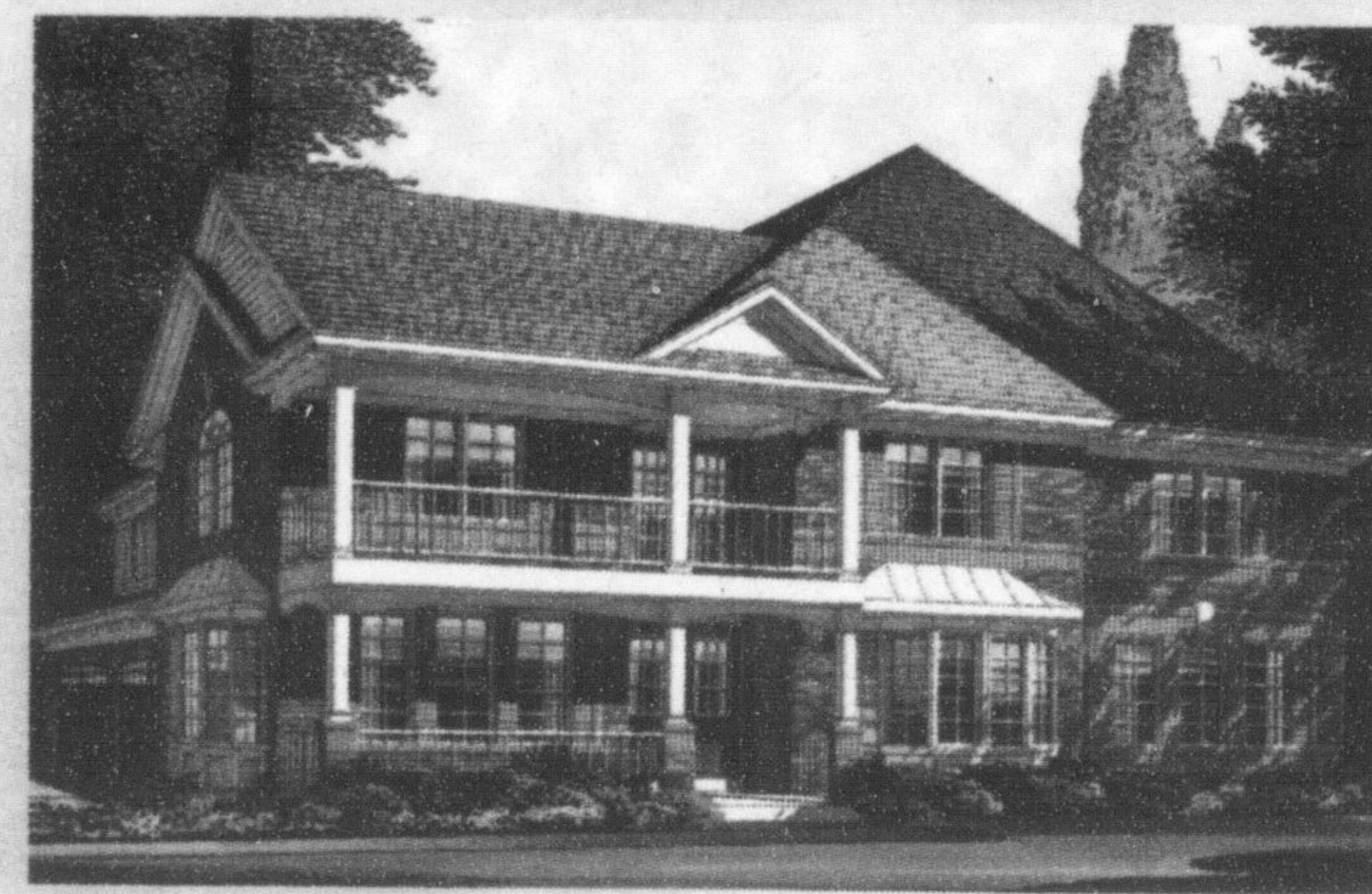
46' WideLot™, The Mannington Corner 'A', 2,690 Sq.Ft., $396,990