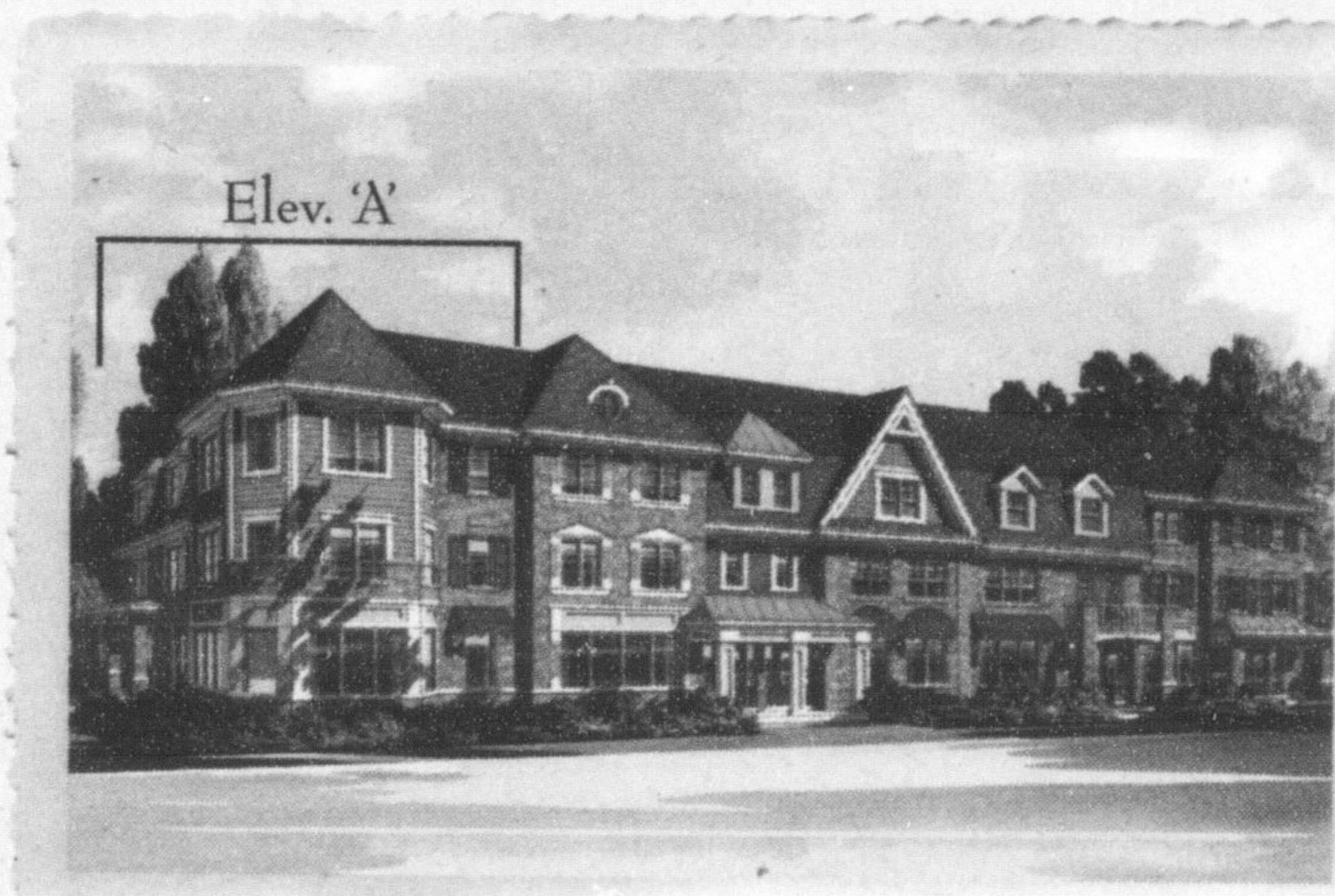
Main Street Townhome, The Castlegate Corner 'A', 1,790 Sq.Ft., $269,990