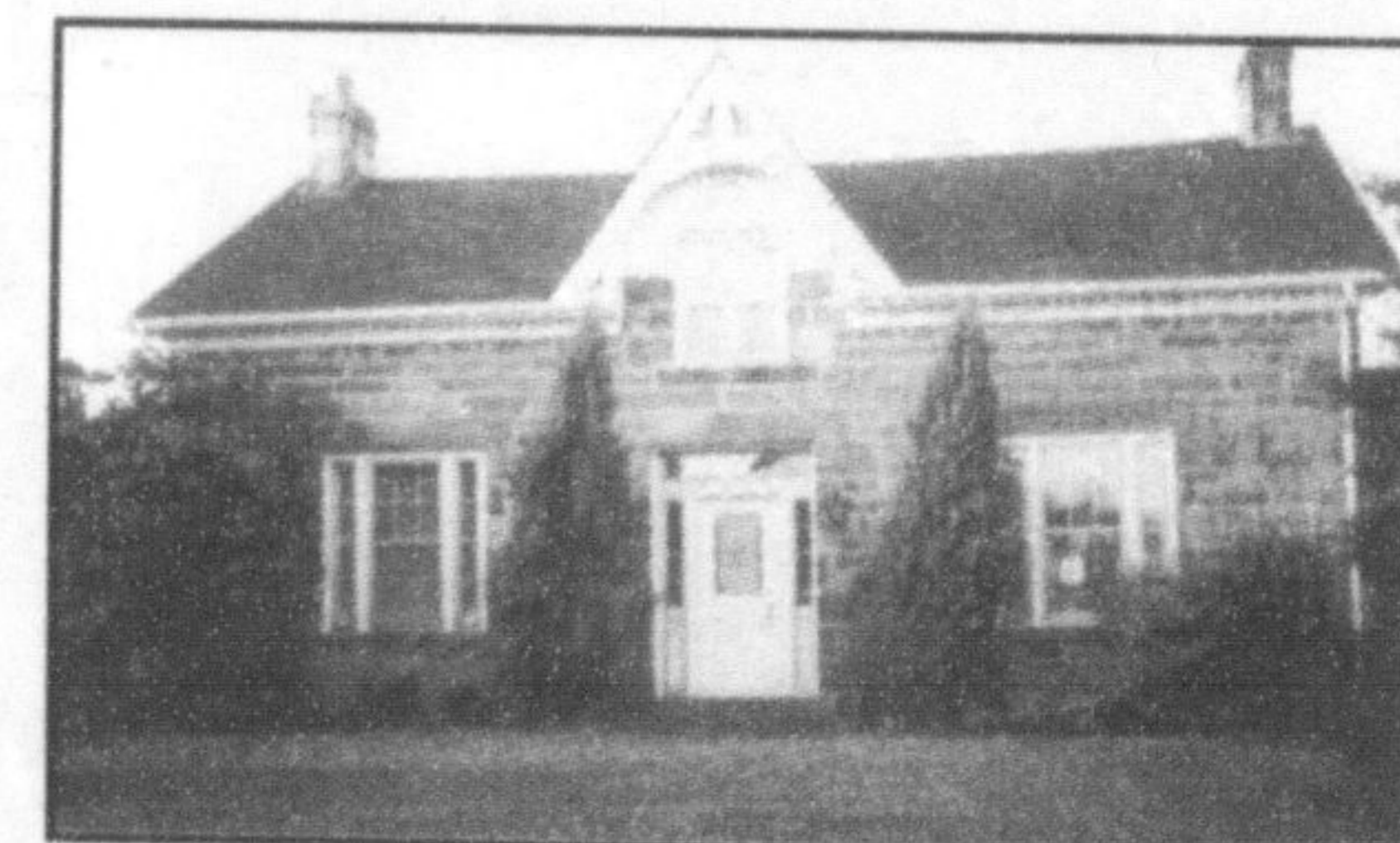
This 1847 Tremaine Road home was mistakenly torn down recently.

"Unfortunately, the demolition permit was signed off in error, as it was the committee's (Heritage Milton's) intention to sign off on the dilapidated dwelling located adjacent to the heritage dwelling which