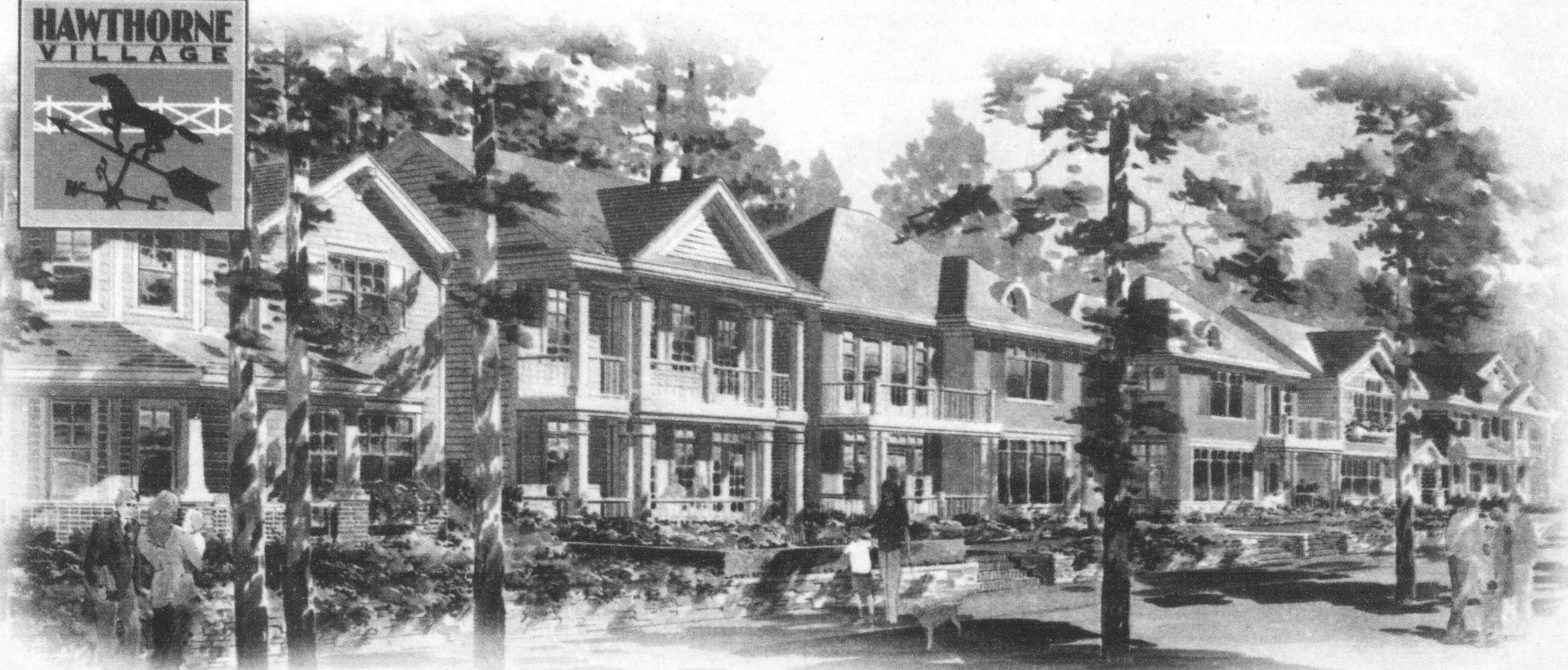
Courtyard Streetscape Fronting Onto Park