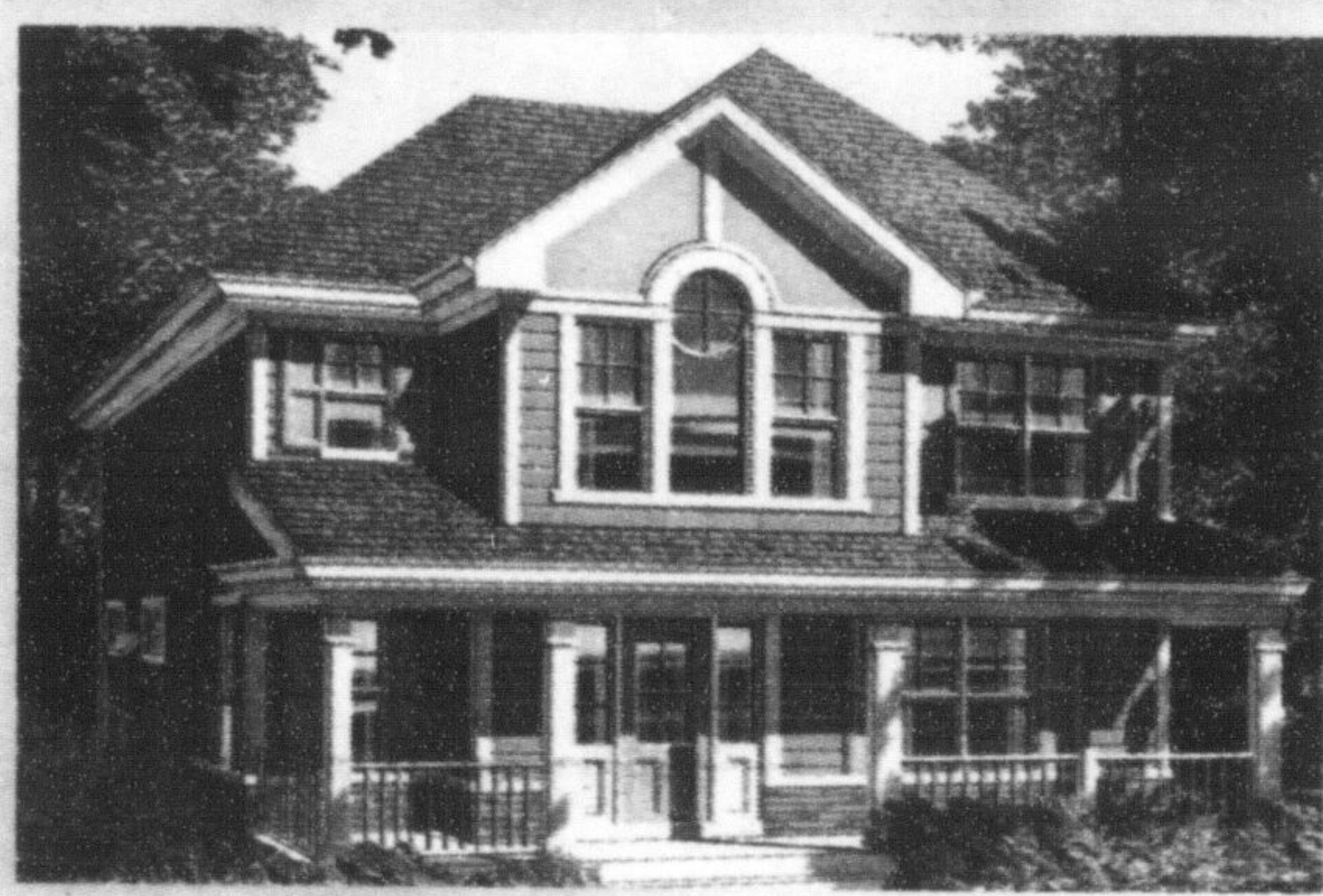
Fully Detached Courtyard Home, The Harrisgate 'A', 2,020 Sq.Ft., $380,990

Main Street Townhomes From $238,990 WideLot™ Semis From $257,990 46' WideLot™ From $359,990 Detached Courtyard Homes From $379,990