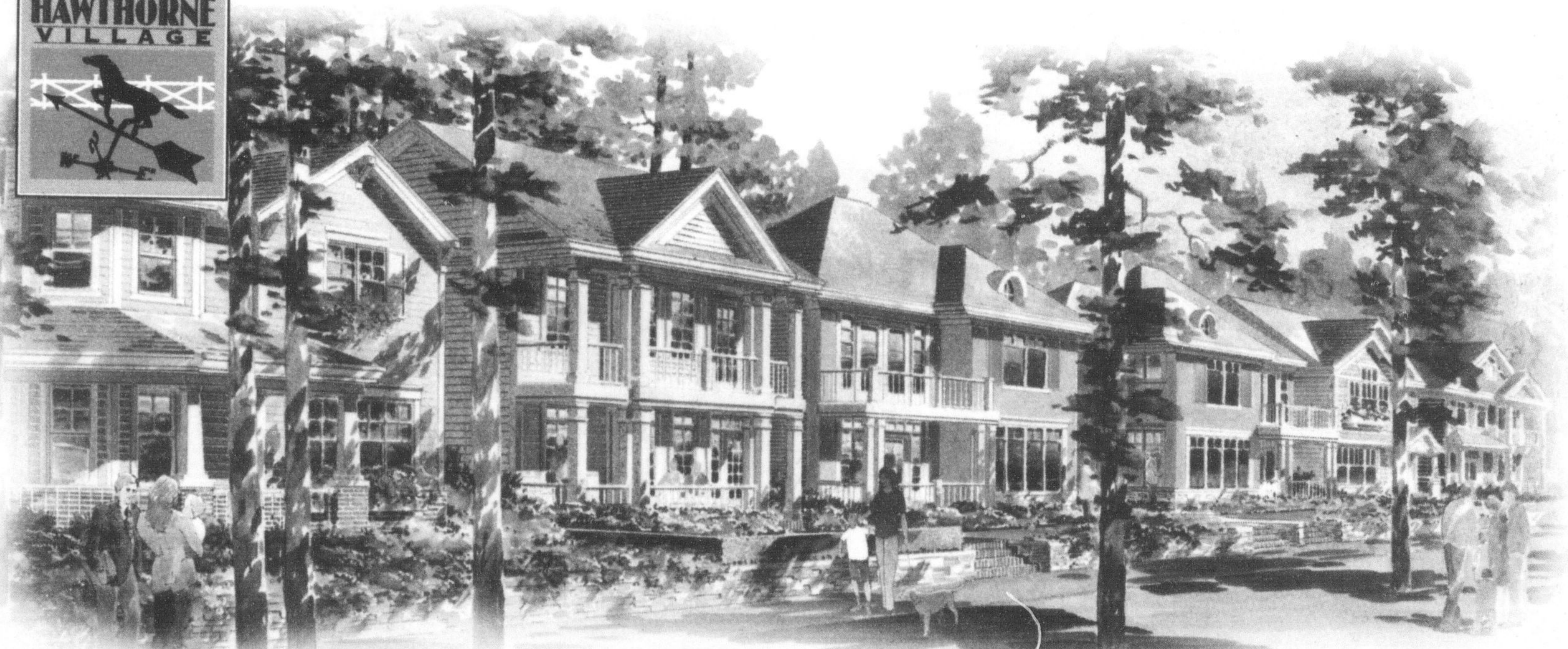
Courtyard Streetscape Fronting Ontario Park