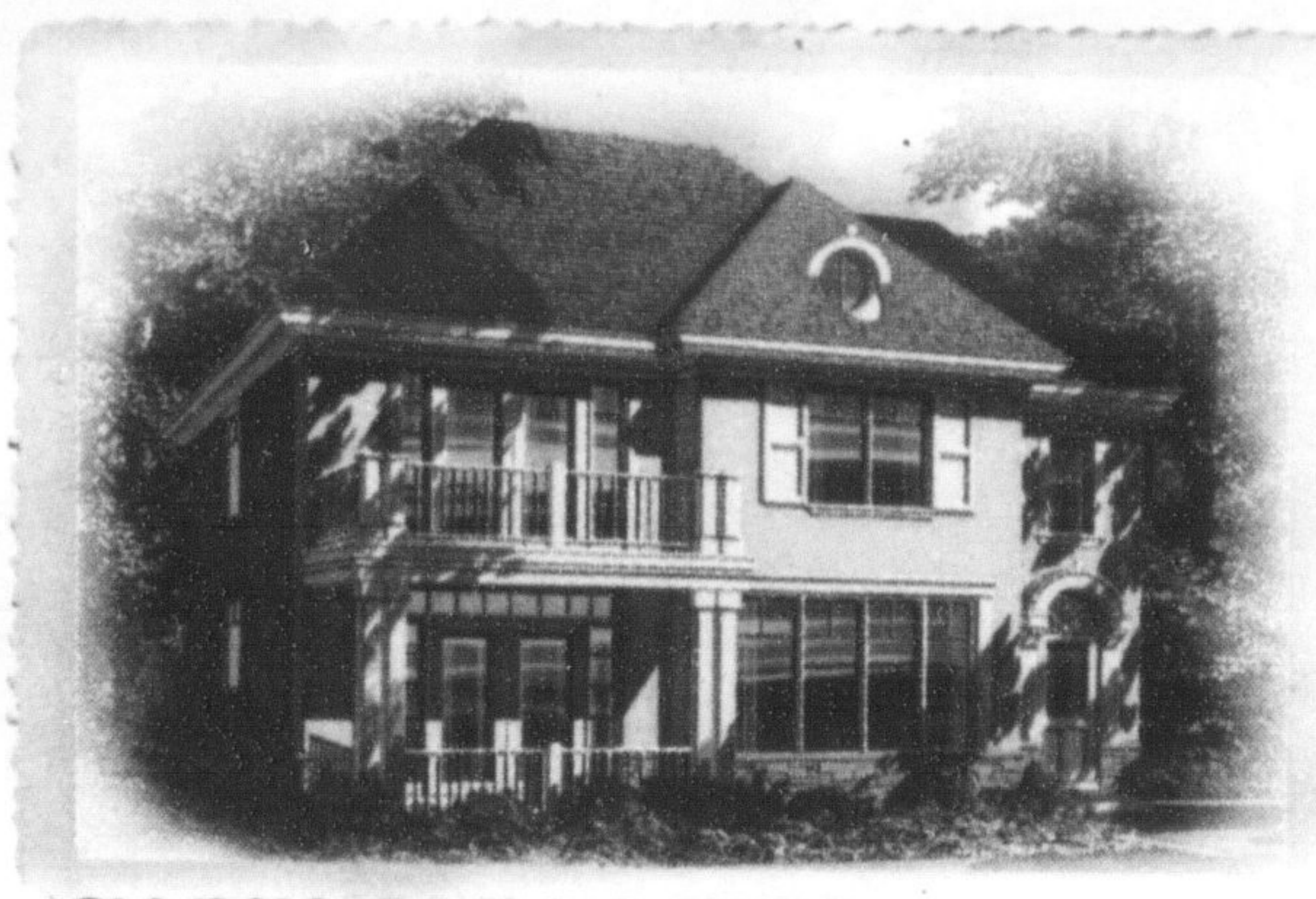
Detached Courtyard Home, The Berrybrook 'B', 2,045 Sq.Ft., $388,990

WideLot™ Semis From $257,990 36' WideLot™ From $281,990 46' WideLot™ From $359,990 Detached Courtyard Homes From $379,990