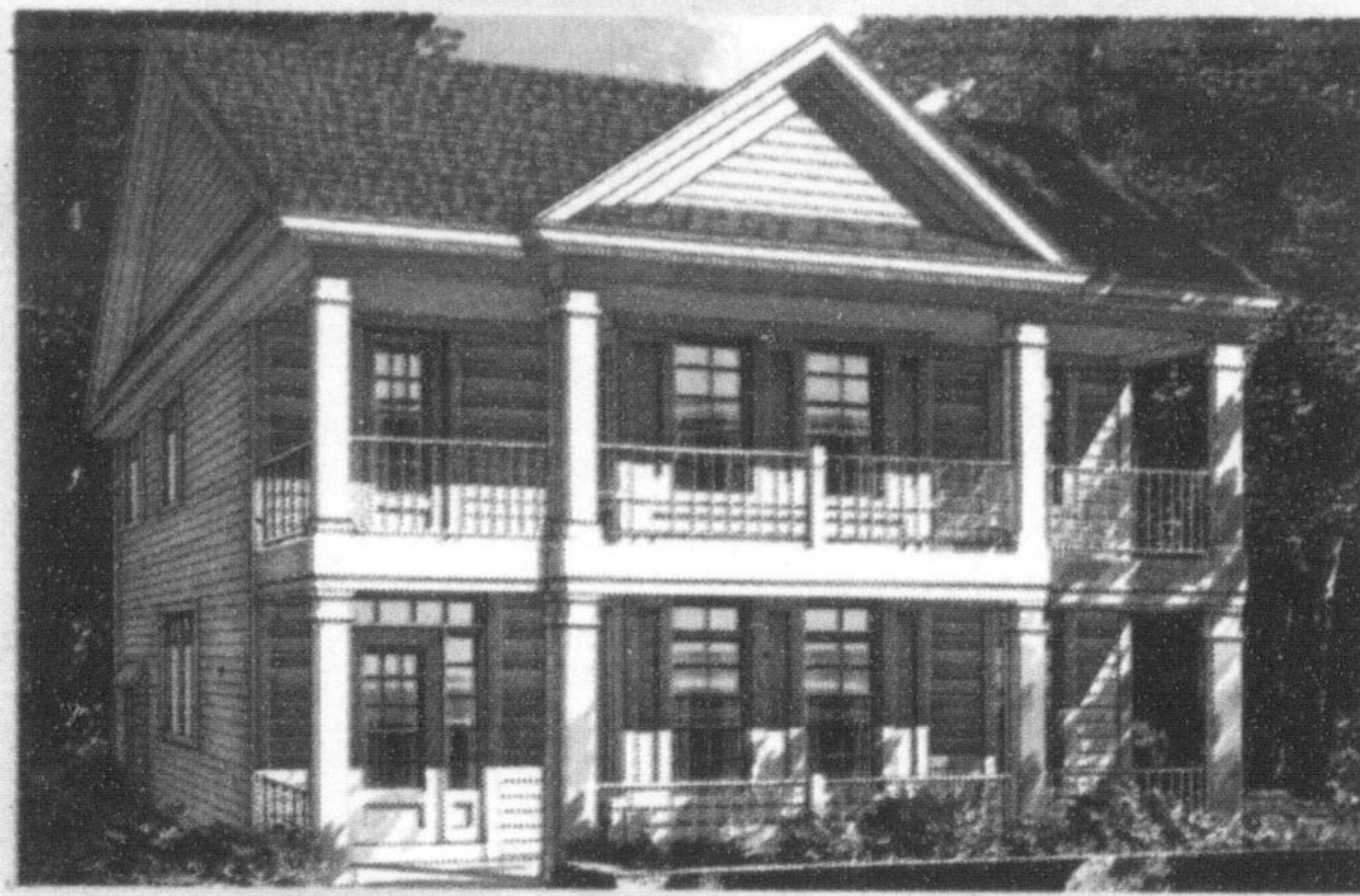
Courtyard Home, The Ferngrove 'C', 2,068 Sq.Ft., $388,990

Main Street Townhomes From $238,990 WideLot™ Semis From $257,990 46' WideLot™ From $355,990 Courtyard Homes From $379,990