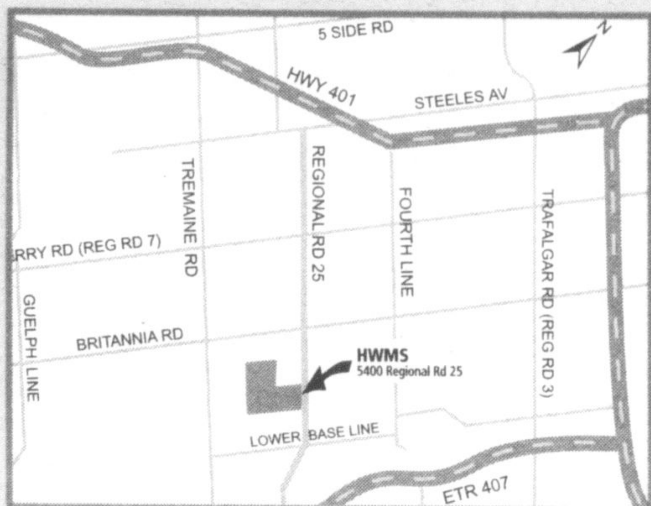
The Halton Waste Management Site 5400 Regional Road 25. Open Monday to Saturday, 8:00 a.m. - 4:30 p.m. (excluding holidays)