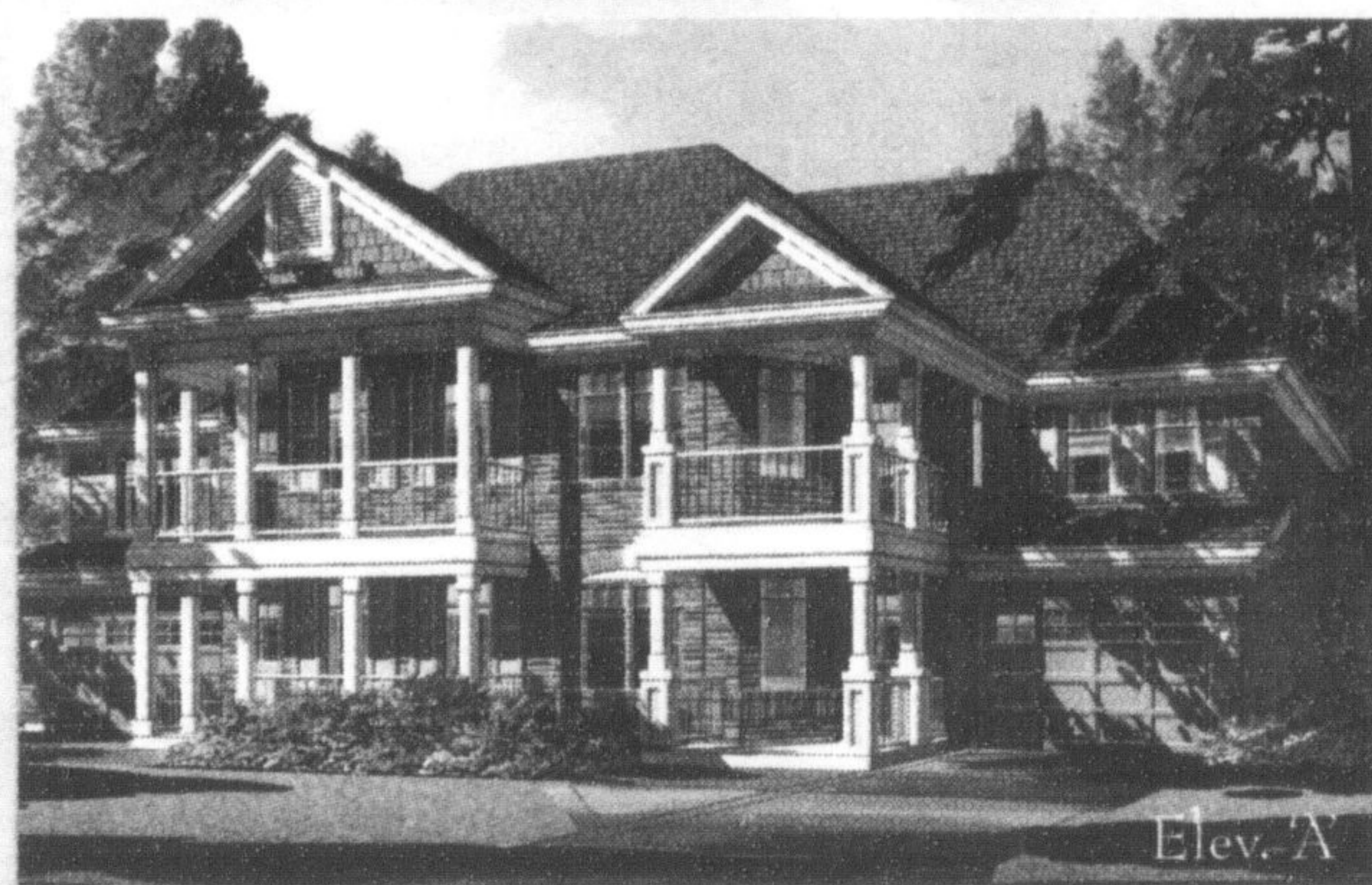
WideLot™ Semi, The Wedgemont 'A', 2,082 Sq.Ft., $300,990