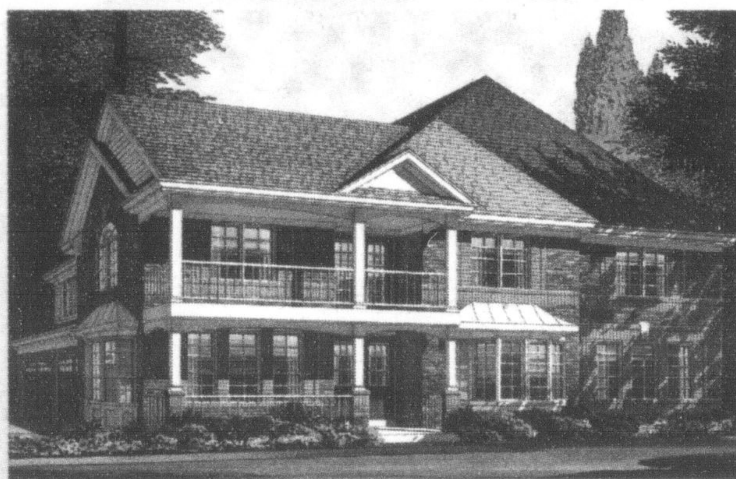
46' WideLot™, The Mannington Corner 'A', 2,690 Sq.Ft., $394,990