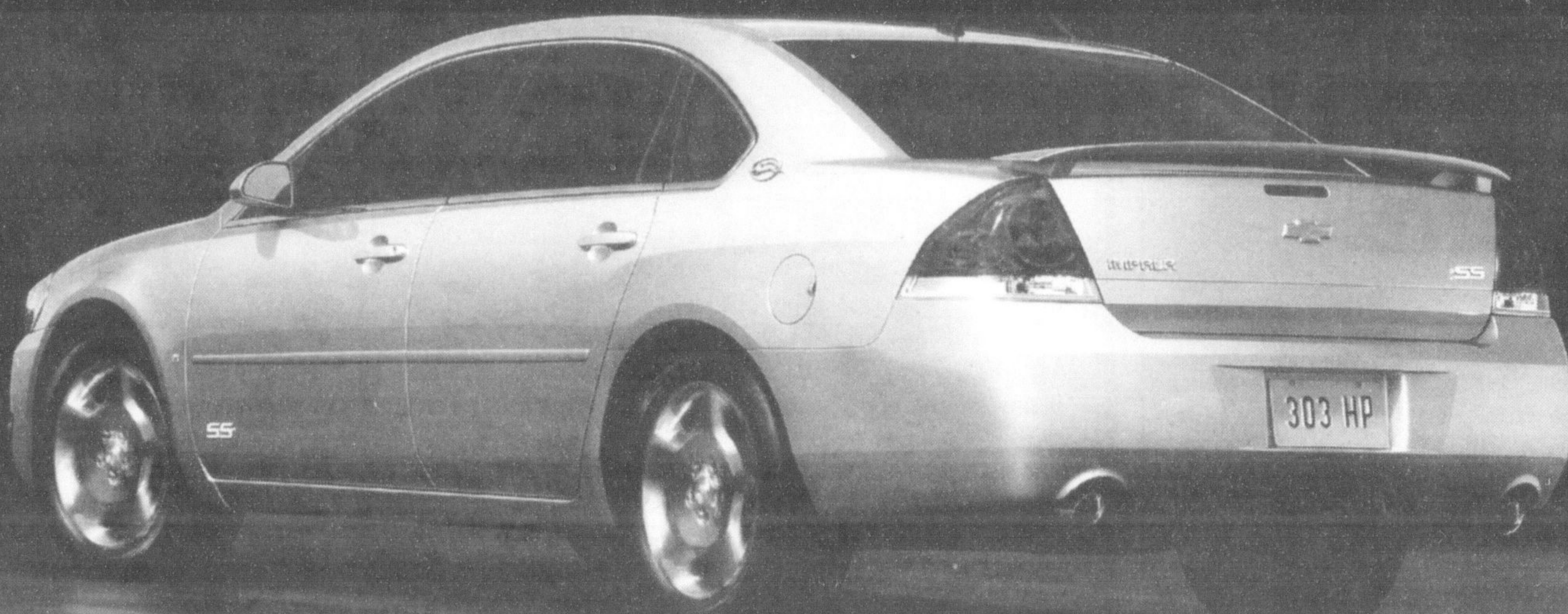
303 HP IMPALA SS AS SHOWN $32,855