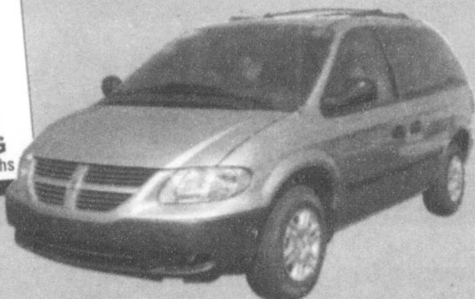
2005 DODGE CARAVAN CANADIAN EDITION

CASH BACK UP TO $7,000 PLUS 0% PURCHASE FINANCING For Up To 36 mths