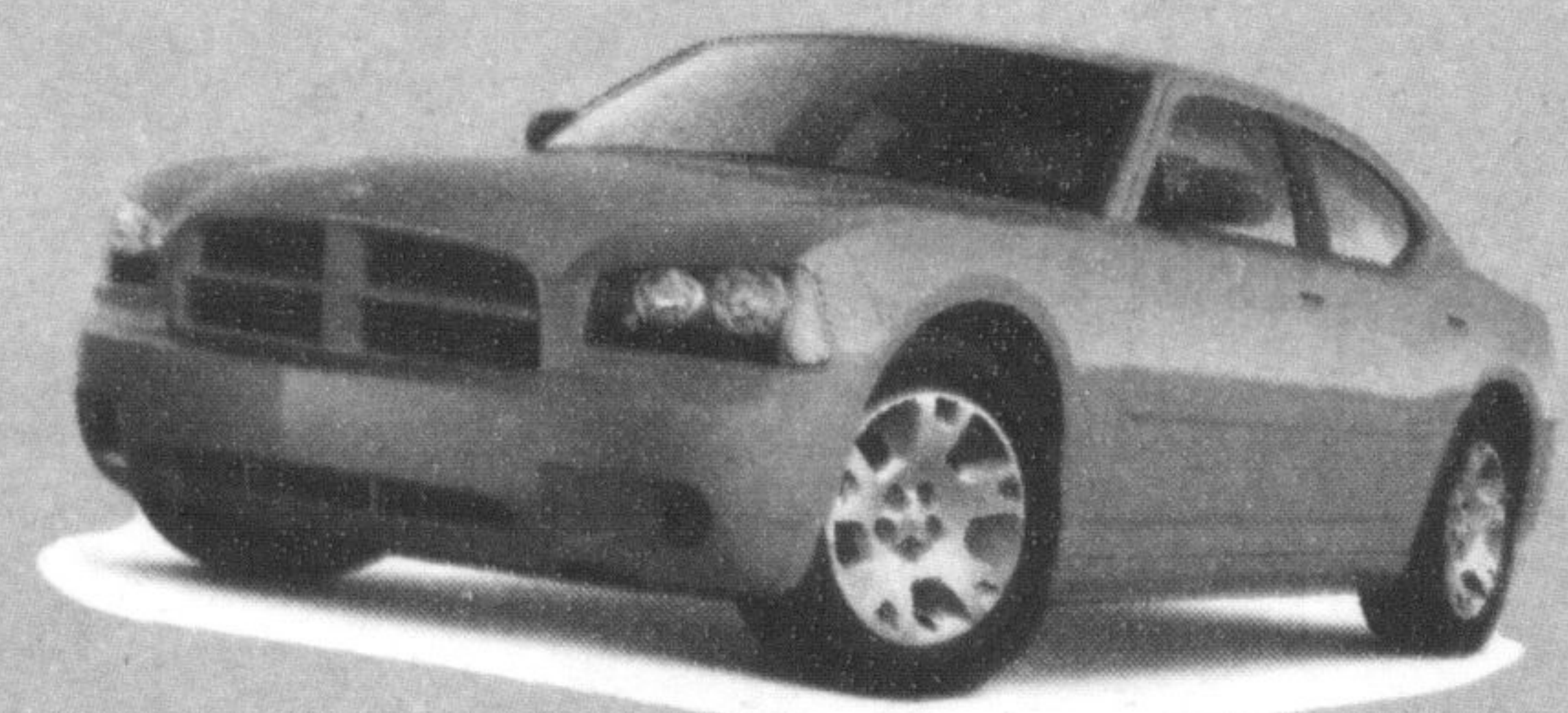
2006 DODGE CHARGER

CASH BACK UP TO $6,000 PLUS 0% PURCHASE FINANCING For Up To 60 mths