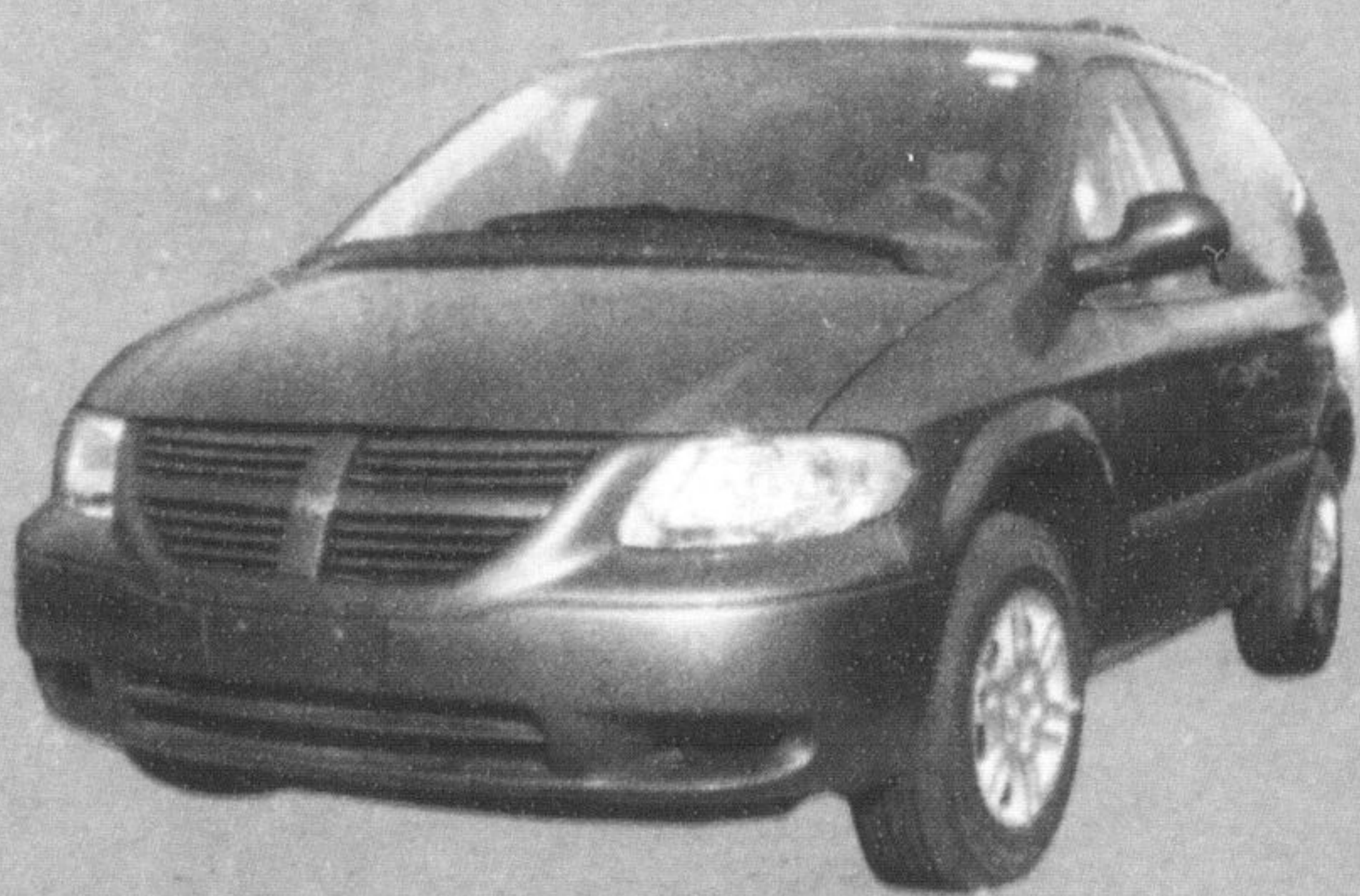
2005 DODGE GRAND CARAVAN

PURCHASE FOR $36,495** LEASE FOR $399† per mth for 48 mths with $0 SECURITY DEPOSIT $0 DOWN PAYMENT