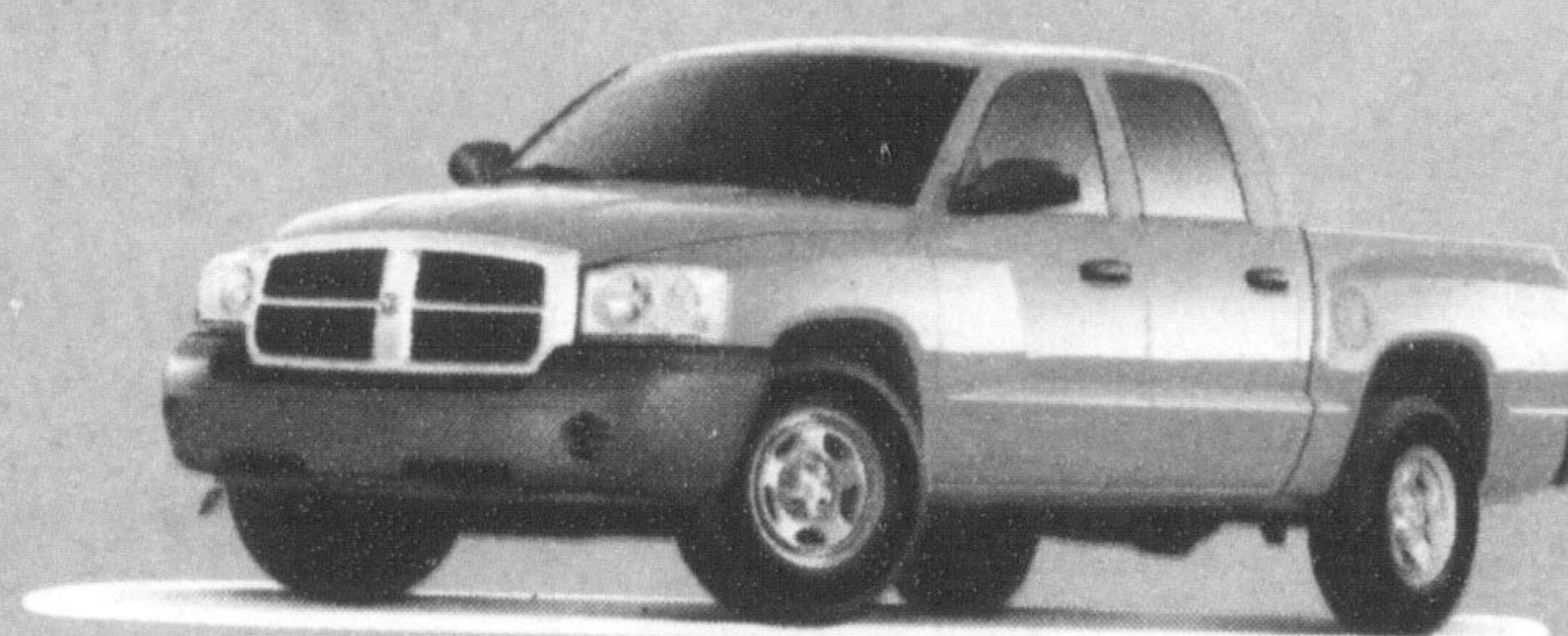
2005 DODGE DAKOTA

CASH BACK UP TO $6,000 PLUS 0% PURCHASE FINANCING For Up To 60 mths