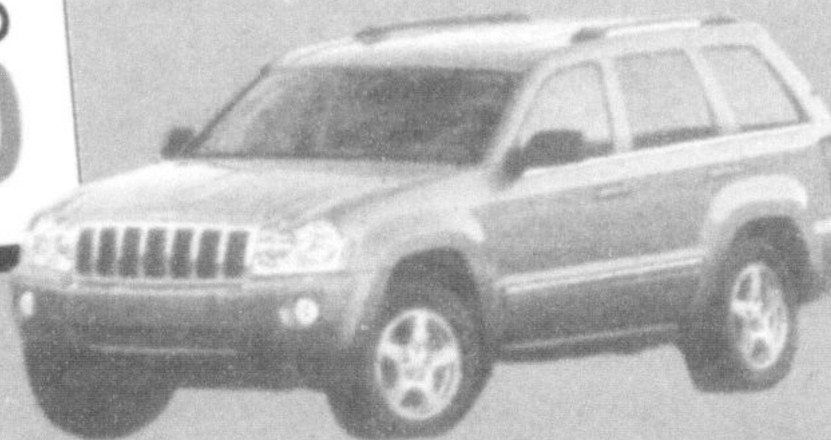
2005 JEEP GRAND CHEROKEE LAREDO 4X4