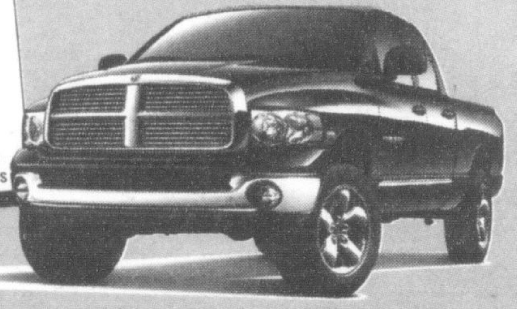
2005 DODGE RAM 1500 QUAD CAB SLT 4X4

CASH BACK UP TO $3,000 PLUS 0% PURCHASE FINANCING For Up To 60 mths