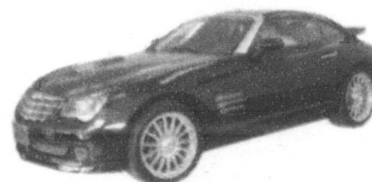
2005 CHRYSLER CROSSFIRE SRT6