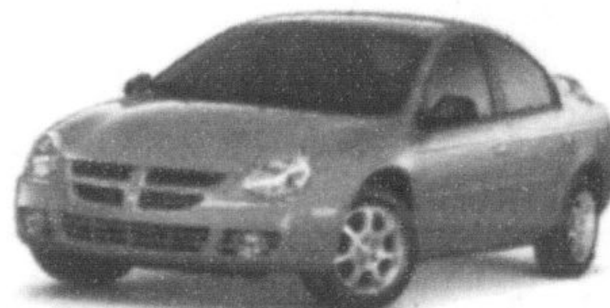
2005 DODGE SX 2.0