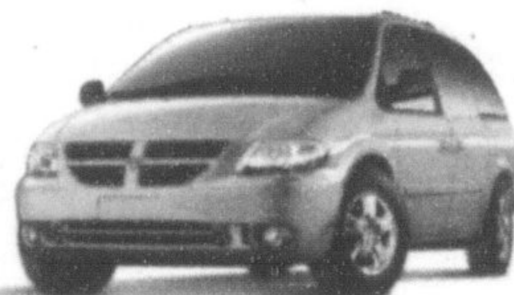
2005 DODGE GR. CARAVAN