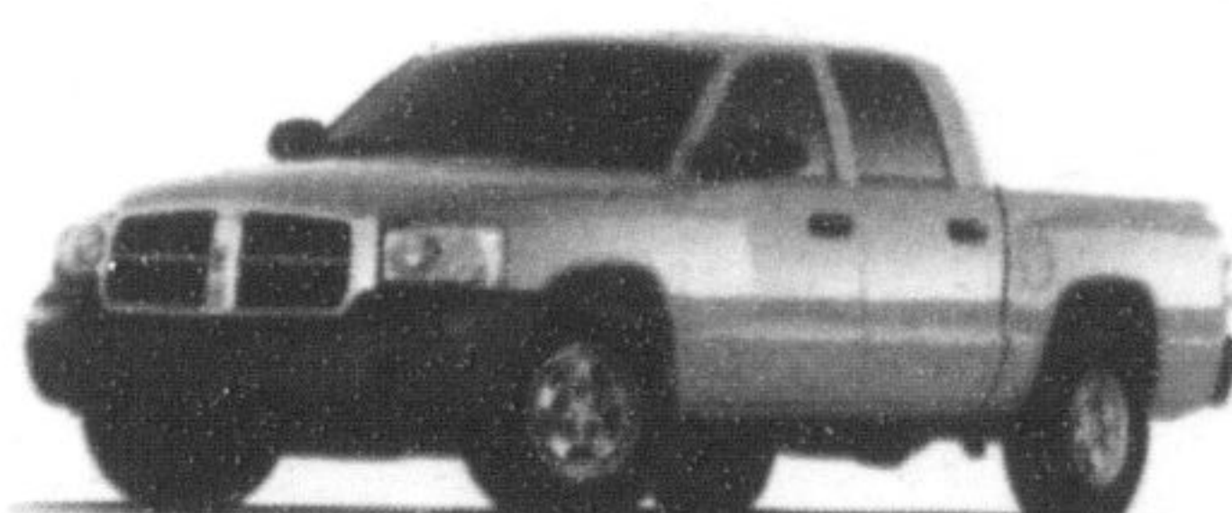
2005 DODGE DAKOTA