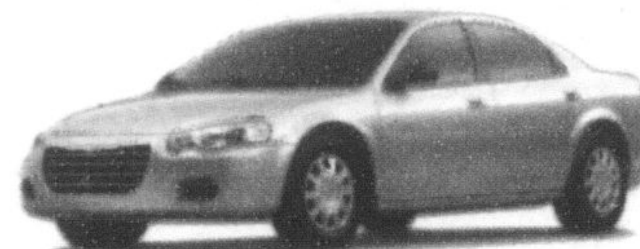
2005 CHRYSLER SEBRING