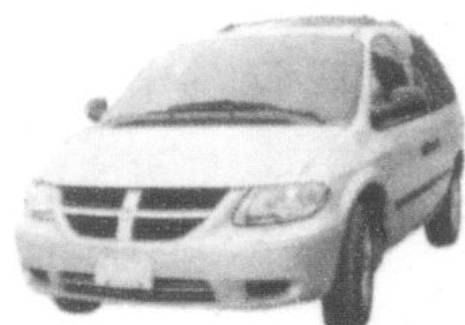
2005 DODGE CARAVAN

WE ARE MAKING OUR BEST POSSIBLE DEALS ON ALL OF OUR REMAINING IN-STOCK 2005 MODELS.