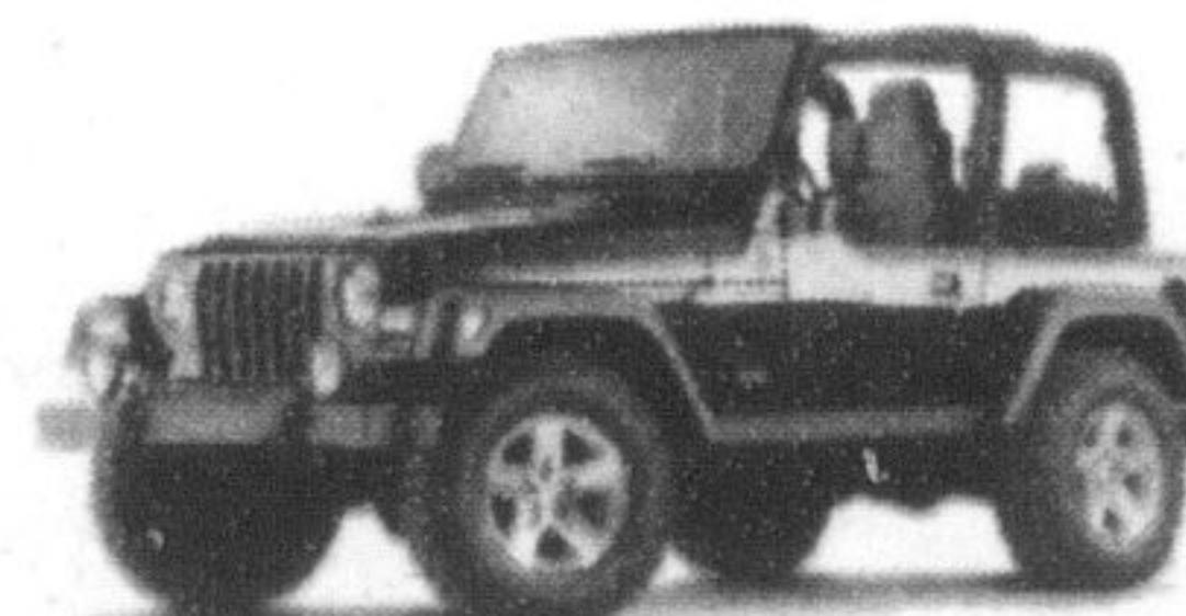
2005 JEEP TJ