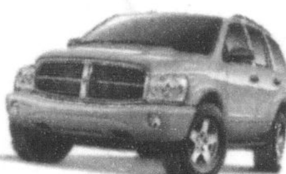
2005 DODGE DURANGO