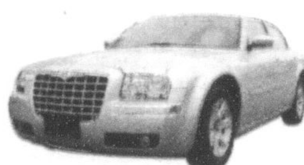
2005 CHRYSLER 300