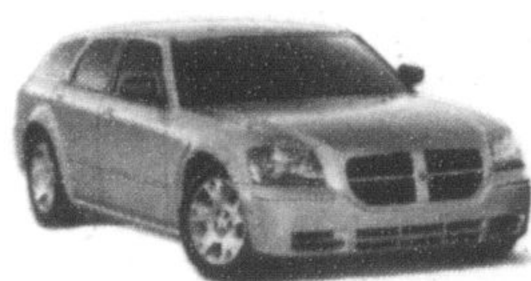
2005 DODGE MAGNUM