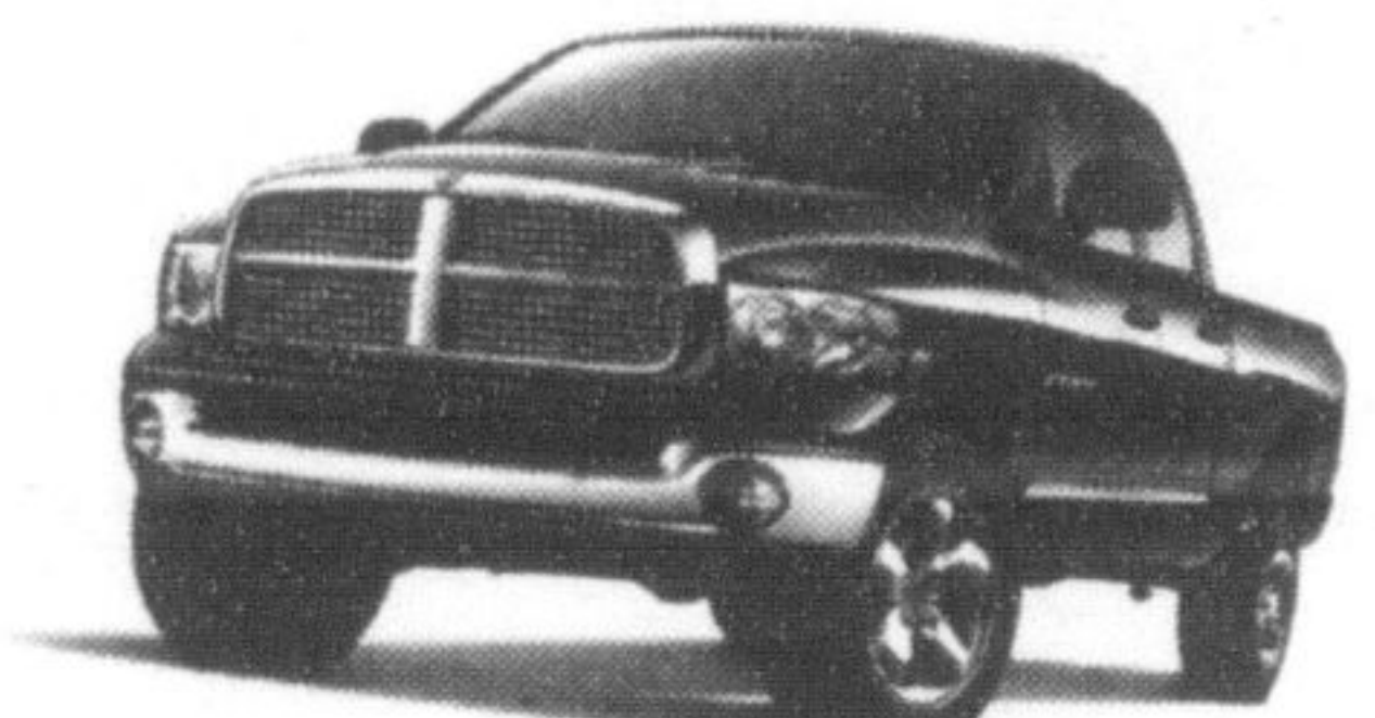
2005 DODGE RAM