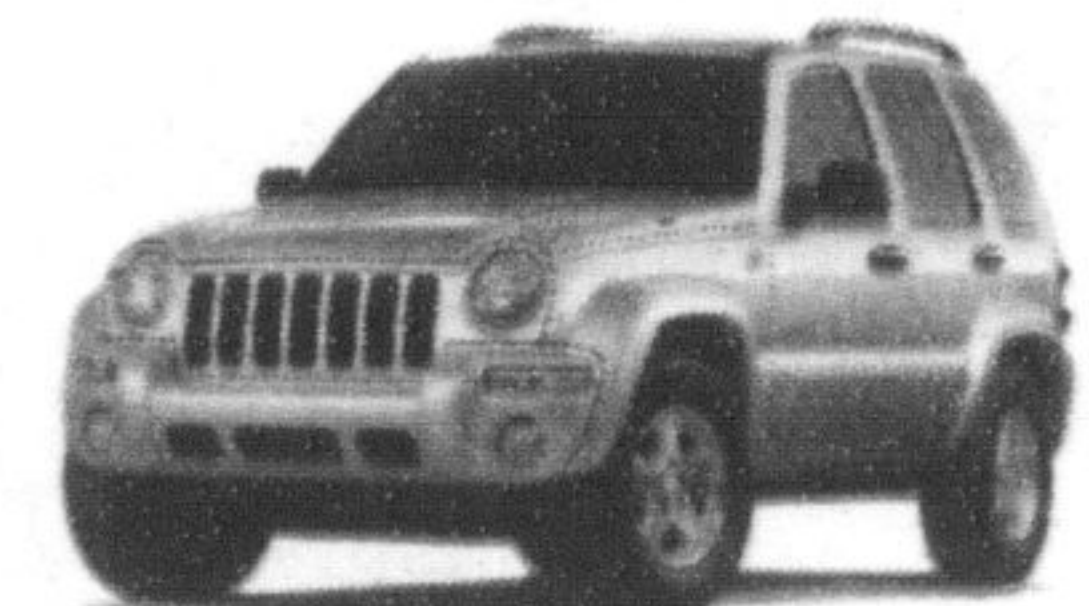
2005 JEEP LIBERTY