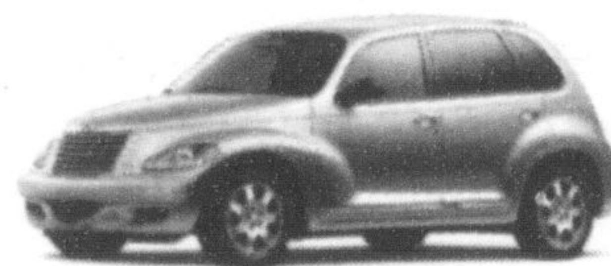
2005 CHRYSLER PT CRUISER