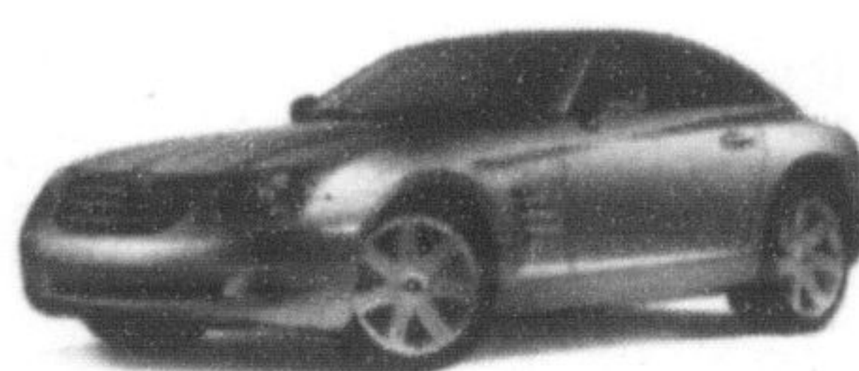
2005 CHRYSLER CROSSFIRE