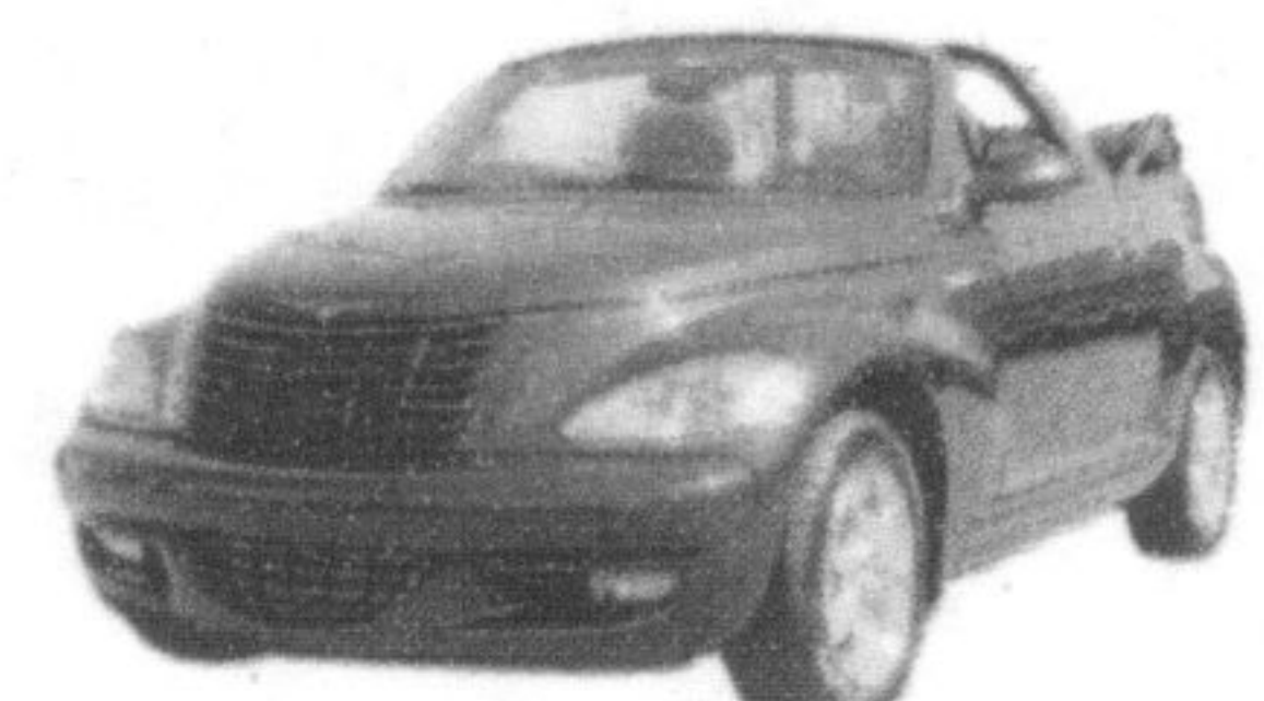
2005 CHRYSLER PT CRUISER CONVERTIBLE