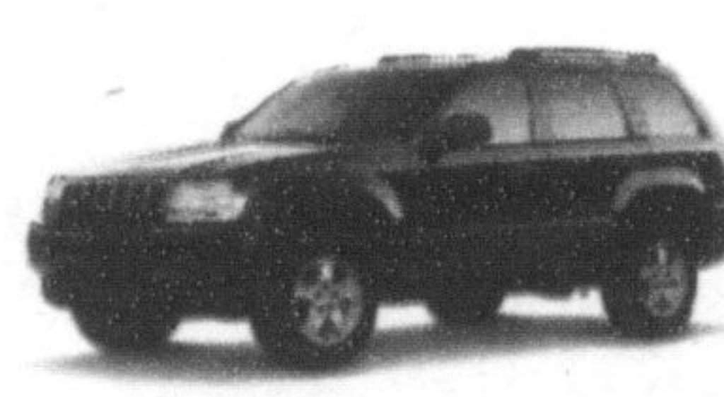
2005 JEEP GRAND CHEROKEE