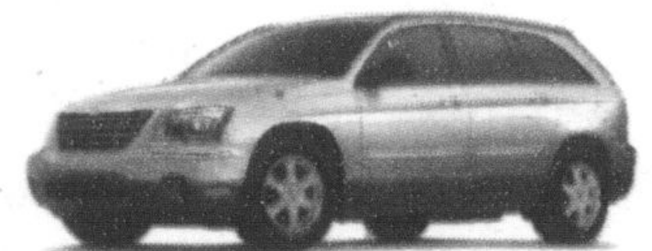
2005 CHRYSLER PACIFICA