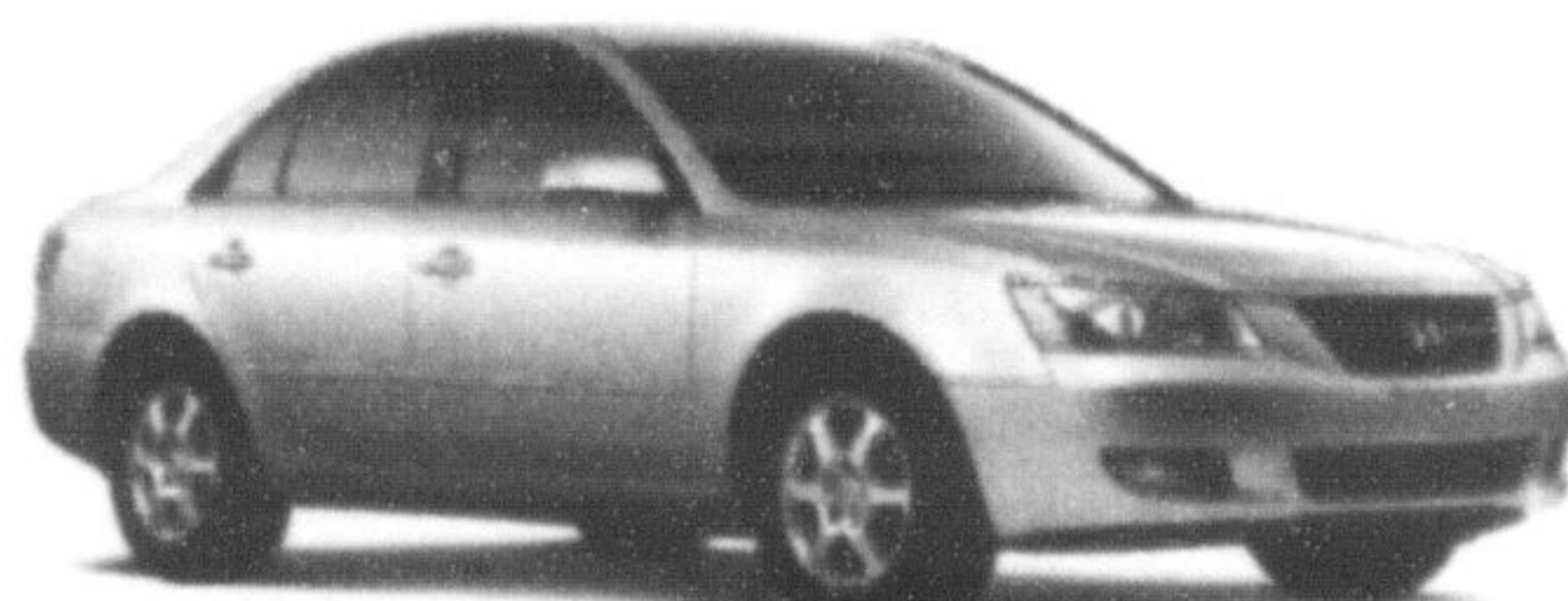
2006 SONATA GL 1.4 AUTO