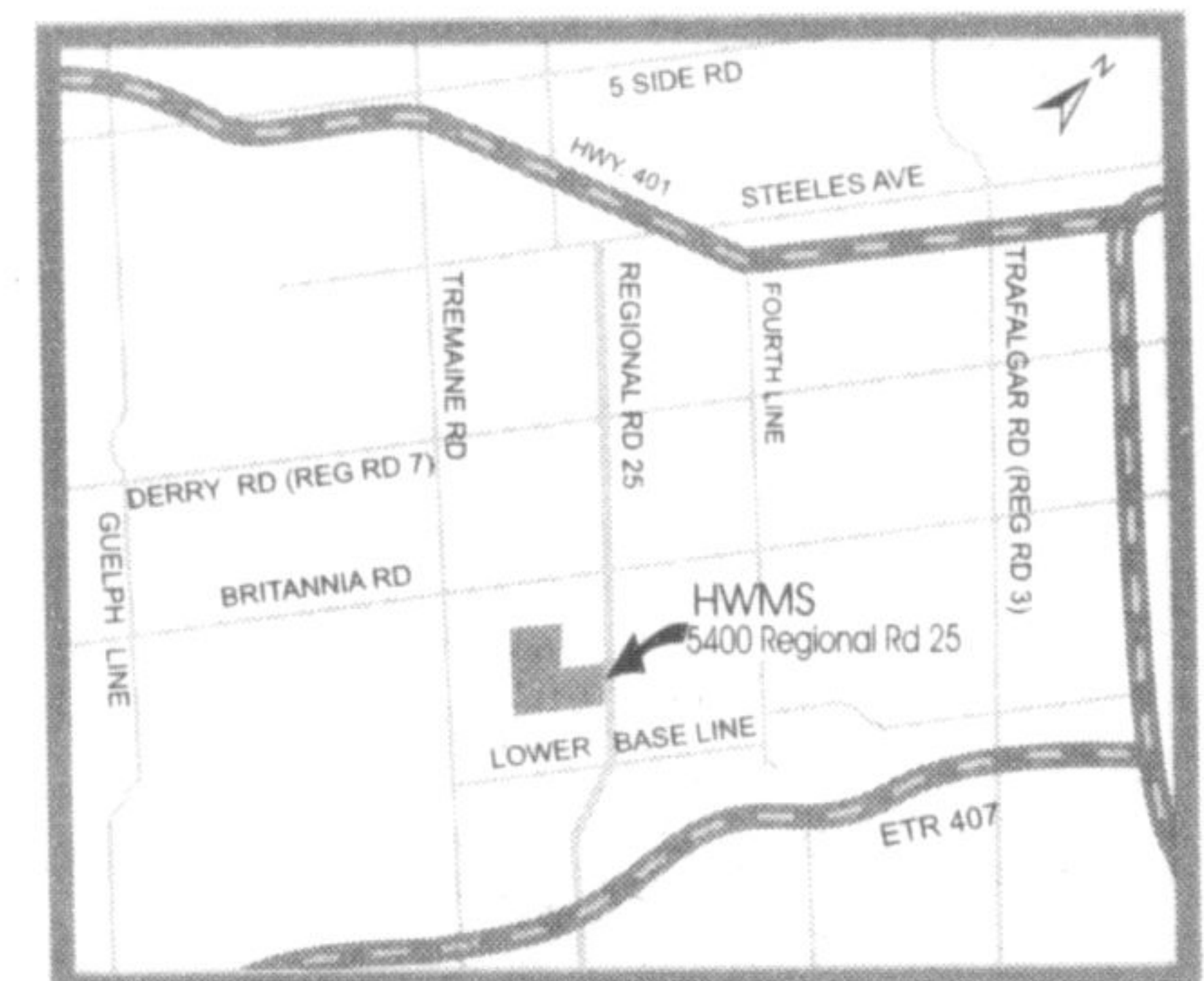
Halton Waste Management Site, 5400 Regional Rd. 25, Milton