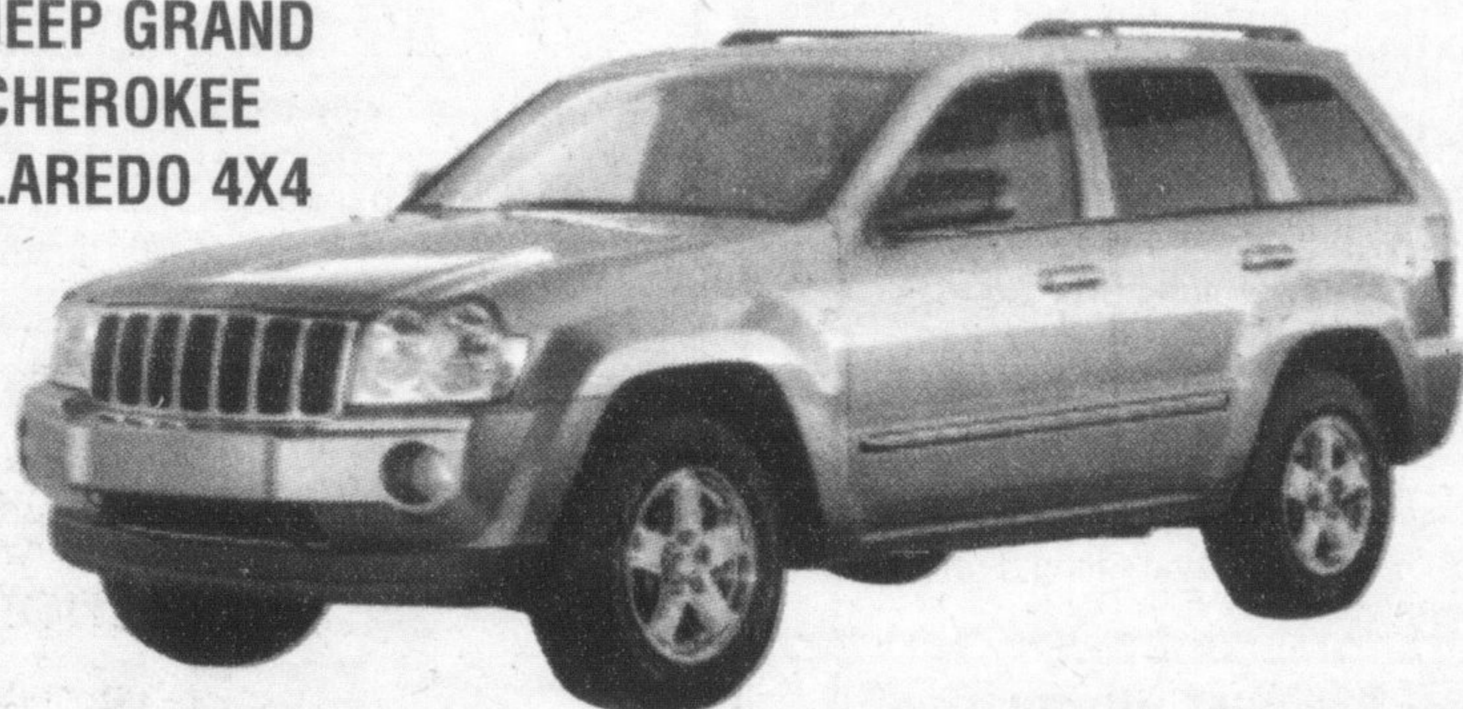
JEEP GRAND CHEROKEE LAREDO 4X4