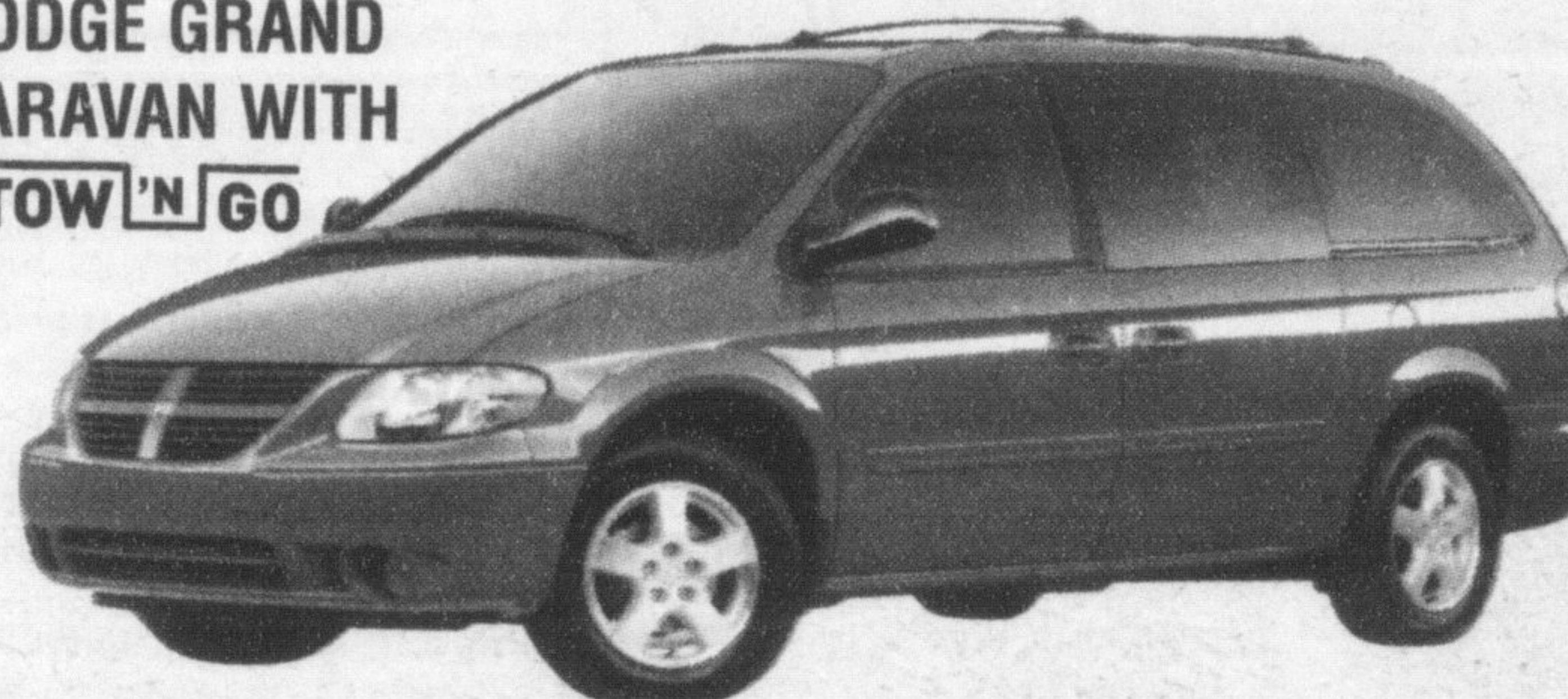
DODGE GRAND CARAVAN WITH STOW'N'GO