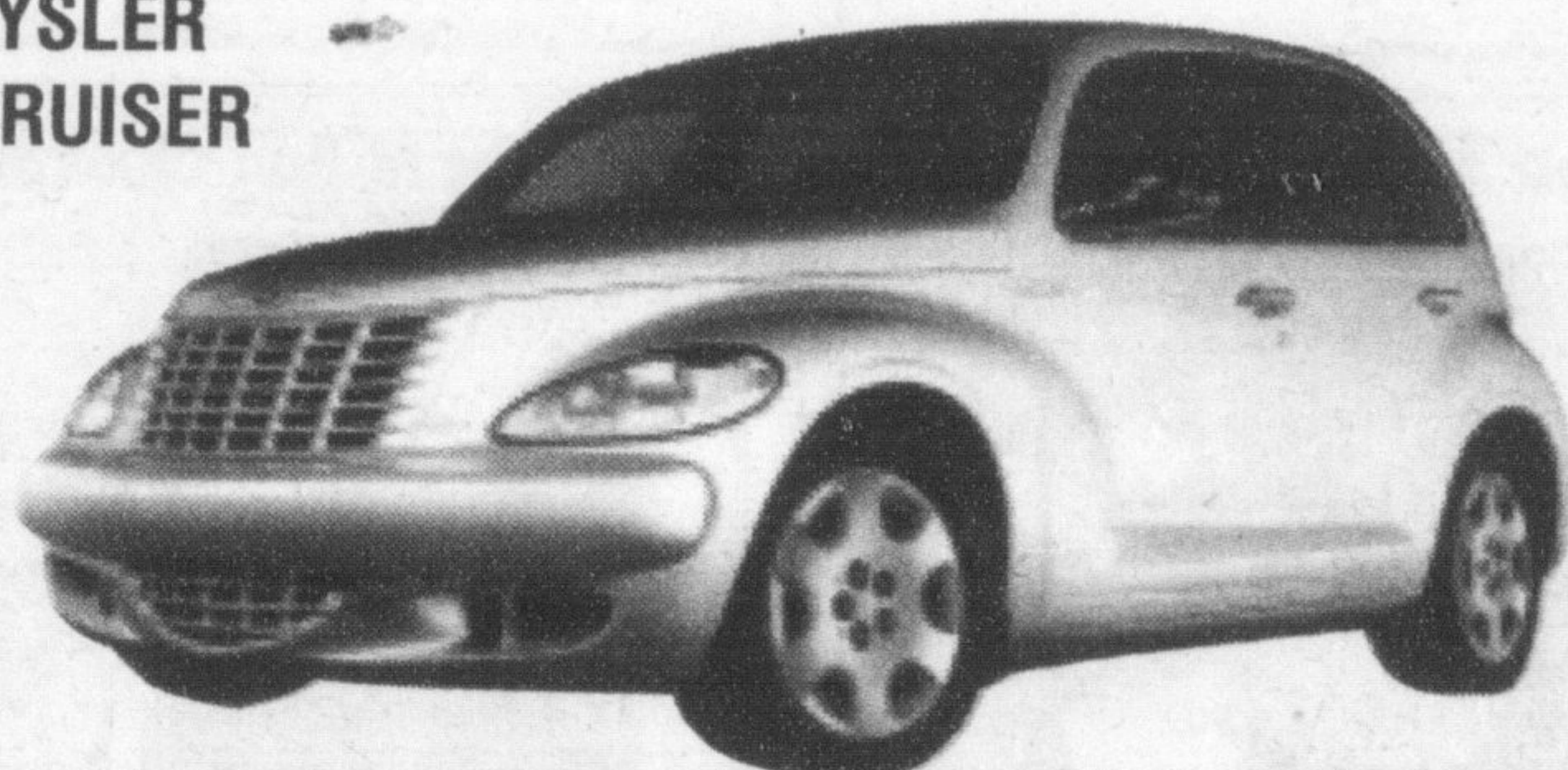
CHRYSLER PT CRUISER

on select 2005 vehicles. OR choose employee pricing plus great low purchase or lease financing.