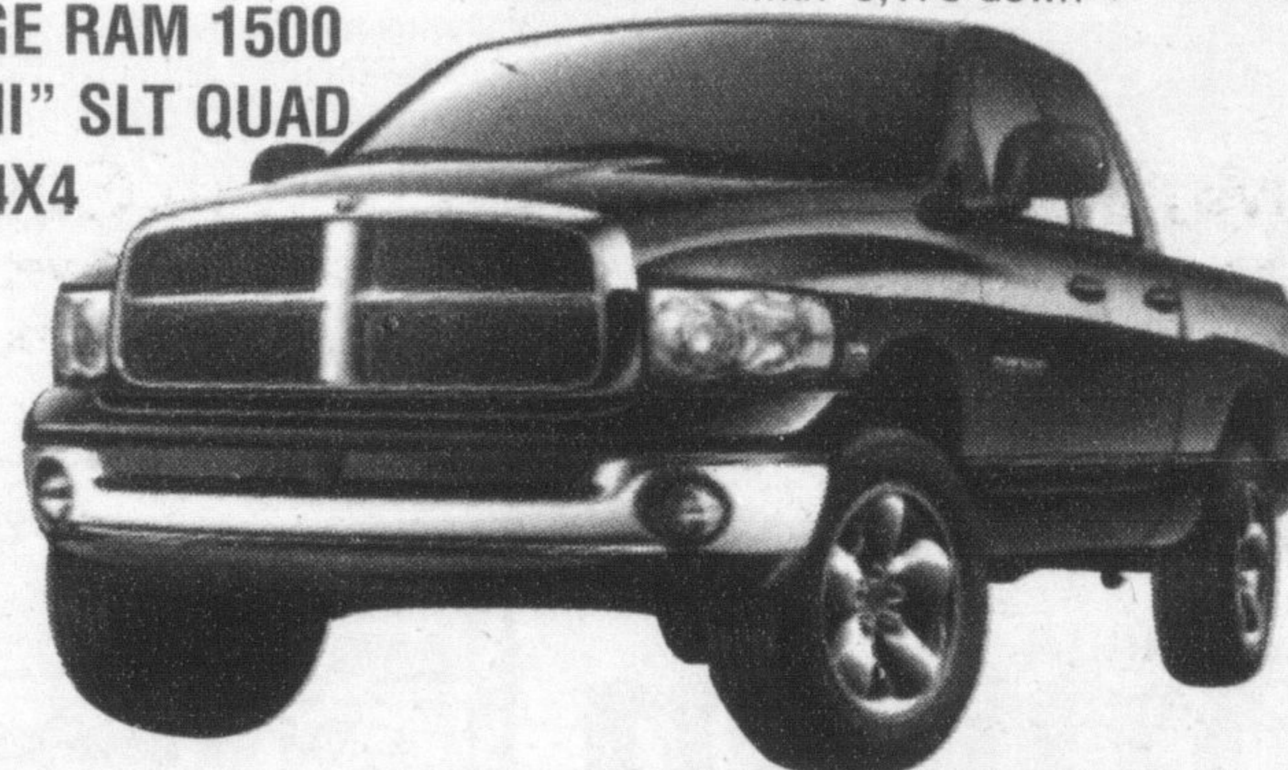
DODGE RAM 1500 "HEMI" SLT QUAD CAB 4X4