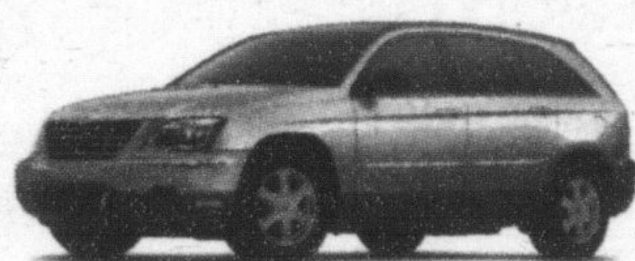
2005 Chrysler Pacifica