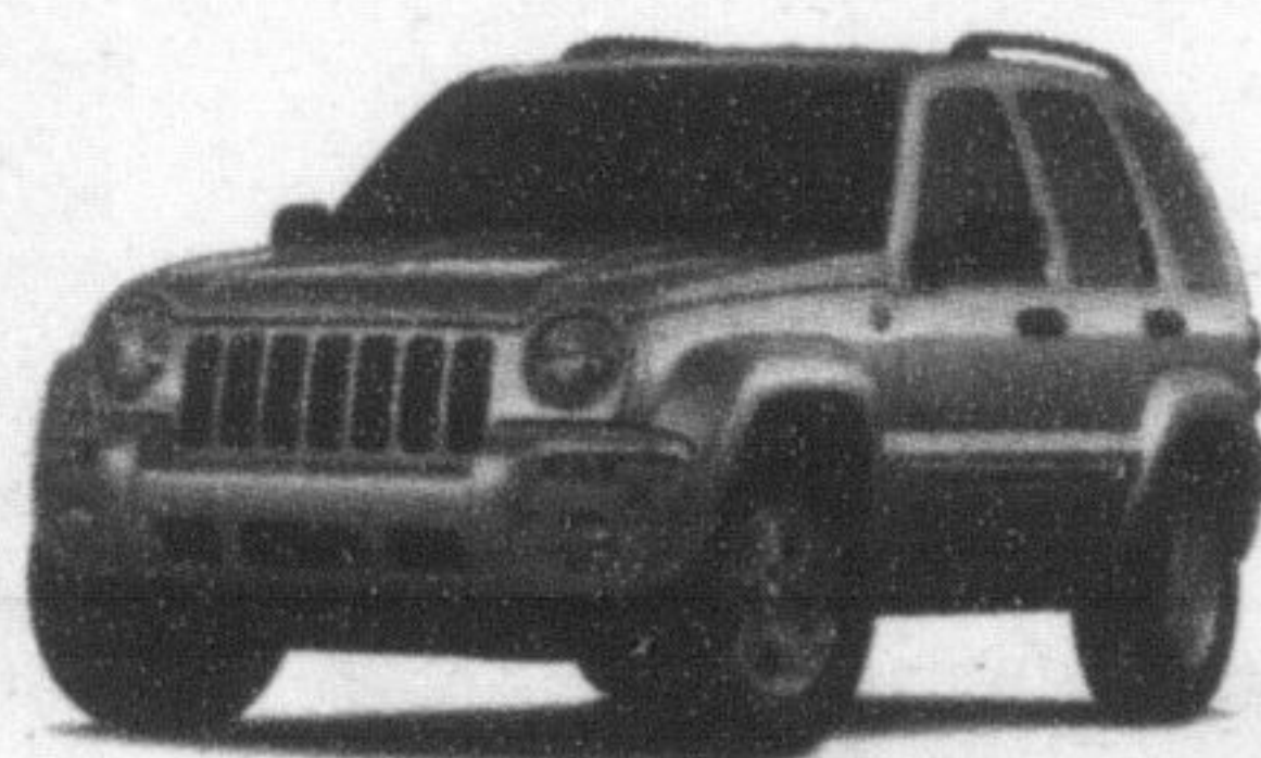
2005 Jeep Liberty