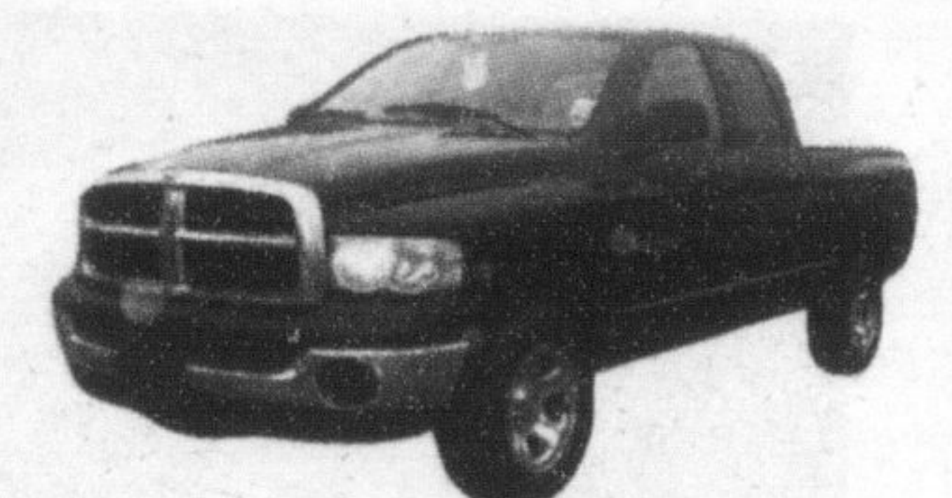
2005 Dodge Ram