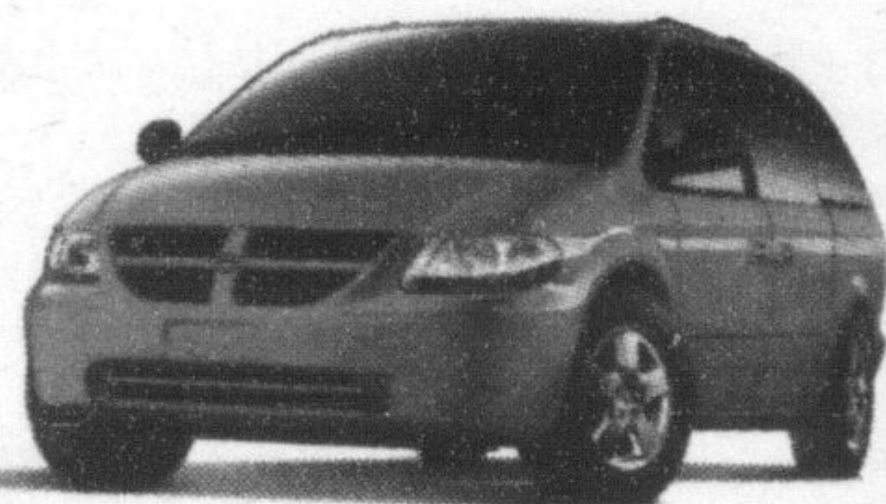
2005 Dodge Grand Caravan

You pay what we pay until August 2, 2005