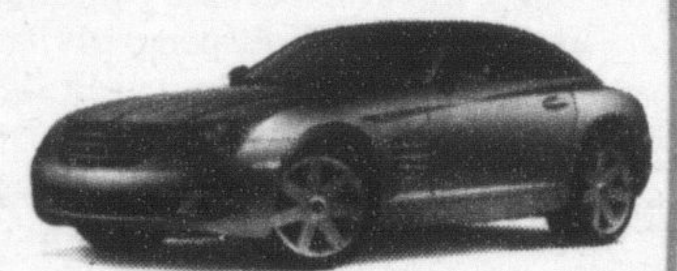
2005 Chrysler Crossfire