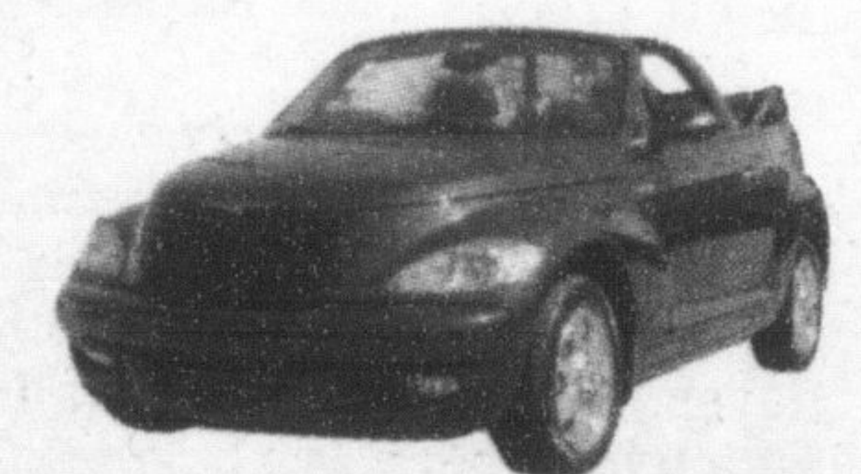
2005 PT Cruiser Convert