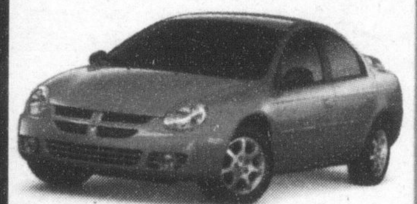
2005 Dodge SX 2.0