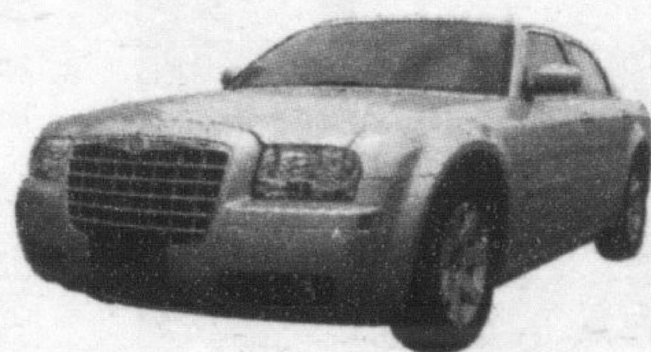
2005 Chrysler 300