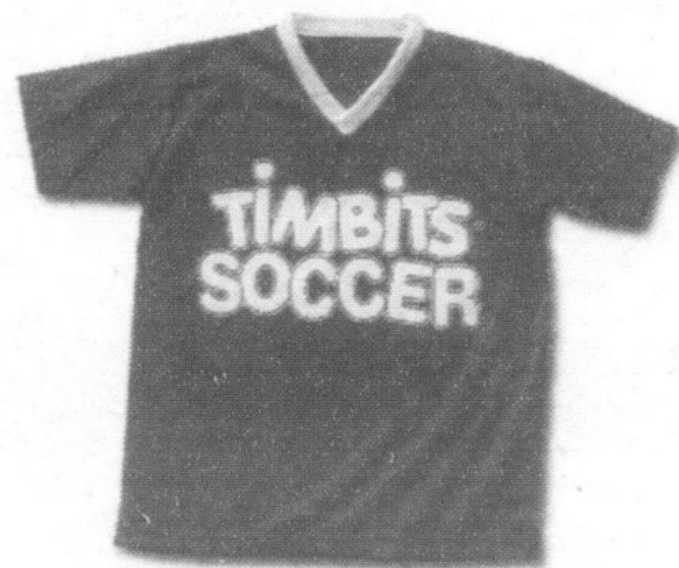
The first goal is having fun.

Soccer. Sport or game? For kids starting out, it should be a game, first and foremost. In Timbits Soccer kids are taught how to play, and more importantly, how to have fun playing. With over 45,000 Timbits Soccer players in Canada, kids are proving they love games. That's why your local Tim Hortons is proud to sponsor Timbits Soccer.