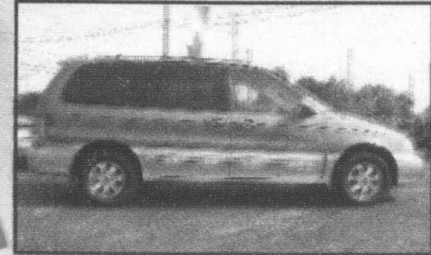
2004 SEDONA EX LUXURY

$19,692 CASH PURCHASE OR BI-WEEKLY $198 $3000 DOWN