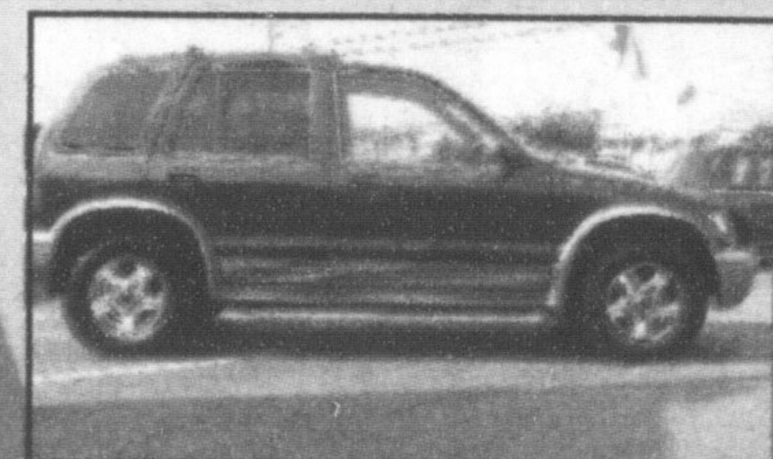
2001 SPORTAGE LTD.

$11,788 CASH PURCHASE OR BI-WEEKLY $126 $2000 DOWN