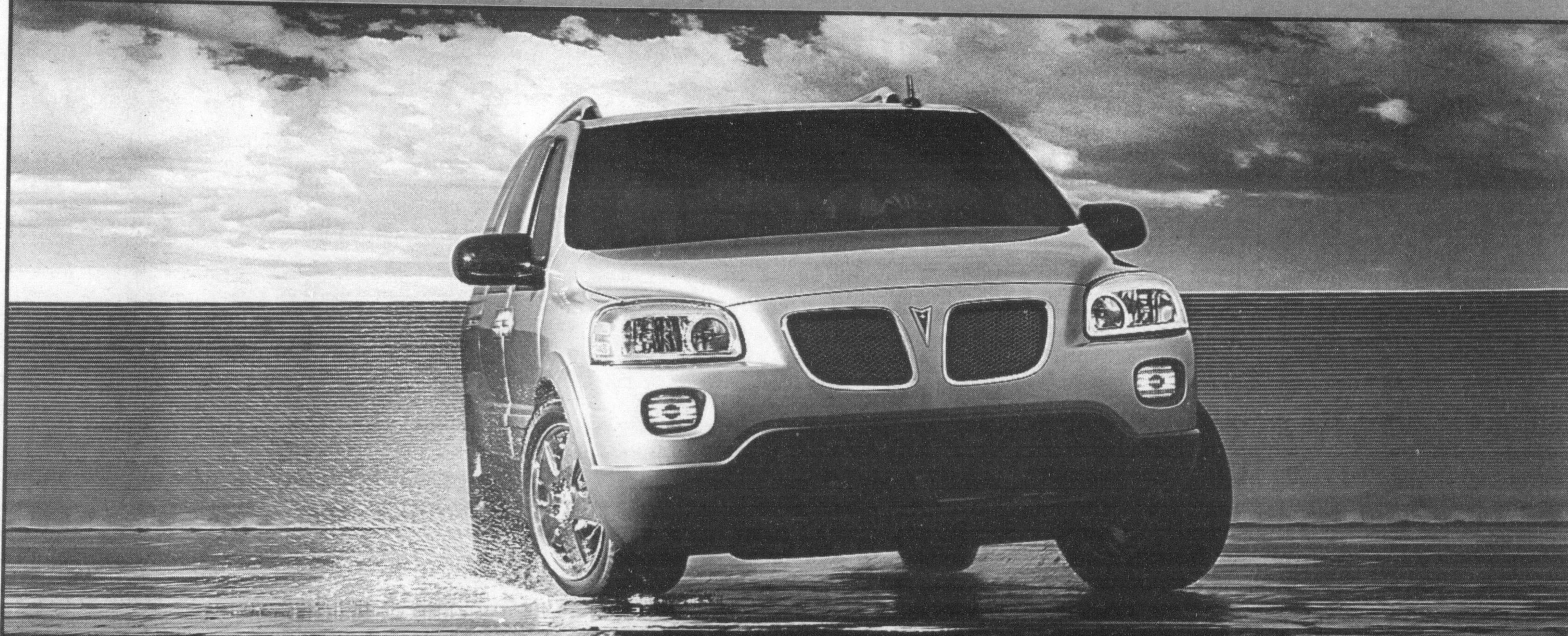
EWB Pontiac Montana SV6 model shown