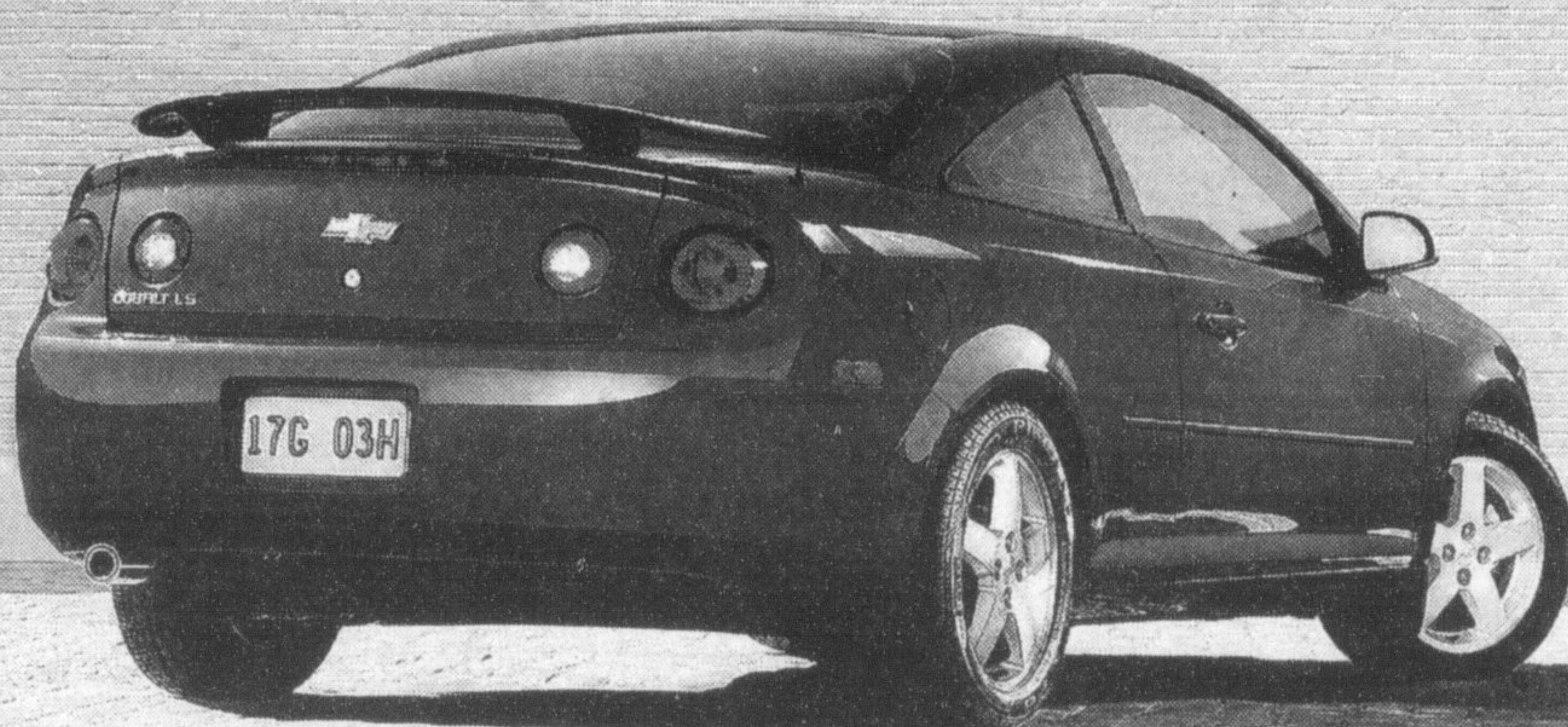
COBALT COUPE Cobalt Coupe LS with Sports Appearance Package and 16" Aluminum Wheels Shown