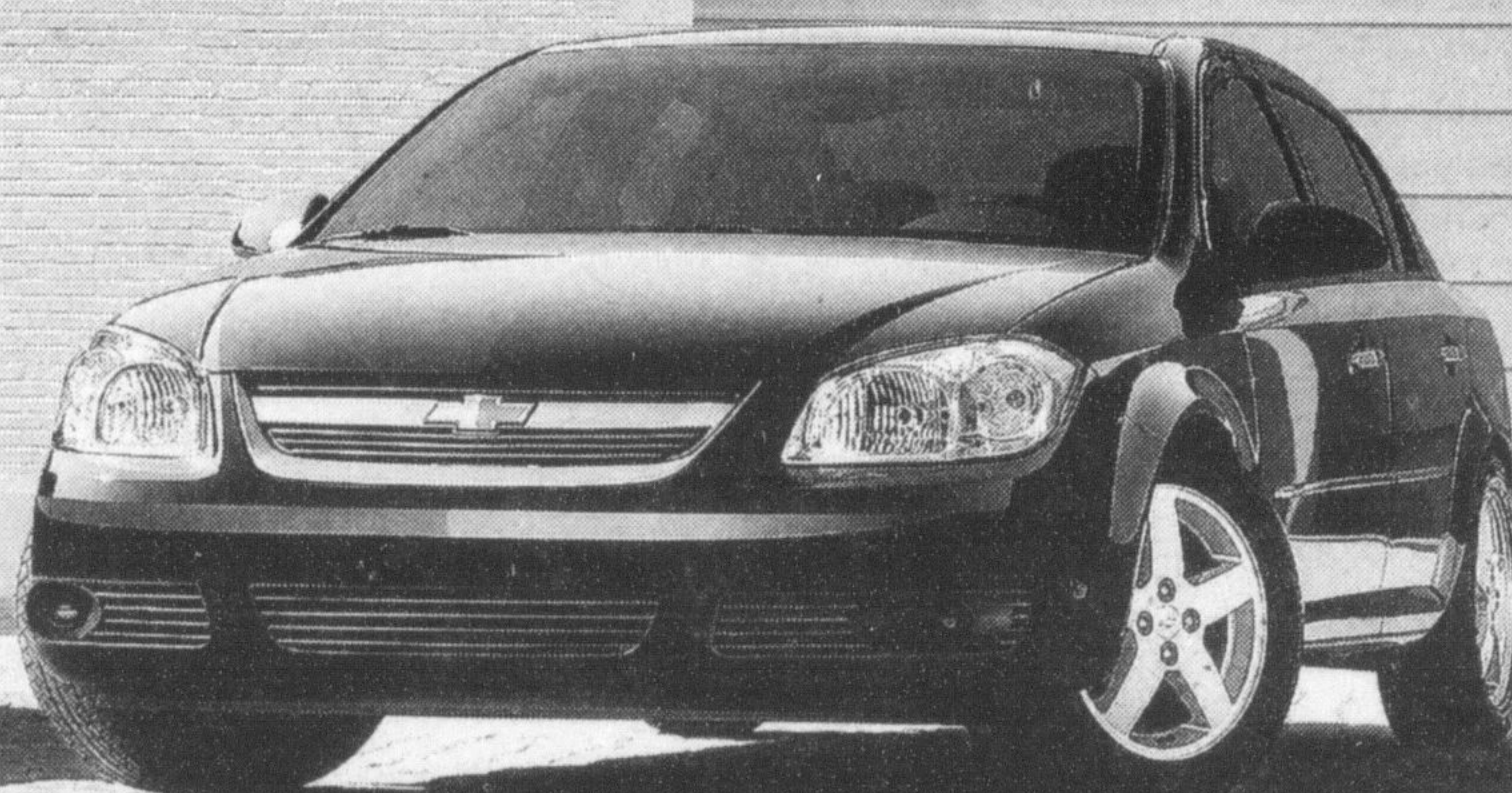
COBALT SEDAN Cobalt LT Sedan Shown