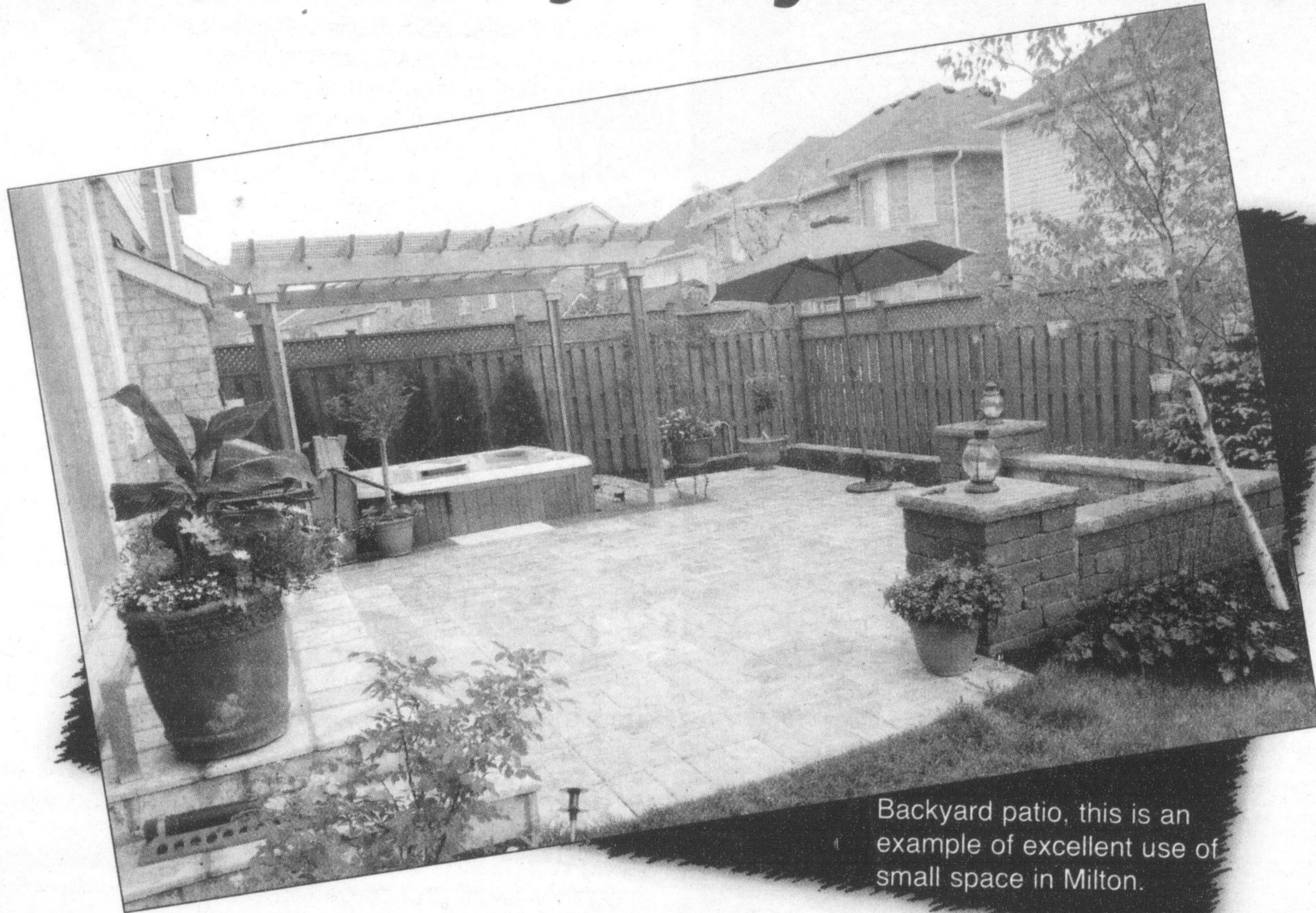
Backyard patio, this is an example of excellent use of small space in Milton.