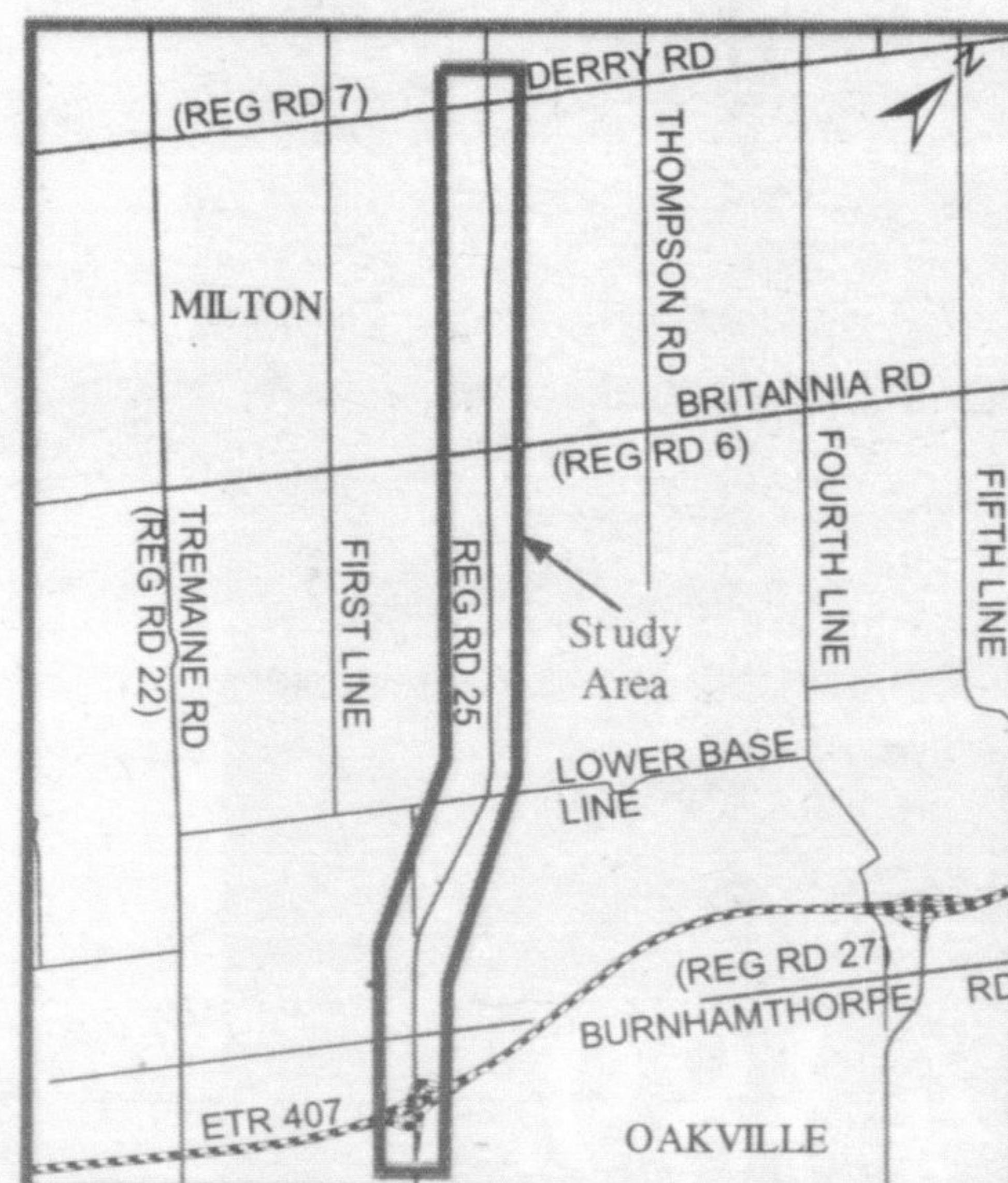
The map below shows the approximate limits of the study area.

Requests must be received by the Minister by June 28, 2005, with a copy sent to the Regional Clerk (address below) and the Region's Project Manager. If there are no requests to change the status of the project to an Individual EA by this date, the Region of Halton may proceed to construction, subject to available funding and receipt of the necessary approvals.