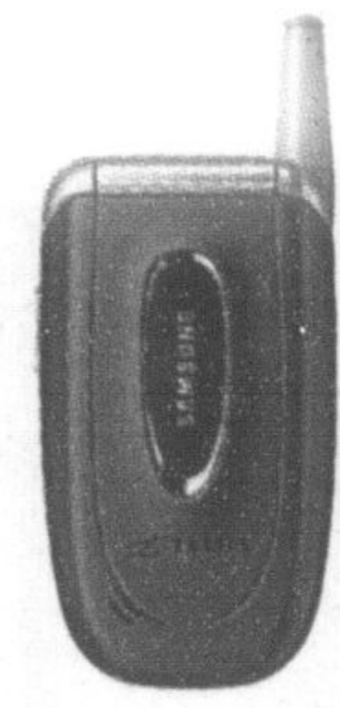
Samsung A650 FREE* 2 year contract

VON Alzheimer Services offers a monthly support group for caregivers of people with Alzheimer's disease and relatives. • see more DATELINE on page B11