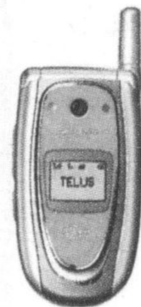
LG 6190 $99.99* 3 year contract