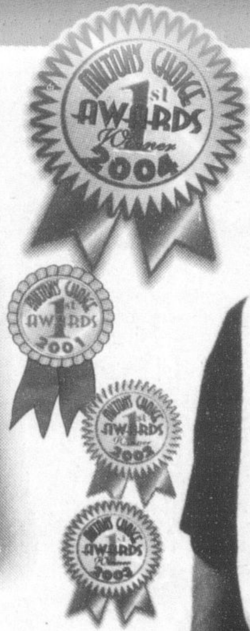
As our clients vary, so do their results.