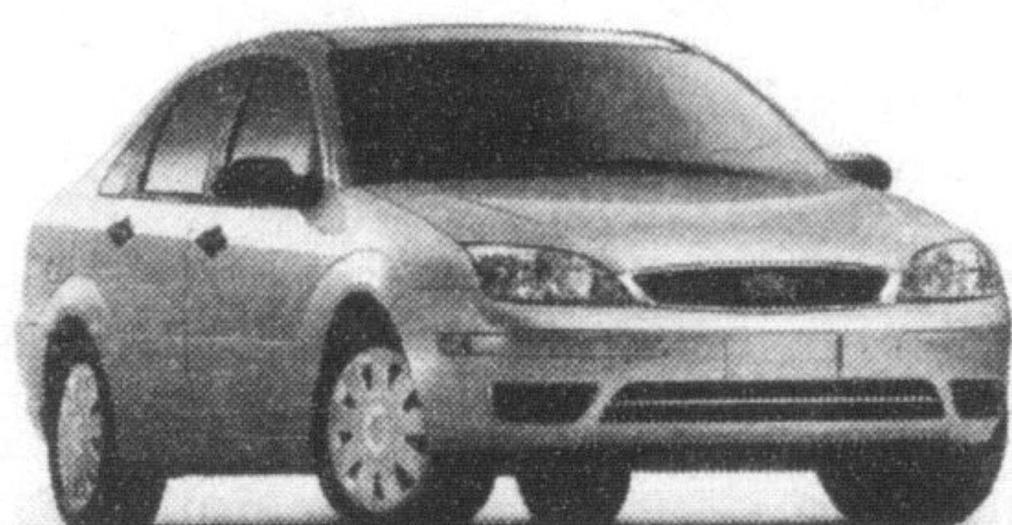
2005 FOCUS ZX4