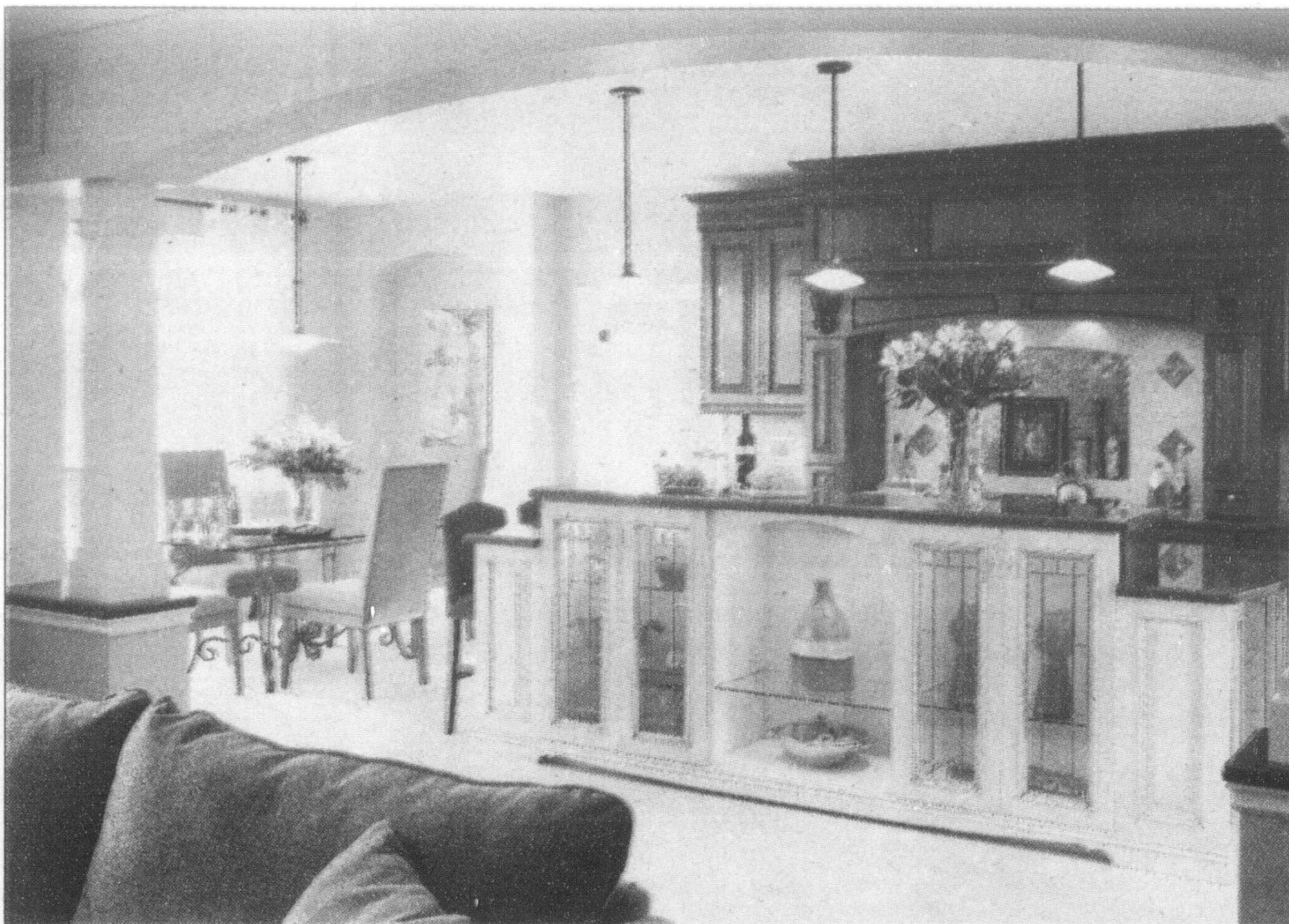
Charleston Homes will customize your home to suit your tastes, needs and lifestyle.

Nestled next to the Rockwood Conservation Area and the Eramosa