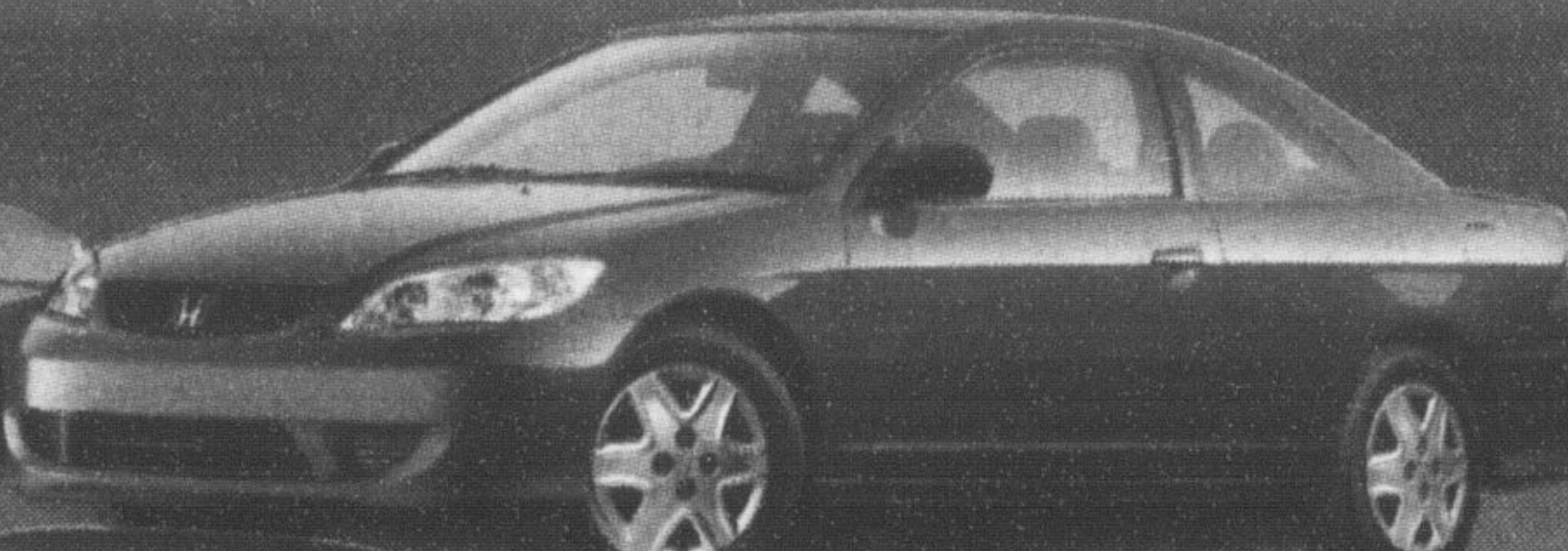
Civic SPECIAL EDITION

Civic DX delivers advanced Honda engineering, unbeatable reliability, top-ranked fuel economy and strong resale value. Features include: 1.7L SOHC 16-Valve Engine Dual Stage, Dual Threshold Front Airbags Power Steering & Brakes 4-Wheel Independent Suspension ECU Immobilizer Civic's Exclusive Flat Rear Floor 5-speed Manual Transmission Front/Rear Stabilizer Bars