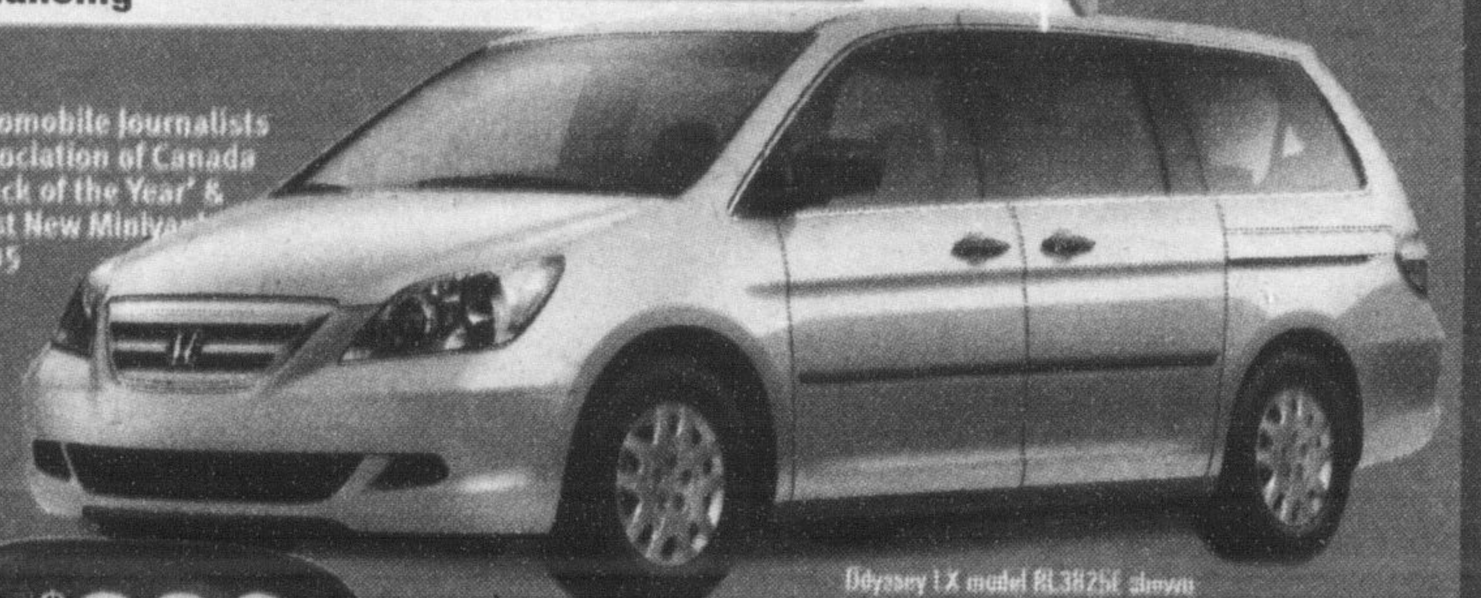
Odyssey LX model RL3825L shown

Automobile Journalists Association of Canada 'Truck of the Year' & 'Best New Minivan' 2005 ajac.ca