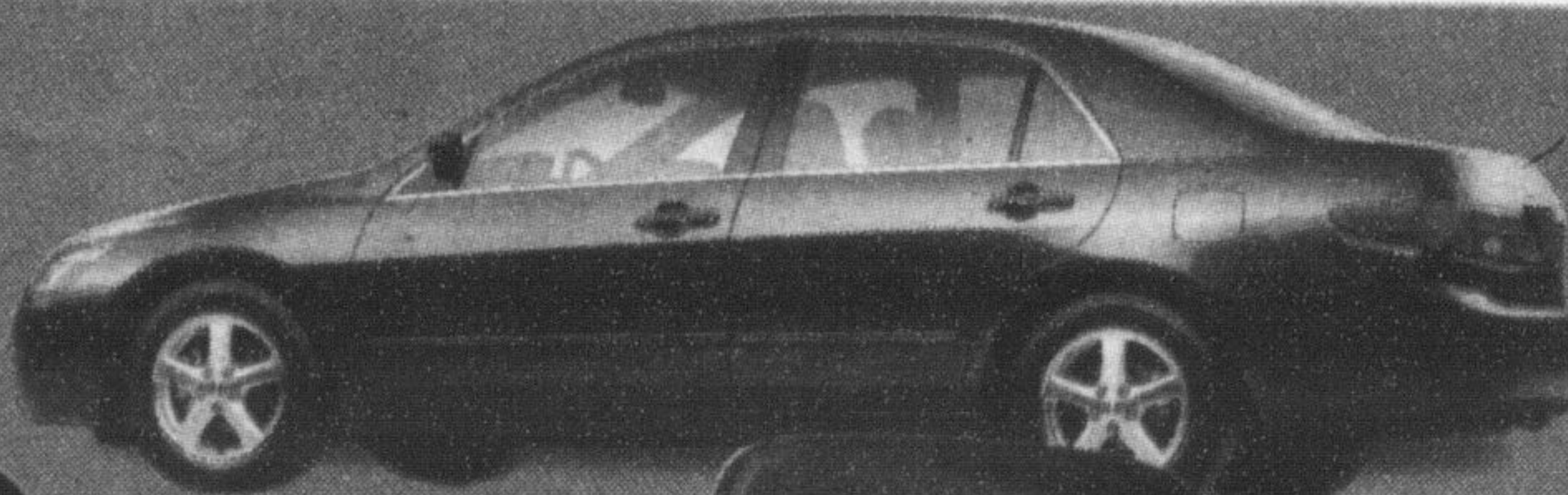
Accord Sedan LX-L model CM5665JN shown