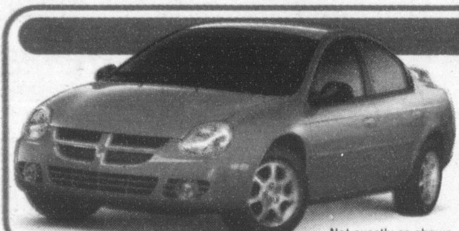
Not exactly as shown