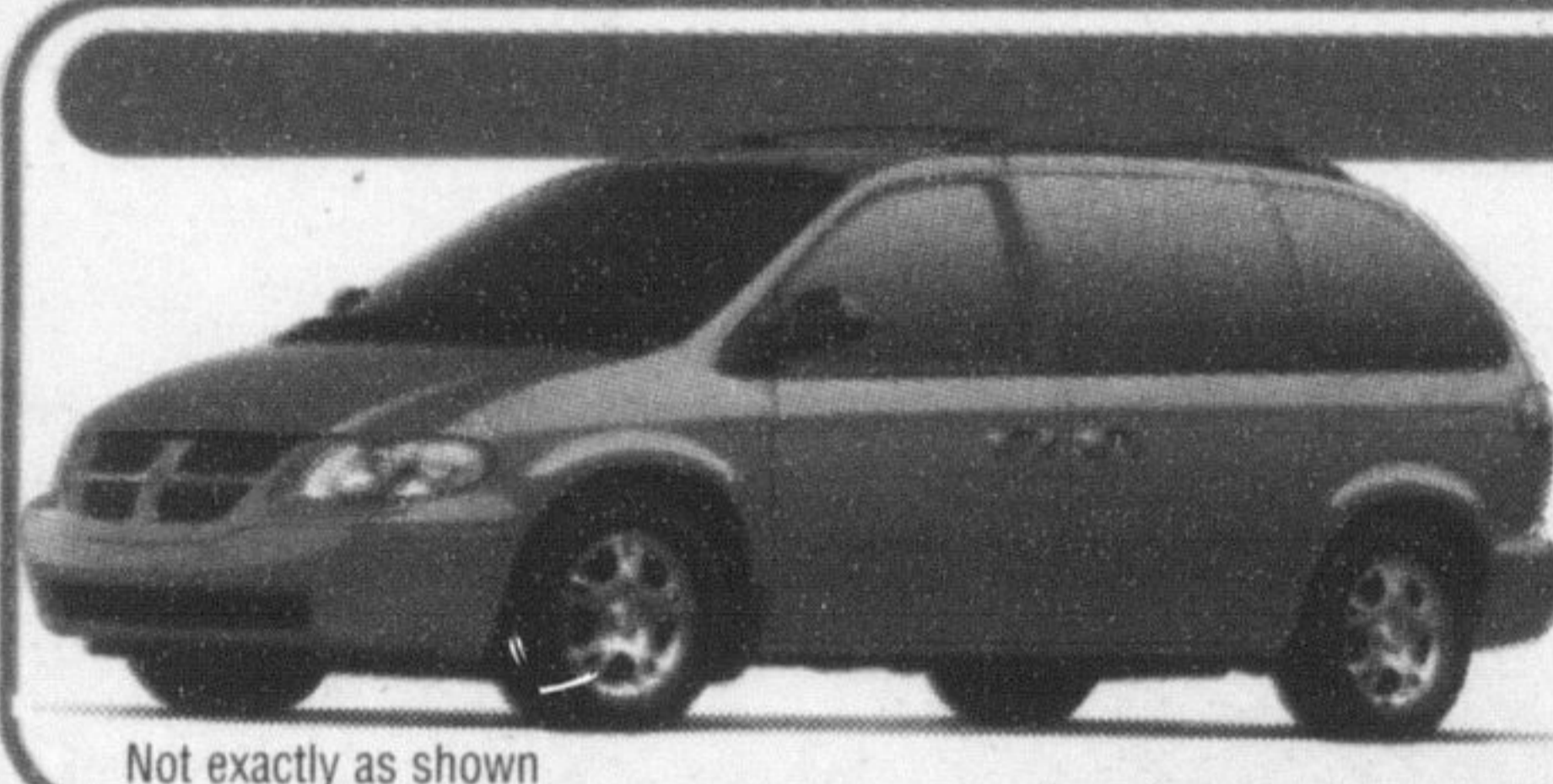
Not exactly as shown