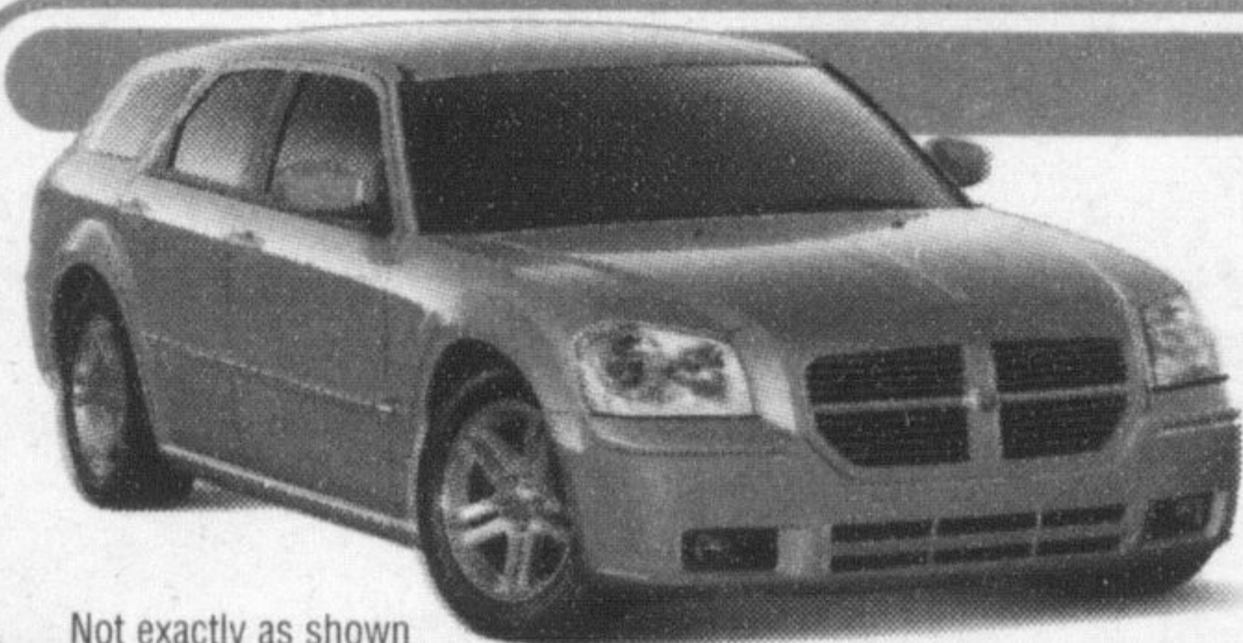
Not exactly as shown

Check out these amazing deals. Make sure you notice all the high content of equipment on our vehicles that you won't see advertised elsewhere!