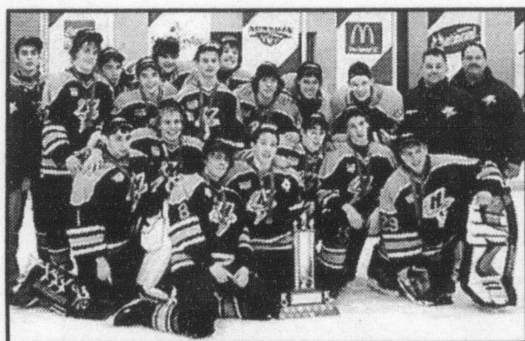
Halton's AAA bantams, who included six Milton-area players this year, show off their OMHA silver medals.