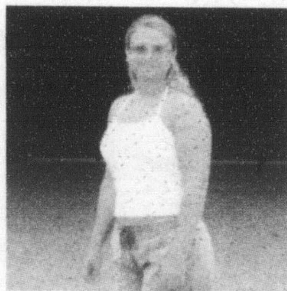
Before 172 lbs