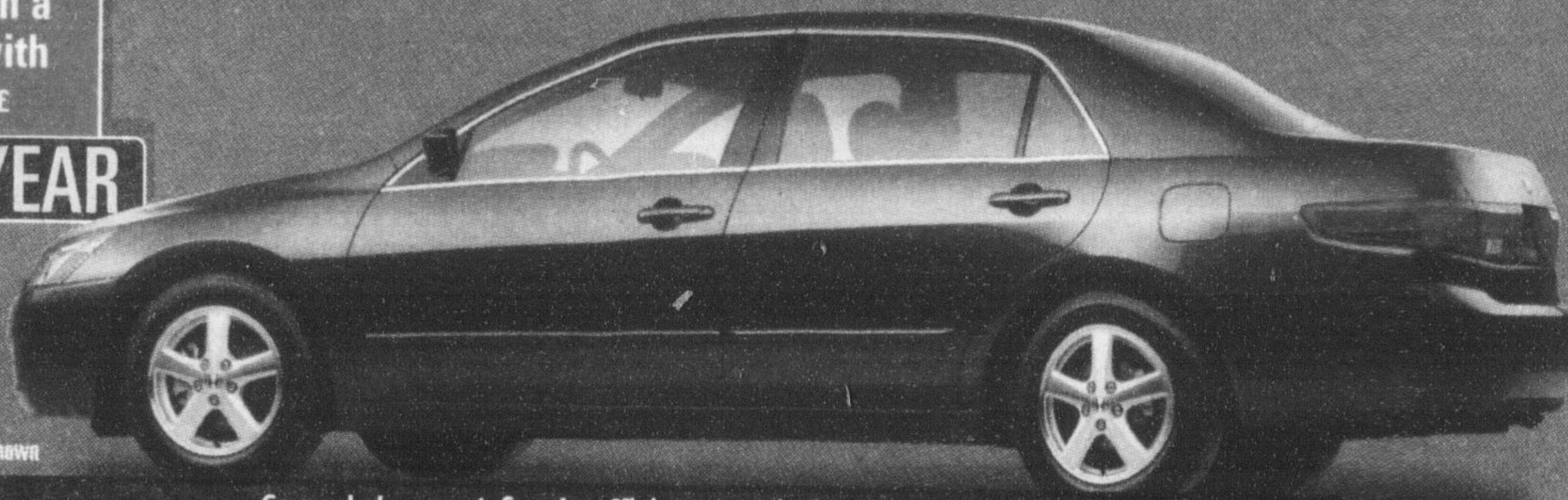
Accord Sedan EX-L model CM5665JH shown