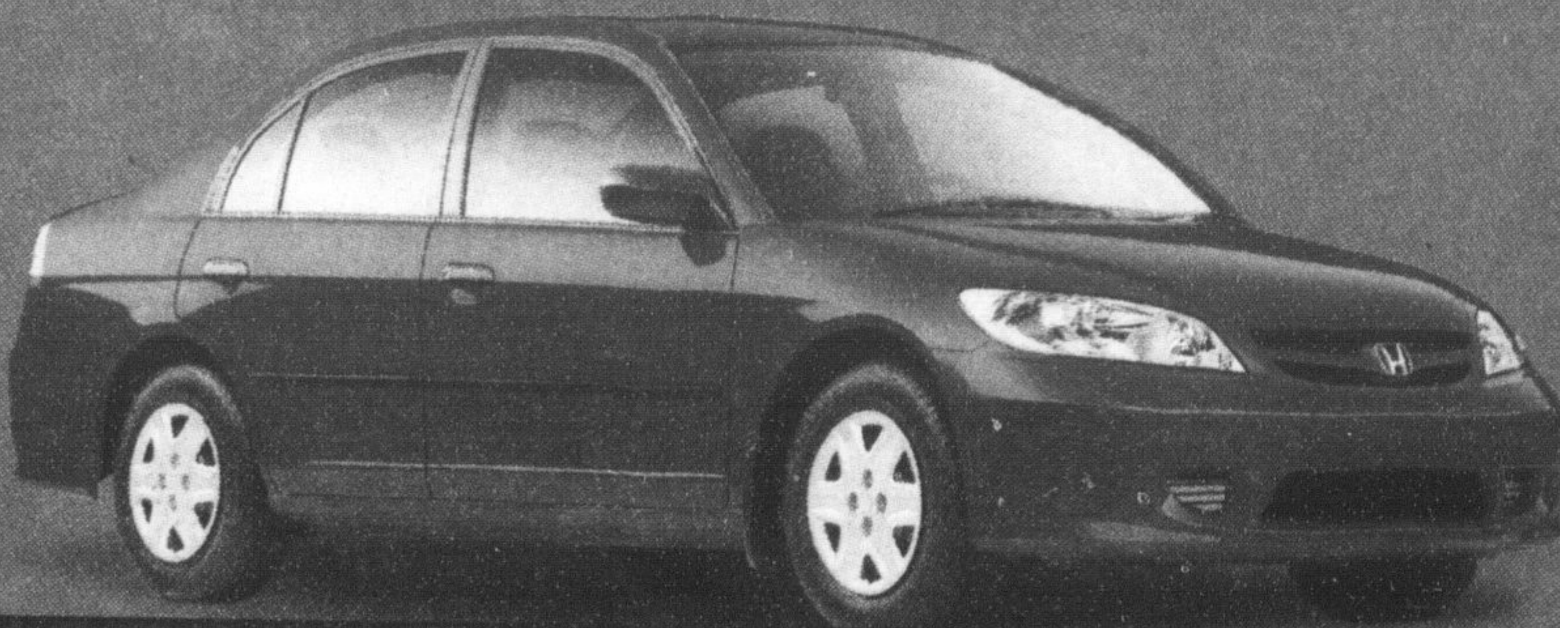
Civic Sedan SE model ES1535PX shown