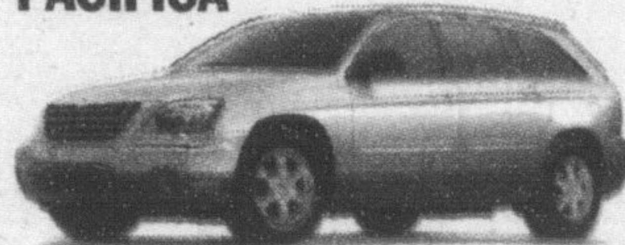
2004 Chrysler PACIFICA