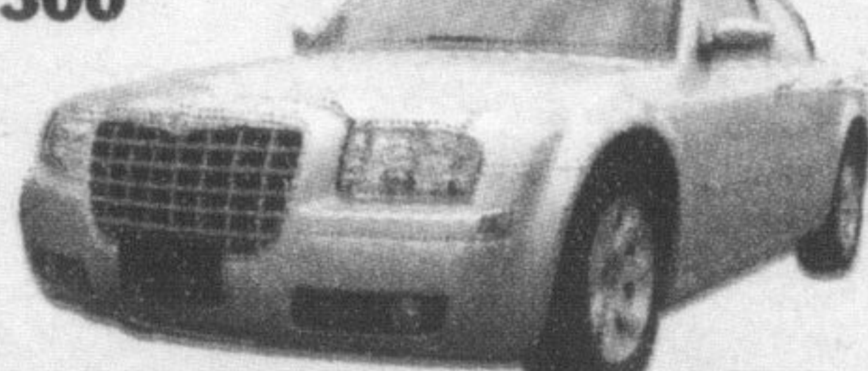
2004 Chrysler 300