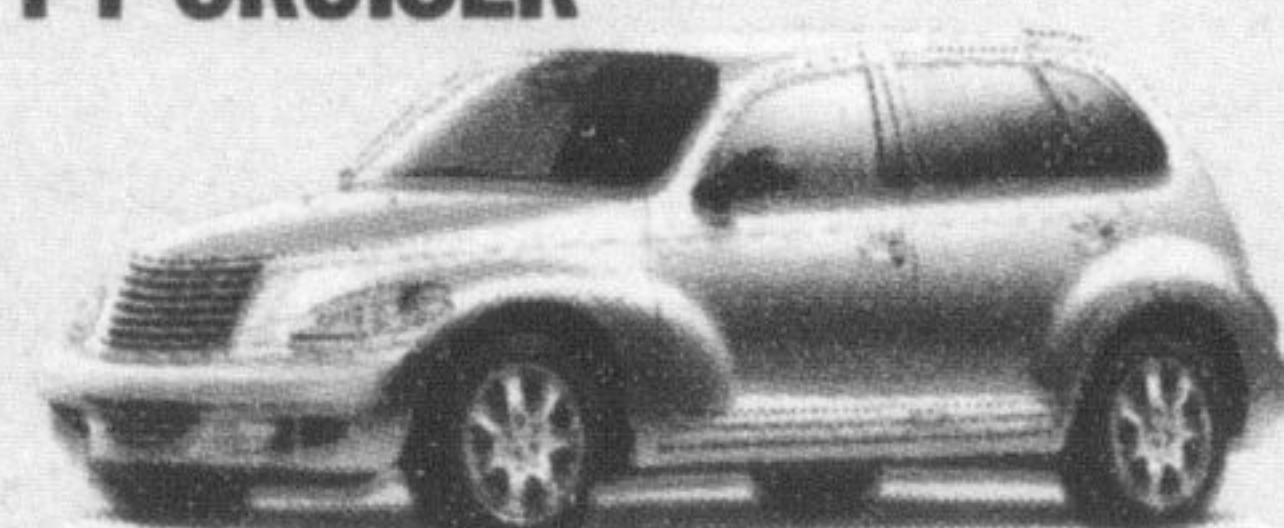
2004 Chrysler PT CRUISER