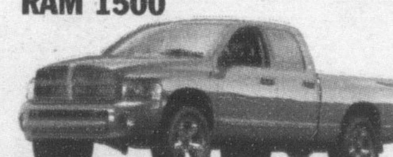
2002 Dodge RAM 1500