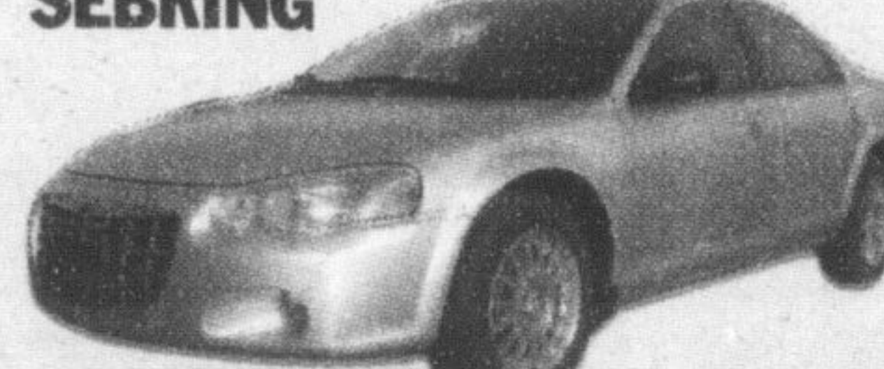
2004 Chrysler SEBRING